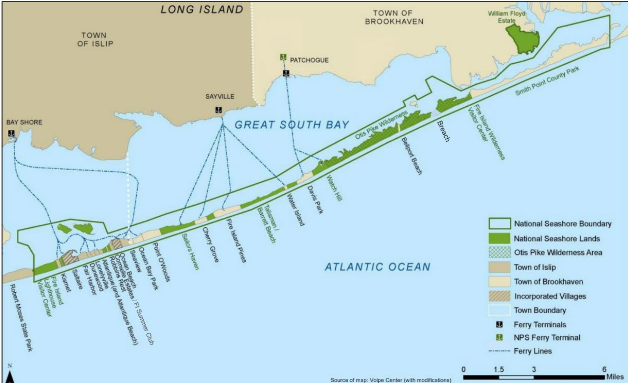
COMMUNITIES AND NPS-MANAGED LANDS ON FIRE ISLAND NATIONAL SEASHORE