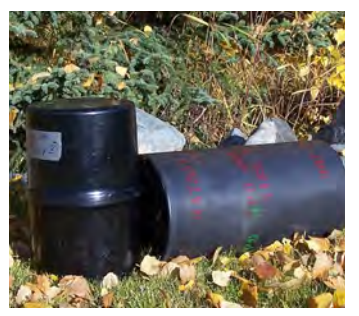
The park offers bear resistant containers for temporary use to the public. The containers are free and can be picked up at the visitor center in Port Alsworth.