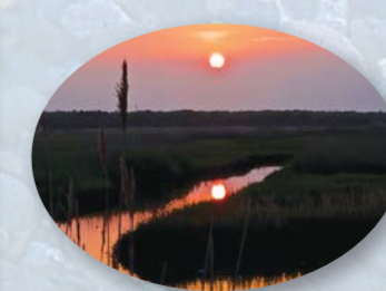
GREAT EGG HARBOR RIVER, NEW JERSEY

Senator Frank Church and Representative John Saylor spearhead efforts to pass the Wild and Scenic Rivers Act, signed by President Johnson in 1968. Eight "instant" designations are included, with additions by Congress throughout the 1970s. The system grows in the 1980s through state-specific rivers bills, such as for Alaska and Oregon.