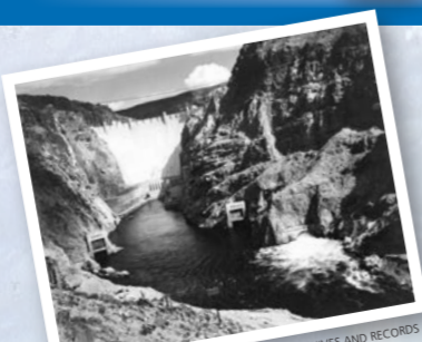
HOOVER DAM

Industrial Revolution processes use energy from flowing water. Mechanization advances from waterwheels and steam engines to hydroelectric power from reservoir-fed turbines.