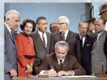
PRESIDENT LYNDON B. JOHNSON

Ecological awareness increases with publications like Rachel Carson's "Silent Spring" in 1962. Environmental and outdoor recreation movements result in the passage of the Wilderness Act and the Land and Water Conservation Fund Act in 1964. President Lyndon B. Johnson calls for "a wild rivers bill" in 1965.