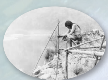
HUPA PLATFORM FISHING

For thousands of years, indigenous people gain both physical and spiritual nourishment from rivers—a sustainable coexistence that enables human settlement, exploration, trade, and travel.