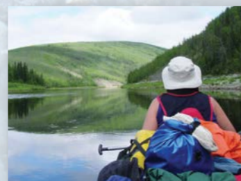
NODWINA RIVER, ALASKA