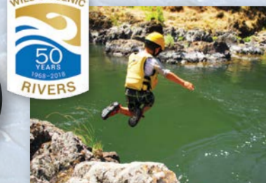
ROGUE RIVER, OREGON

The National Park Service and local jurisdictions join together to protect and enhance Great Egg Harbor River, the first designated wild and scenic "partnership" river. The Interagency Wild and Scenic Rivers Coordinating Council forms in 1995 to improve coordination among the four federal agencies administering the Act.