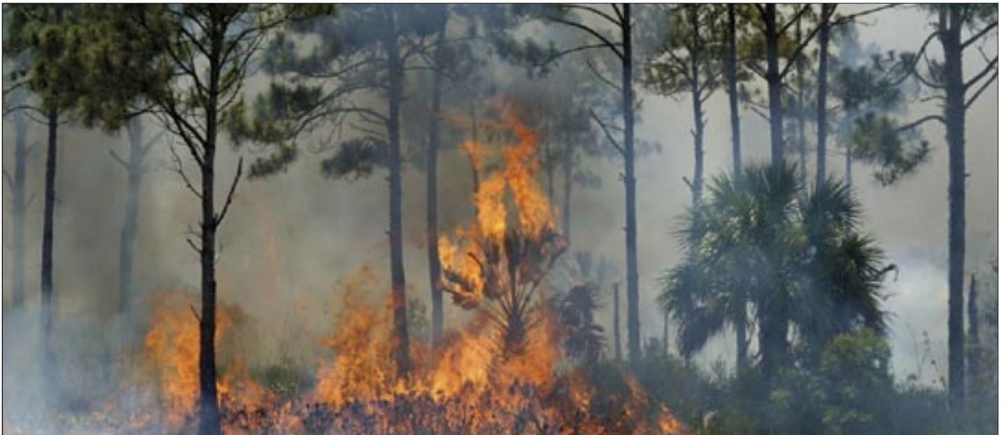
Fire plays a vital role within pineland habitats.

A The Florida Department of Transportation has maintenance and repair responsibilities for the I-75 corridor, including the fence along the right-of-way. Access through the fence at any location other than current access locations without a permit from the FDOT would be a violation of regulations.