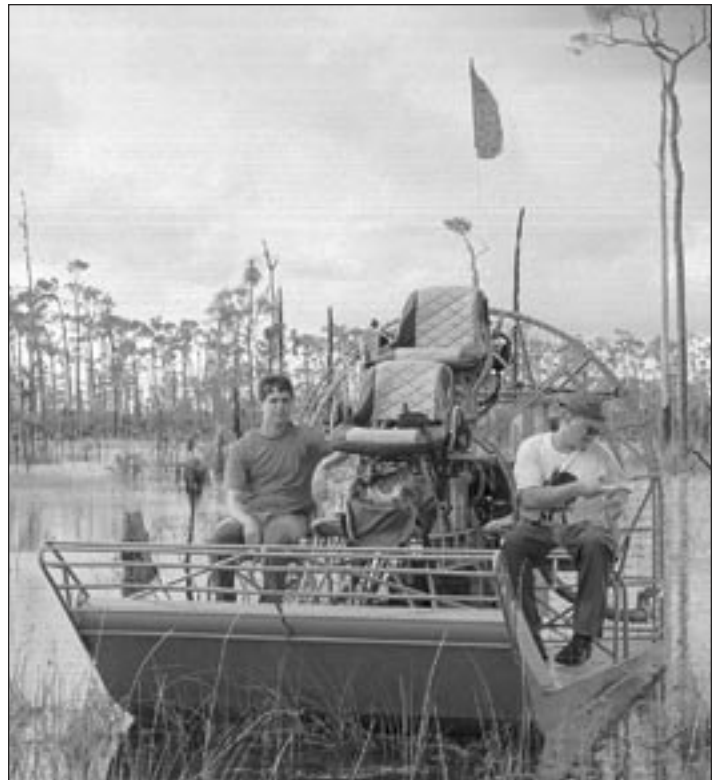
Airboat in Zone 4 of the Stairsteps Unit.

A Yes, the Preserve is located within the Big Cypress Area of Critical State Concern, and all land within the Preserve boundary is part of the Big Cypress Type 1 Wildlife