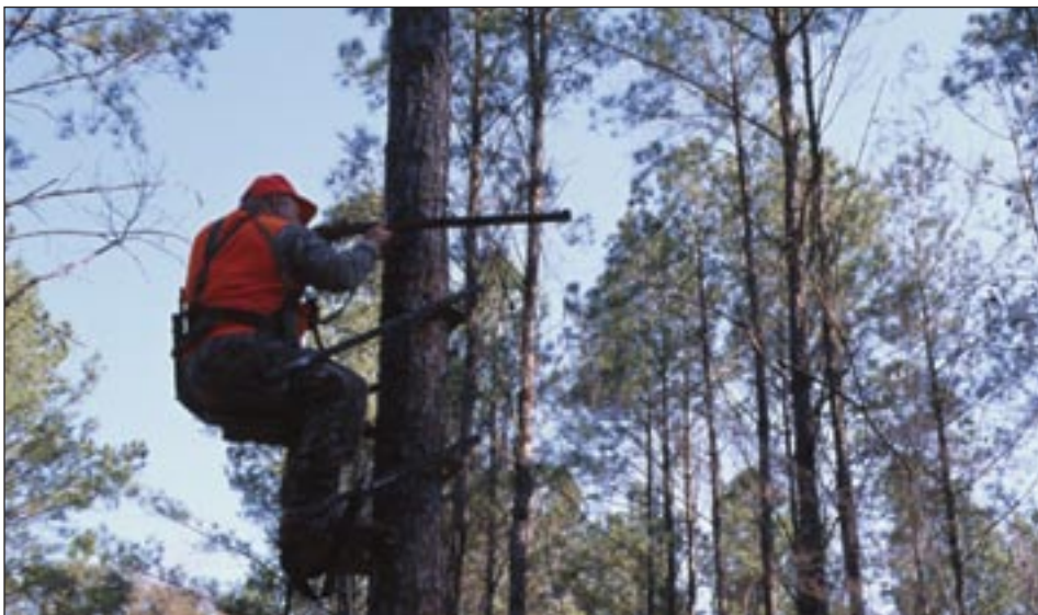
Hunting is one of the special recreational uses allowed for within the preserve.

A The Preserve provides primary enforcement of hunting activities under Federal and State rules and regulations. As the Preserve is a State Wildlife