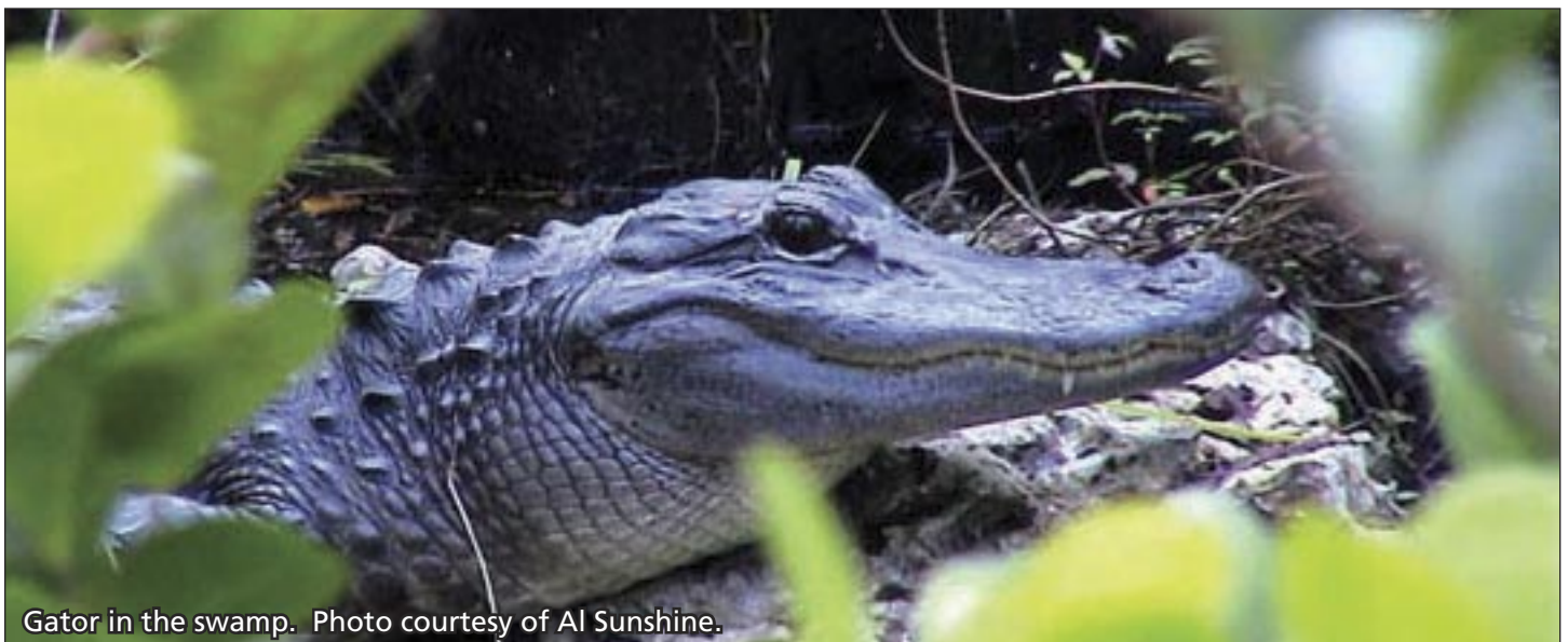
Gator in the swamp.

• A second type of improved property can be any other building for which construction began before November 23, 1971 in the original Preserve, and January 1, 1986 in the Addition. This building must have been constructed and used in accordance with all applicable State and local laws and ordinances. The Secretary of the Interior is to designate an acreage that is reasonably necessary for the continued enjoyment and use of the building in the same manner and to the same extent as existed on November 23, 1971 or January 1, 1986 as the case may be. An example of this type of improved property would be a commercial campground. Hunting camps that are located legally within the Preserve and are weekend retreats also fall into this category. We refer to this type of exemption as an “ii” (double i) exemption.