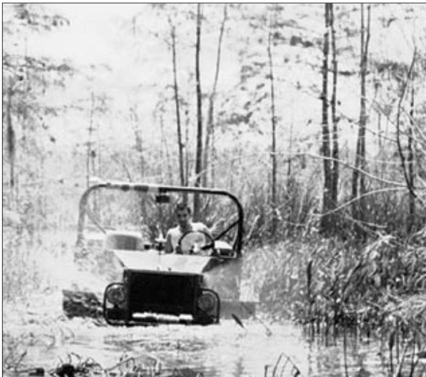
Early buggy in the backcountry.

A Yes. As a part of the land acquisition program, the NPS keeps a record of qualifying improved properties. If you want to find out if your property is qualified, you may request instructions and an application from the NPS so you can begin the process. At the time you apply, you should provide supporting documentation that shows the property has been owned and occupied, or began construction of, a one family dwelling or other building before November 23, 1971, for the property within the original Preserve or January 1, 1986 for property within the Addition. NPS staff are also ready to take your phone calls or meet with you to help you through the process.