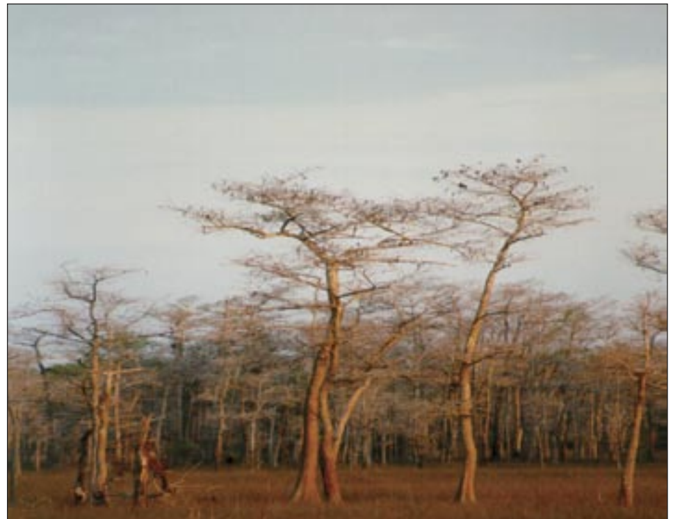
A view of Big Cypress Swamp.

A The Federal government assumed ownership and management of these lands on December 18, 1996.