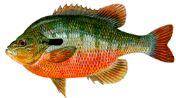
Redbreast Sunfish ( Lepomis auritus )