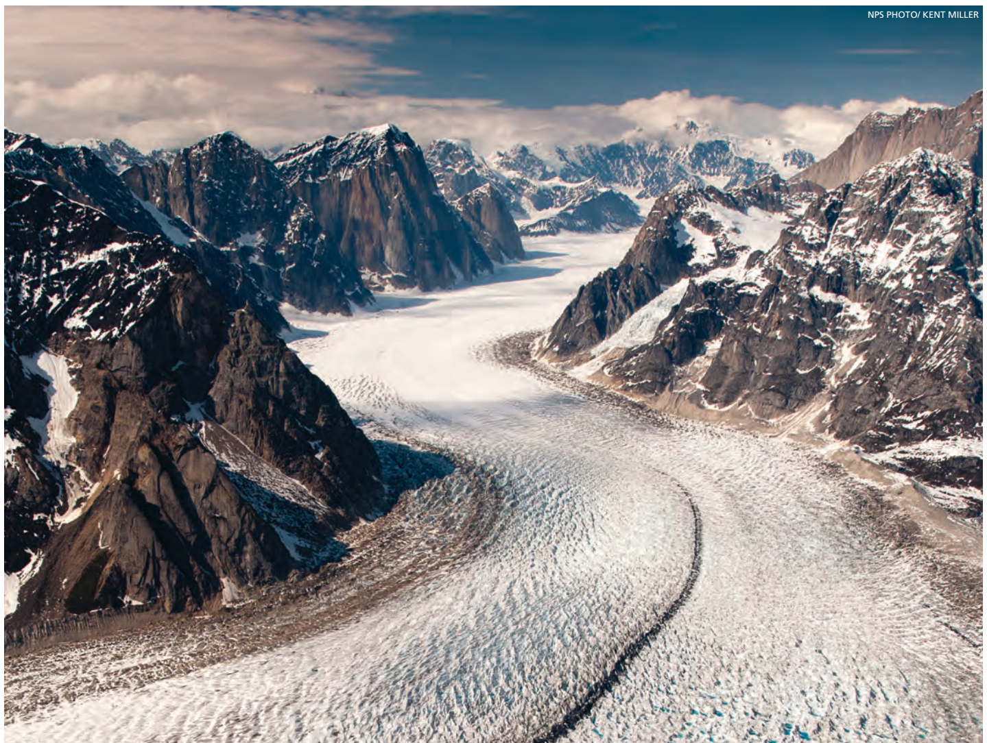
Caption: The Denali Wilderness provides some of the best habitat for glaciers because its high mountains are a cold and snowy refuge.

Installations such as telecommunications equipment, weather stations, research stations and radio collars exist on Denali's landscape with increased frequency. Managers are faced with the challenge of balancing their desire to answer scientific questions about the Denali Wilderness with their mandate of preserving its wilderness character and its wildness. Increasing technological dependence and growing visitation could drive requests for more development and infrastructure within the Denali Wilderness.