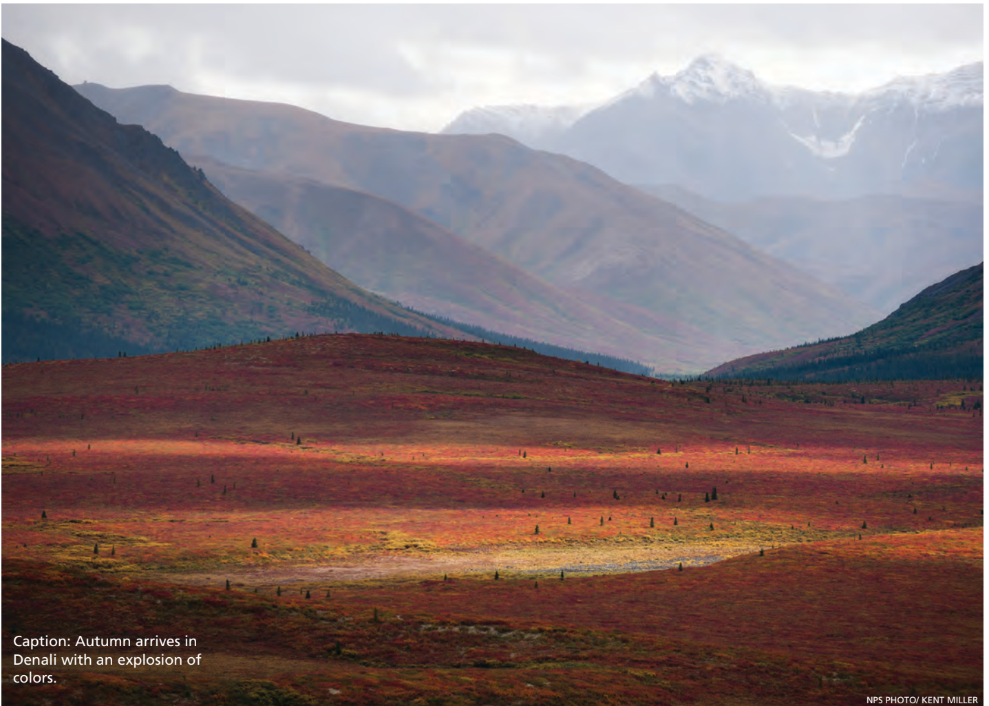
Caption: Autumn arrives in Denali with an explosion of colors.