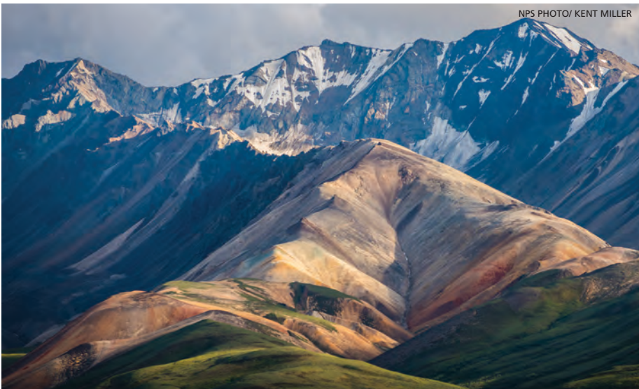
Caption: Denali’s geography encompasses a diversity of terrains and microclimates described by physiography, soils and vegetation.