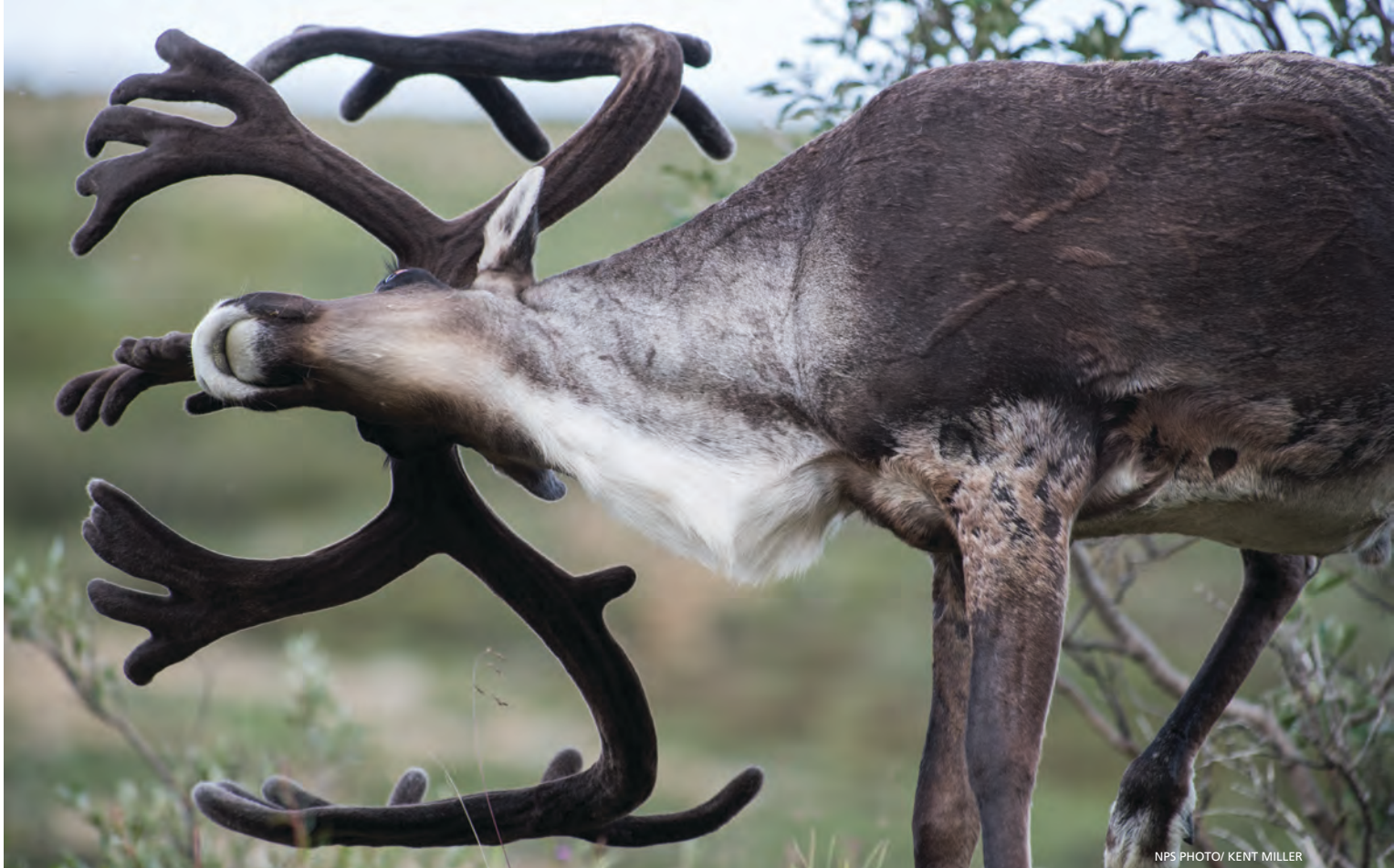
Caption: The Denali Caribou Herd inhabits most of the park east of the Foraker River and north of the Alaska Range throughout most of the year. Currently, there are approximately 1,760 caribou in Denali.

between. Coats of mammals, growth of antlers and flows of hormones all respond to day length or the cycles of cold and warmth.