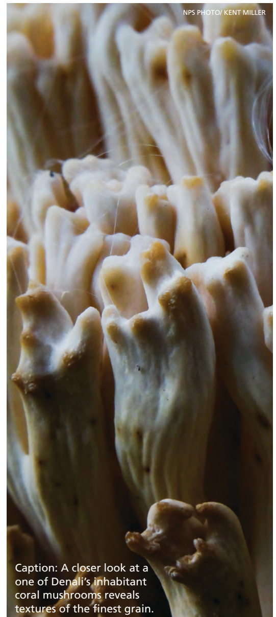
Caption: A closer look at a one of Denali’s inhabitant coral mushrooms reveals textures of the finest grain.

More threats to the untrammeled quality of the Denali Wilderness include poaching of wildlife—a rare occurrence—and the proliferation of research requests that call for the capturing and collaring of wildlife. Scientific value is an integral purpose of the area and the knowledge gained from these studies can help improve wilderness stewardship, but research must be balanced for its effects to the other qualities of wilderness character.