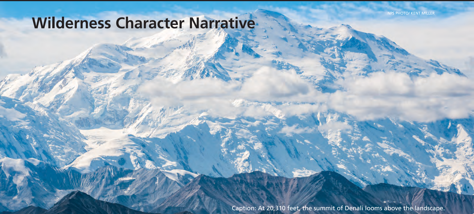
Caption: At 20,310 feet, the summit of Denali looms above the landscape.

A wilderness character narrative is a qualitative, affirming and holistic description of what is unique and special about a specific wilderness.