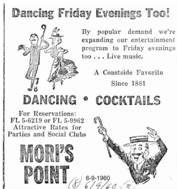
Fig. 4.4: 1960 advertisement for dancing on Friday evenings at Mori's Point.

at the Inn. About 1956, the Inn's clientele may have been enlarged by the addition of a swimming or fishing pond at Laguna Salada. In addition, just to the north, the Fairway Park subdivision was completed in 1958.