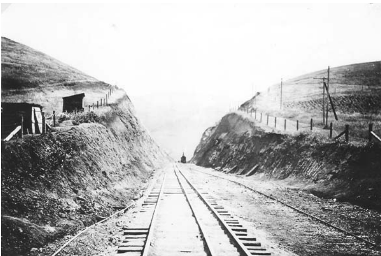
Fig. 4.3: Photo of the railroad cut south of Sharp Park (looking south).

Early on, residents began dreaming of a railroad that could break this isolation. On the Bayside, the San Francisco-San Jose Railroad was successfully completed in 1864. For the Coastside, the depressed economic conditions of the 1870s dampened hopes that were revived again in the 1880s. 46 Still Coastsiders would have to wait for the organization of the Ocean Shore Railroad in 1905 before a railroad could relieve their transportation woes.