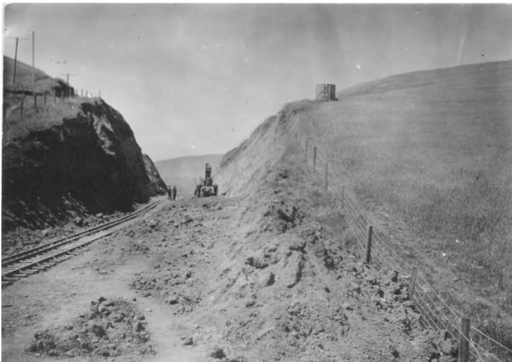
Fig. 4.2: Photo of the railroad cut south of Sharp Park (looking north).

mild winters, tall forests: all invited exploitation. However, while the natural resources were present, the topography of the coast played against the pioneers. With San Pedro and Montara Mountains to the north, the coastal mountains to the east, the chalklike cliffs of Santa Cruz County to the south and the Pacific Ocean, without an adequate natural harbor to the west, the people of the coast were sealed into their section of the County.