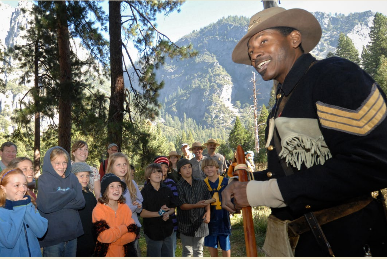
DOI / TAMI HEILEMAN