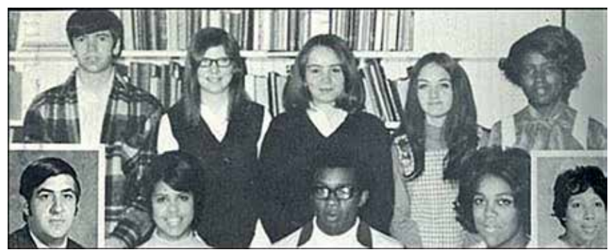
Yearbook Photograph of Integrated Student Government Body, New Kent High School, New Kent County, Virginia (National Register of Historic Places, Teaching with Historic Places photograph, courtesy of New Kent County Schools, Virginia).