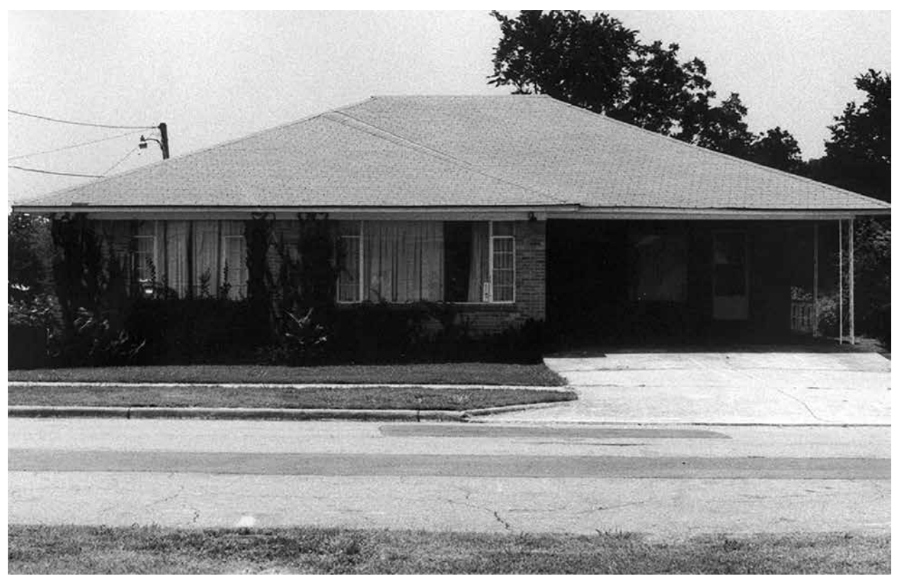
Daisy Bates House, Little Rock, Arkansas (National Historic Landmark photograph).

Throughout this crisis and during the 1957-1958 school year, the Little Rock Nine used the Bates House as a planning place, an official daily pick-up and drop-off point, and a place to be counseled and consoled. Daisy Bates also served as liaison with parents and local and federal officials in planning how desegregation would proceed. The Bates House stands as a symbol of the role of civil rights advocates who fought against legal and social obstacles to educational opportunity for African-American youth during a period of southern massive resistance to desegregation. The Daisy Bates House was designated a National Historic Landmark by the Secretary of the Interior on January 3, 2001.