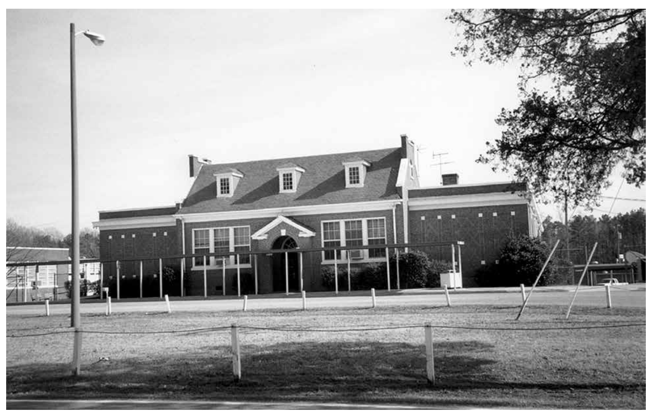
New Kent School, 1930 Building, New Kent County, Virginia (National Historic Landmark photograph).

The New Kent School and the George W. Watkins School are associated with the most significant public school desegregation case the U.S. Supreme Court decided after Brown v. Board of Education . The 1968 Green v. County School Board of New Kent County decision set the standards that judges would use to determine whether school districts were in constitutional compliance in school segregation cases. Thus, a decade of massive resistance to school desegregation in the South from 1955-1964, was replaced by an era of massive integration from 1968-1973, as the Court placed an affirmative duty on school boards to integrate schools.