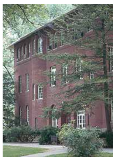
Lincoln Hall, Berea College (Photograph from National Register of Historic Places Online Itinerary "We Shall Overcome, Historic Places of the Civil Rights Movement," courtesy of Berea College).

A private school founded in 1855, Berea College was the first college established in the U.S. for the specific purpose of educating black and white students together. In 1904 the Kentucky state legislature mandated that black and white students could only be taught simultaneously if they were taught twenty-five miles apart. The U.S. Supreme Court upheld the state's right to pass laws to regulate state chartered private institutions on the basis of race, thus lending additional credence to do the same for public schools. This is the only instance in which the U.S. Supreme Court upheld school segregation in higher education. Lincoln Hall was designated a National Historic Landmark on December 2, 1974.