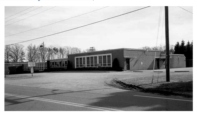
George W. Watkins School, New Kent County, Virginia (National Historic Landmark photograph).

The New Kent School and the George W. Watkins School were designated a National Historic Landmark by the Secretary of the Interior on August 7, 2001. An online lesson plan, "New Kent School and the George W. Watkins School: From Freedom of Choice to Integration," is available online through the Teaching with Historic Places (TwHP) web-site (<a href="https://www.nps.gov/subjects/teachingwithhistoricplaces/index.htm">https://www.nps.gov/subjects/teachingwithhistoricplaces/index.htm</a>).