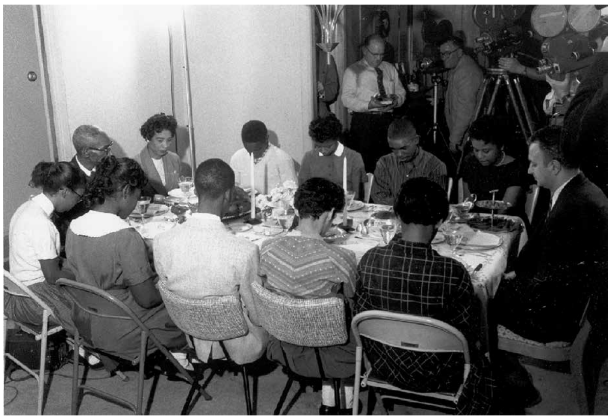
Daisy Bates House, Little Rock, Arkansas, Thanksgiving Dinner, 1957 (National Historic Landmark photograph, courtesy of Will Counts).

The Daisy Bates House is nationally significant for its role as the de facto command post for the Central High School desegregation crisis in Little Rock and its association with Daisy Bates who was at the forefront of black community efforts to desegregate the school. The house served as a haven for the nine African-American students who desegregated the school and a place to plan the best way to achieve their goals. This event marks a milestone in the history of school desegregation when, for the first time, a U.S. President used federal powers to uphold and implement a federal court ruling regarding school desegregation.