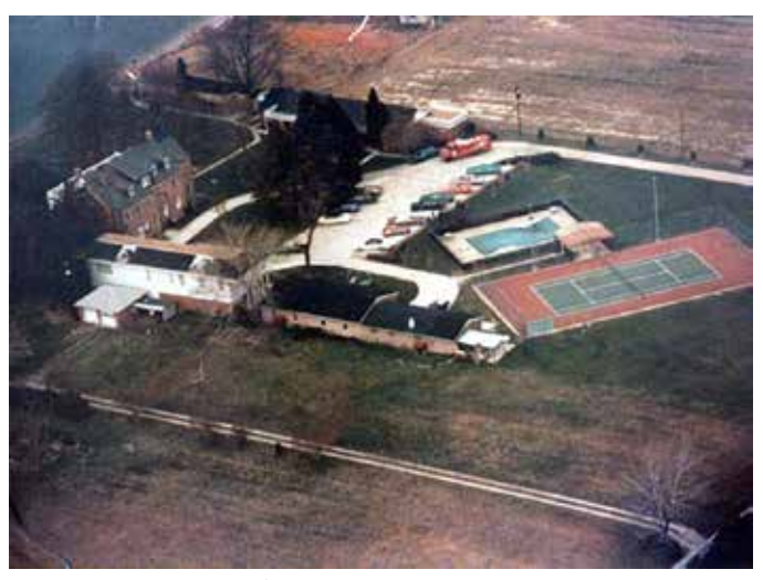
Robert R. Moton Conference Center (National Historic Landmark photograph).

Moton High School was the run down high school where its students initiated a strike for equal facilities and subsequently filed suit against school desegregation. It was among the school segregation cases consolidated in Brown v. Board of Education (1954) before the U.S. Supreme Court case that struck down the "separate but equal" doctrine governing public school policy. Subsequently, it is associated with Virginia's efforts at "massive resistance" to school integration when Prince Edward County closed its public schools. Moton High School was designated a National Historic Landmark on August 5, 1998.