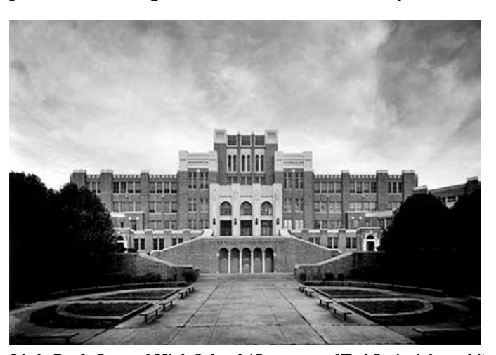
Little Rock Central High School.

Central High School stands as the first test of national resolve under the Eisenhower administration to enforce black civil rights in the face of massive southern defiance during the period following the 1954 Brown v. Board of Education decision. On September 25, a day after