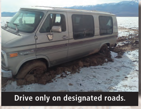
Drive only on designated roads.

Rental vehicles are discouraged from traveling on any backcountry dirt road. Rental agreements frequently prohibit driving off pavement, and may not cover towing, recovery, or other emergency services. Full size spare tires and tools are often not included. Towing services from dirt roads often exceed $2,000.