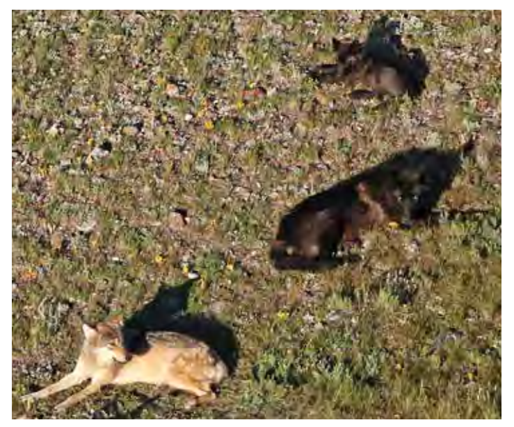
The 8-mile pack, two adults with a pup, do what wolves do in summer during the day—rest!

four of which lived to the end of the year. Another daughter dispersed to form a new group in the Fan Creek/Gallatin River area (see 963F group summary). The 8 Mile pack remained one of the largest on the Northern Range and in the fall a group of mostly young males split off from the main pack (see 1108M group summary). This is the fifth group that dispersing 8 Mile wolves have joined or established in the last four years.