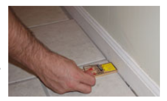
Figure 2. Proper placement of a snap trap. Note the bait is toward the wall. A second trap should be placed next to the first.

Set the snap trap by holding the wooden base of the snap trap firmly in your hand or stabilize it against the floor. Carefully pull the spring-loaded bow up then down to the opposite side of the snap trap. Holding the bow down against the opposite side of the snap trap, carefully place the locking bar over the bow and secure the locking bar in the metal loop provided. The bait pan side of the trap should face the wall (Figure 2).