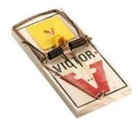
Figure 1. Image of a snap trap. Note the large yellow square, or expanded trigger.

Always! Snap traps are both a monitoring tool and a removal tool; they help alert you to rodent activity and reduce contamination by killing rodent before they do too much damage. Snap traps have been proven to be the most effective method of trapping rodents indoors, and are also considered the safest for both humans and non-target wildlife. Keep them set year-round!