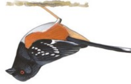
Spotted Towhee ( Pipilo maculatus ) L 8.5" WS 10.5"

Short blunt tipped bill, small stocky body, short rounded wings, short tail, mostly blue with orange breast, seen in small groups searching for seeds and insects.