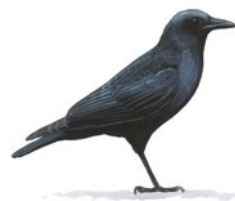
Crow ( Corvus brachyrhynchos ) L 17.5" WS 39"

Short bill, small head, slender body, narrow pointed wings, long pointed tail, brown-gray with spots on wings, seen resting on wires or foraging on ground for seeds. Call is a sad hoot boo-hoo-hoo