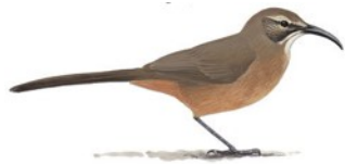
California Thrasher ( Toxostoma redivivum ) L 12" WS 12.5"

Thick billed, crestless head, sturdy body, broad round wings, long tail, dark to light gray underside, seen flying tree to tree, feeds on seeds, nuts, fruits, and insects.