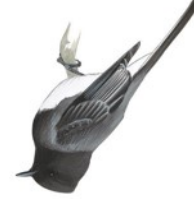
Black Phoebe ( Sayornis nigricans ) L 7" WS 11"

Short, conical bill, small stocky body, rounded wings, long tail, brownish-gray with light chest, white center and eyebrows, winter group forager.