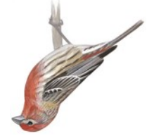
House Finch ( Carduelis mexicanus ) L 6" WS 9.5"

Stout dark bill, rounded wing, oval body, short tail, gray-brown with bright yellow-spot on rump usually seen when flying away, see in small perched flocks, quick flight