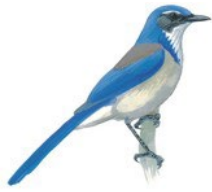
Western Scrub-Jay ( Aphelocoma insularis ) L 11.5" WS 15.5"

Thick billed, crestless head, sturdy body, broad round wings, long tail, dark to light gray underside, seen flying tree to tree, feeds on seeds, nuts, fruits, and insects.