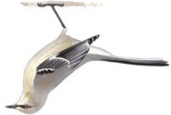
Mocking Bird ( Mimus polyglottos ) L 10" WS 14"

Short bill, small slightly stocky body, rounded wings, long tail, mostly gray with white patches on wing and tail, seen alone defending trees eating insects and fruit.