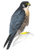
Peregrine Falcon ( Falco pergrinus ) L 16" WS 41"

Long slightly hooked bill, shaggy throat, long narrow wings, wedge-shaped tail, black, seen soaring, diverse diet, raspy voice.