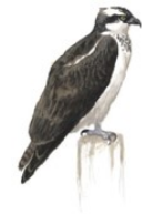
Osprey ( Pandion haliaetus ) L 23" WS 63"

Short hooked bill, stocky broad body, rounded wings, red on tail top, sharp talons, black edge on underside of wing, seen hunting small mammals from perch