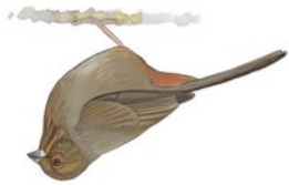
California Towhee ( Pipilo crissalis ) L 9" WS 11.5"

Short conical bill, medium stocky body, rounded wings, dark brown-gray color, cinnamon under tail, seen alone in the open and brush feeding on seeds, fruit,