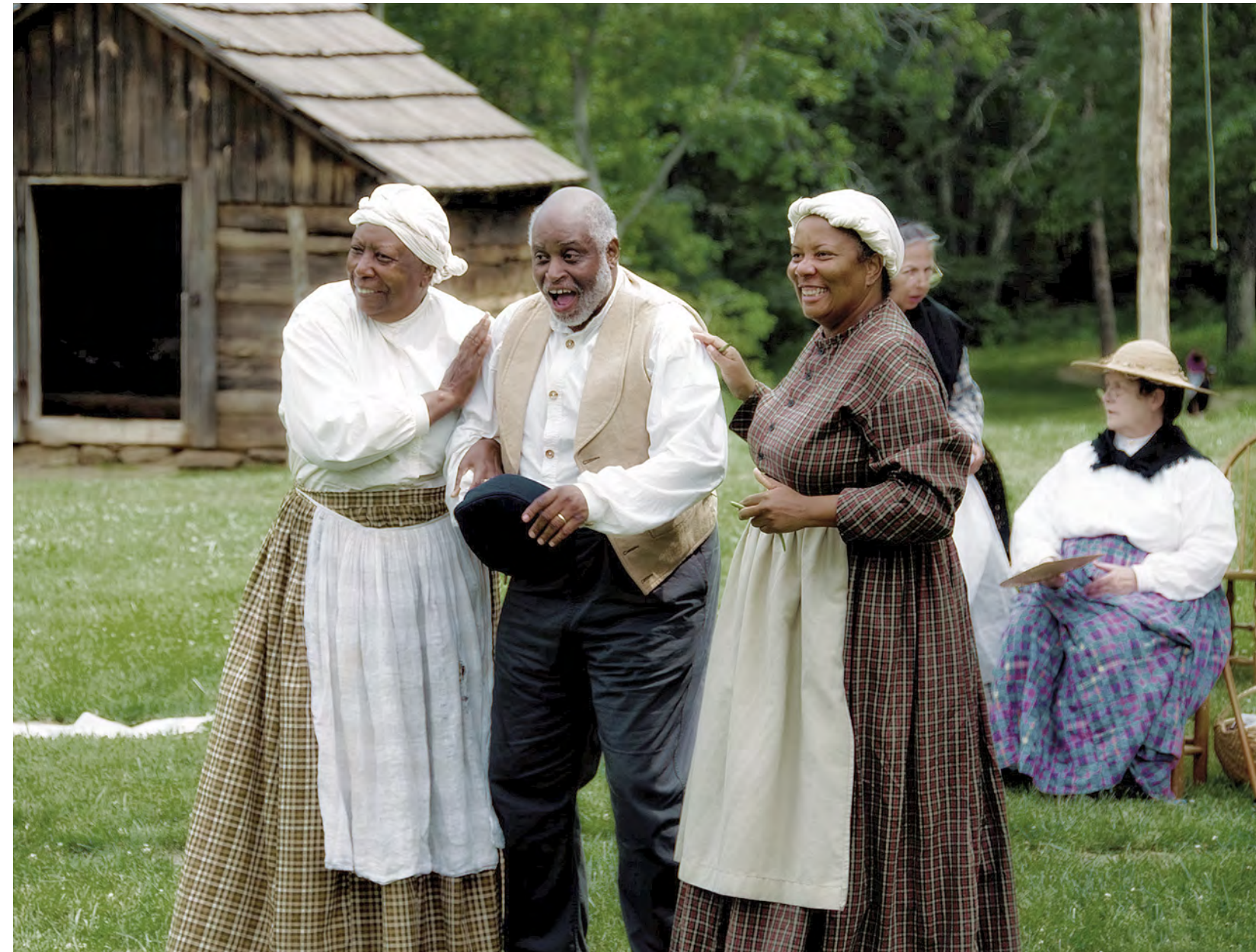
Volunteers at Booker T. Washington National Monument portray residents of the Burroughs Plantation receiving the news that they are free with the reading of the Emancipation Proclamation at the annual Juneteenth event, 2011.