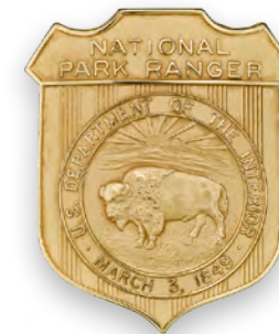
NPS badge 1970–present

America has changed dramatically since the birth of the National Park Service in 1916. The roots of the National Park Service lie in the parks' majestic, often isolated natural wonders and in places that exemplify our cultural heritage, but their reach now extends to places difficult to imagine 100 years ago—into urban centers, across rural landscapes, deep within oceans, and across night skies.