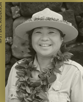
FLIGHT 93 NATIONAL MEMORIAL

It is natural and fitting to dedicate myself to work toward continuing to preserve the superlative natural and cultural values of the Pu'uhonua through my own cultural heritage.