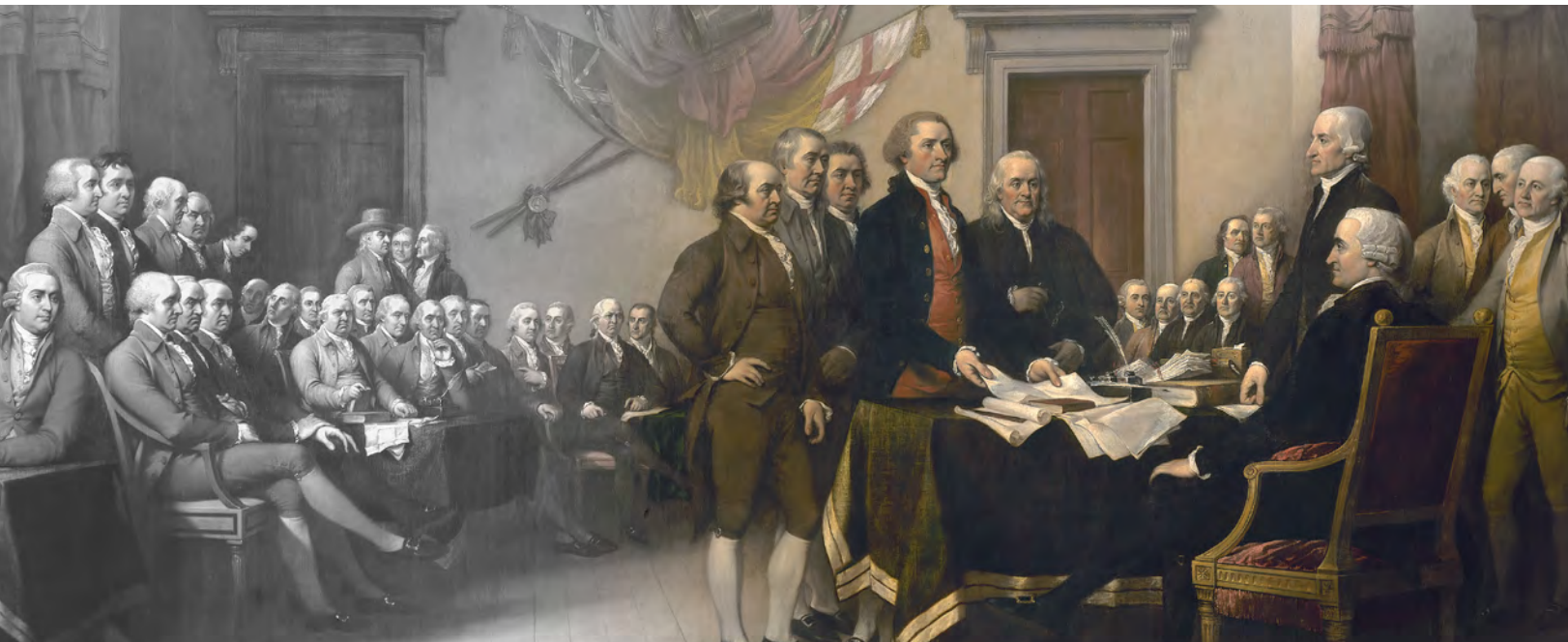
1819 JOHN TRUMBULL / ASSEMBLY ROOM INDEPENDENCE HALL

WE HOLD THESE TRUTHS TO BE SELF-EVIDENT, THAT ALL MEN ARE CREATED EQUAL, THAT THEY ARE ENDOWED BY THEIR CREATOR WITH CERTAIN UNALIENABLE RIGHTS, THAT AMONG THESE ARE LIFE, LIBERTY, AND THE PURSUIT OF HAPPINESS.