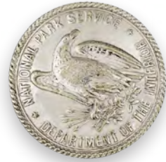
First NPS badge

In its first century, the National Park Service focused on stewardship and enjoyment of special places, reflecting the core mission articulated in the NPS Organic Act. The result is a National Park System that encompasses America's exceptional places, including those where civic engagements—often confrontational and sometimes violent—have shaped who we are as a people: Selma to Montgomery, Brown v. Board of Education, Manzanar, the Statue of Liberty, and Flight 93, to name a few. In these national parks we learn not only of people who left their marks on the present, but how individuals can offer the next generation a better future. From the solemn battlefields of Yorktown and Gettysburg to the silent waters that embrace the USS Arizona , national parks also include places where we learn about honor, bravery, patriotism, and sacrifice. In the cathedral forests of Redwood, in the call of the Denali wilderness, and in the quiet of Grand Canyon, we are reminded of the wonder of nature, of the breadth of park resources, and of our stewardship responsibilities.