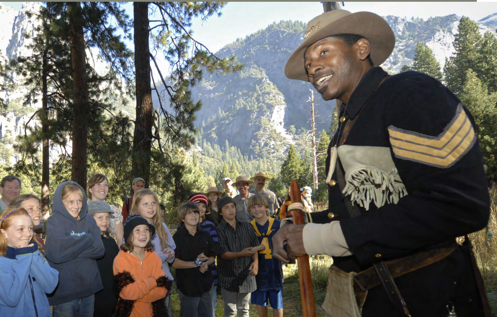
DOI / TAMI HEILEMAN