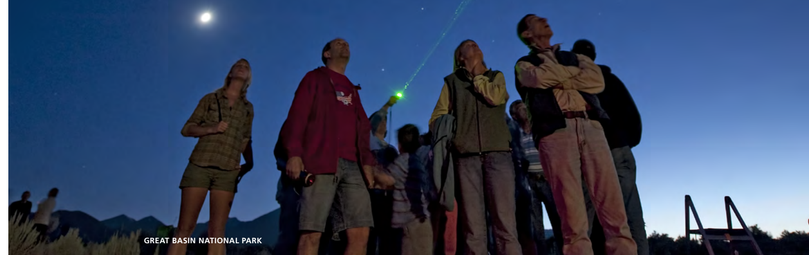
GREAT BASIN NATIONAL PARK