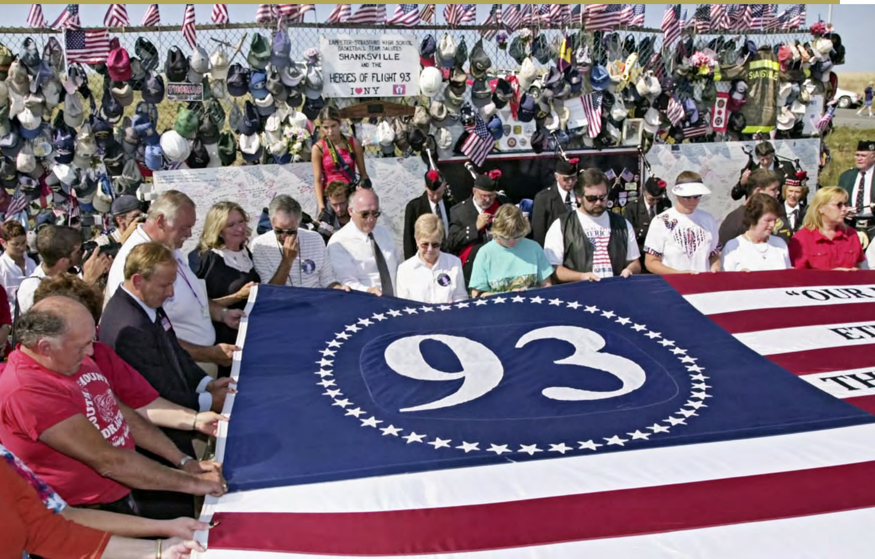
REPRINTED WITH THE PERMISSION OF THE PUBLISHER TRIBUNE DEMOCRAT / JOHN RUCOSKY