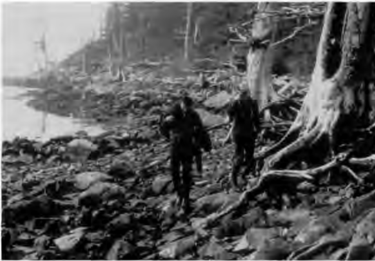
Archeological survey at McArthur Pass, Kenai Fjords National Park, after the Exxon Valdez oil spill. Note the darker, oiled rocks along the shoreline.

archeological preservation with park management had begun to stall. What is more, the involvement of outside cooperators was nearly nonexistent as were our consultative relationships and partnerships with the Alaska Native community. Without change we would soon be awash in a sea of ill-described lithic scatters and other sites of unknown significance and meaning.