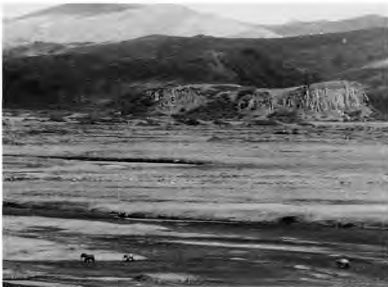
Aniakchak Bay with sow brown bear with cubs in foreground, and vegetated paleo beach berms and relic island landform in background.

region for consideration in NPS management decisions and operations, in compliance with NPS management responsibilities as outlined in Section 110 of the National Historic Preservation Act.