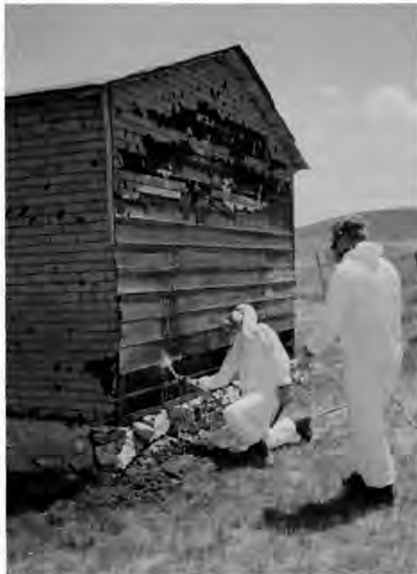
Spraying down the exterior wall in the mitigation effort.

The success of this project is largely due to a shared preservation philosophy and an integrated, holistic planning process that addressed many long term preservation issues in the context of an immediate biological threat to human health and safety. The structure and historic fabric will continue to serve as primary sources of cultural and scientific information and further support the