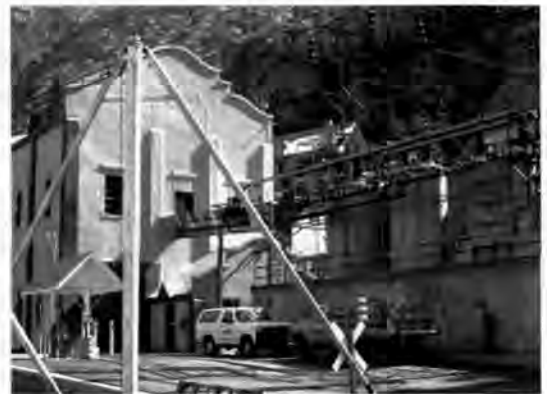
Rush Creek Power House.

interests, for example, Southern California Edison has embraced "continuity of use." Conceived by CRM consultants as an honest way to deal with working features in hydro resources, "continuity of use" expands the idea of "replacement in kind" for still-operating historical hydro facilities. 8 It legitimizes, for example, the replacement of an old wooden flowline with steel pipe because both conduit types perform the same task and the plant is in continuous operation. "Function" thus becomes as much a part of historical integrity as location, setting, design, workmanship, materials, association, and feeling. Consequently, managing an operating hydropower project by "continuity of use" means making the primary preservation objective the efficient, cost-effective maintenance of project elements in