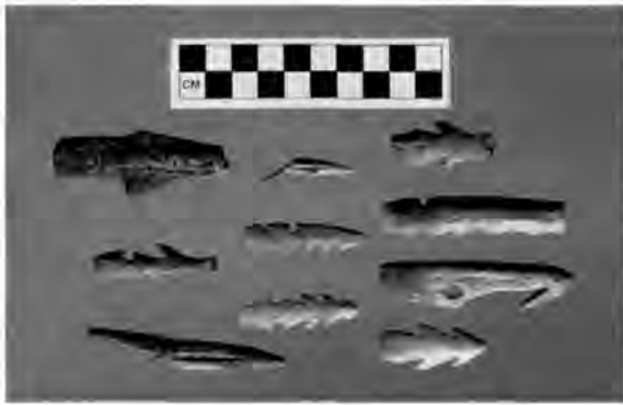
Bone harpoon points from Late Kachemak Period recovered during the first season of excavation at Mink Island.

ily accessible along this section of the Alaskan coast and constitutes a negligible percentage of the 2700 artifacts recovered during the 1997 season.