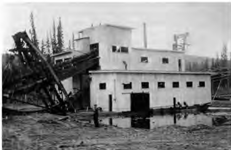
This 1936 photo shows the Coal Creek dredge just before completing construction with the major components in place. The digging ladder and bucket line (left) are in place and the framework for the stacker (right) is beginning to take shape.