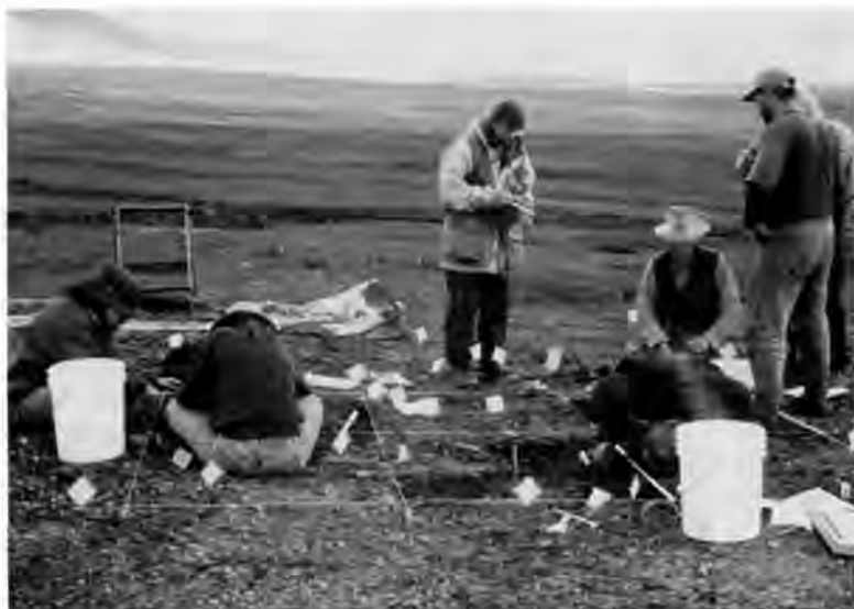
Archeological test excavations at the Irwin Sluiceway Site, an Early Man site in the upper Anisak drainage in Noatak National Preserve. This project was a collaborative effort between the national Park Service and the Smithsonian Institution.