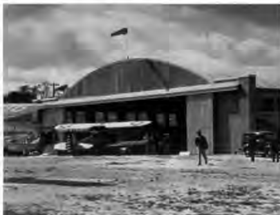
Left, hanger #1 at Moton Field during World War II. Right, hanger #1 at Moton Field in 1997.

For more information contact: Tuskegee Airmen Study, National Park Service, Southeast Regional Office, Atlanta Federal Center—1924 Building, 100 Alabama Street SW, Atlanta, GA 30303.