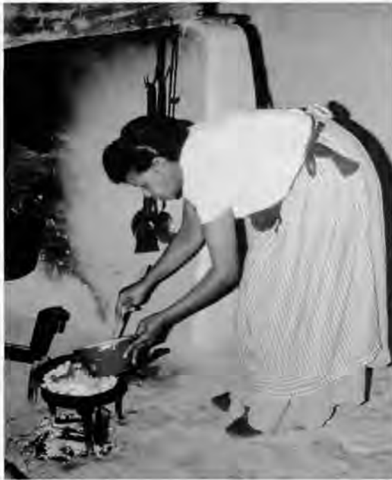
A volunteer demonstrates open hearth cooking.

room (a mixture of reproductions and period pieces) it is imperative that objects are not moved. From a security perspective, a static exhibit is absolutely necessary in this room. As such, objects used by interpreters for trade demonstrations must come from the living history box stored behind the trade counter.