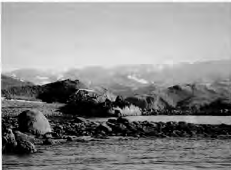
Katmai National Park coastal topography.

Katmai can be divided into three major topographic zones: the coastal zone bordering the Gulf of Alaska, the Aleutian Mountain range, and a lake