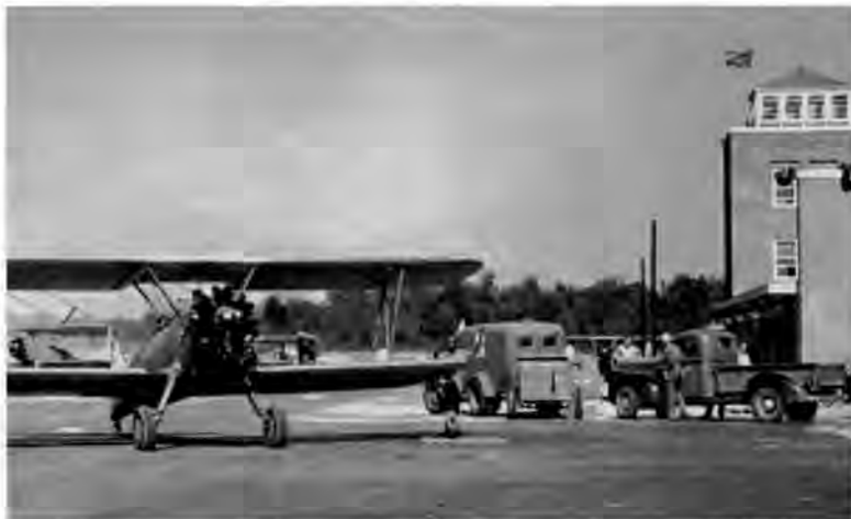
Moton Field during World War II.

Based on their research, the study team determined that the importance of the Tuskegee Airmen not only deals with their primary training at Moton Field and their courage in battle during World War II, but also embraces the struggle to end racial discrimination and segregation in the U.S. military and in American society. Members of the 477th Bombardment Group, frustrated with their "separate but equal" training, staged an important non-violent demonstration to desegregate an officer's club and helped set the pattern for protests later popularized in the modern civil rights movement. The airmen also include the thousands of African-American men and women in civilian and military support groups, whose dedication and