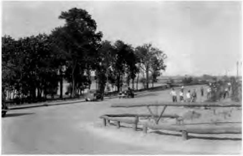
FIGURE 2 This ca. 1935 view shows a nearly completed parking area at Roaches Run Bird Sanctuary in Arlington, Virginia.

eliminated. Some CCC projects, such as seeding and sodding grounds or laying drainage pipes, were beyond the inventory's scope because they were ephemeral in nature or now accessible only through subsurface investigation. Proceeding from the selected list of sites and projects, the inventory identified those that are still visible.