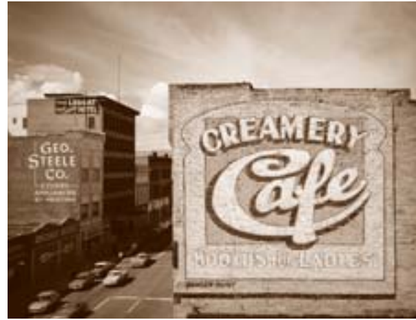
Far left: The Hardaway-Nelson House, built in 1840. Home of noted southern author Augusta Evans Wilson, the structure is an example of Alabama's Creole architecture. Above left: Antietam, in rural Maryland. The place is best known as a deadly killing field during the Civil War, but barns like this attest to a longstanding agricultural history and parallel narratives of immigration and architecture. Above right: Historic advertising in a western town.