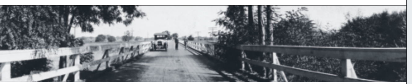
Above: Between Stockton and Livermore, California. Right top: Near Joliet, Illinois, 1915. Right bottom: Wilson Bridge over Conococheague Creek, Maryland, in operation until 1937; Cook County, west of Chicago, 1918.

Nearly a century later, the National Park Service has released a congressionally authorized special resource study on preserving and commemorating the highway. Over three years, a team of historians, architects, preservationists, and geographers evaluated the highway as a historic entity—and potential park unit—identifying how what remains expresses the era of early automobile travel. The route, which seeded a thriving roadside culture, was a venue for innovative ways to market gas, food, and lodging by way of bold graphics and architecture. The role of the early auto executives foreshadowed the later relationship between the car industry and highway construction. On the eve of