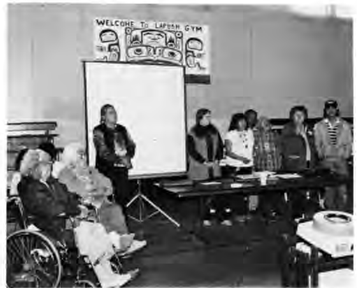
In May 1986, Federal Cylinder Project staff made a site visit to the Quileute Reservation in western Washington State.

How has the dissemination of Cylinder Project materials turned out? What happens to the collections once they are back in their communities? Not surprisingly, the answers to these questions contain some minuses along with the pluses. Almost everyone we have contacted has been enthusiastic at first about the potential benefits of having the early recordings back in their communities. However, sometimes community members suspect hidden costs or strings. Also, sometimes the enthusiasm wanes once people hear the actual recordings. This is due, in part, to the medium itself. Audiences today are not prepared for the differences between cylinder recordings and modern recordings. Cylinder recordings do not gain charm and patina over time like old photographs do. People are often put off by the surface noises or other technical problems that obscure some of the sound, making song texts difficult to decipher. Further, some persons have cherished hopes that certain specific songs and narratives were recorded, only to be disappointed that such recordings do not exist.