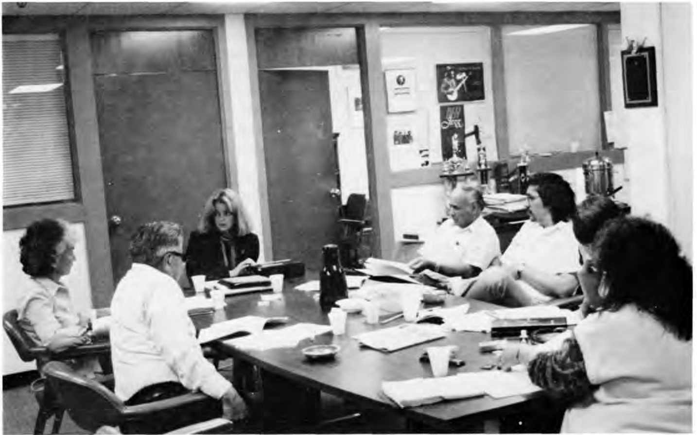
Federal Cylinder Project staff meet with the Sitka Community Association Tribal Council, Sitka, Alaska, in August 1986.

The early recordings can thus provide the stimulus for a short-term individual project or become part of a much larger ongoing tribal program. They have also been used as a focal point for applications to agencies that fund cultural retention or archival projects and thus may contribute to the process of building projects into programs.