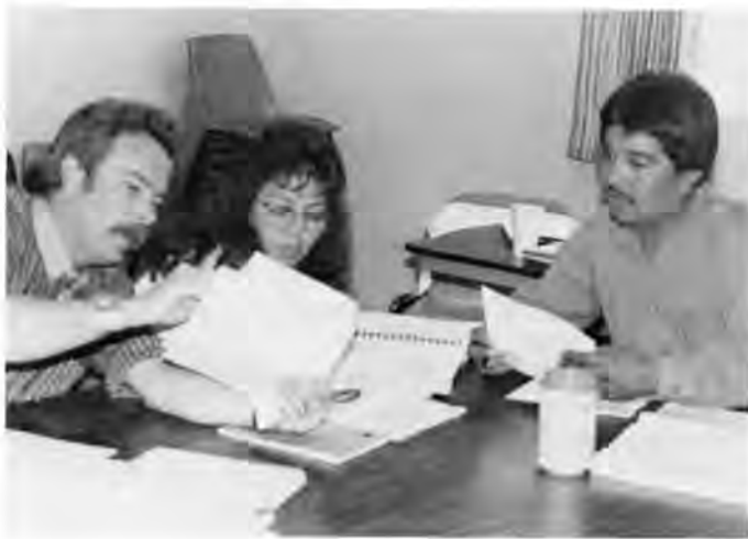
Participants divide into groups that "role-play" the review of a project's impact on historic properties. In Window Rock the hypothetical properties included a place where sand is gathered for sand paintings, several ancient living sites, and the ceremonial site of another tribe.

"The actual hands-on experience of developing a determination of no adverse effect and a Memorandum of Agreement was very beneficial."