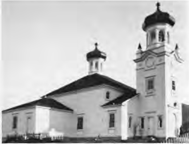
Holy Ascension Church, built in 1895, Unalaska, Alaska.

In 1990, the Alaska Regional Office and the Unalaska Aleut Development Corporation entered into a cooperative agreement to conduct a cultural resource inventory of the town center. The following year, the Unalaska Historical Commission and many others in the community worked with Service staff to produce the Unalaska Preservation Plan . Hopefully, the plan will serve as a tool to help preserve the integrity of not only the National Historic Landmarks, but cultural resources of state and local significance as well.