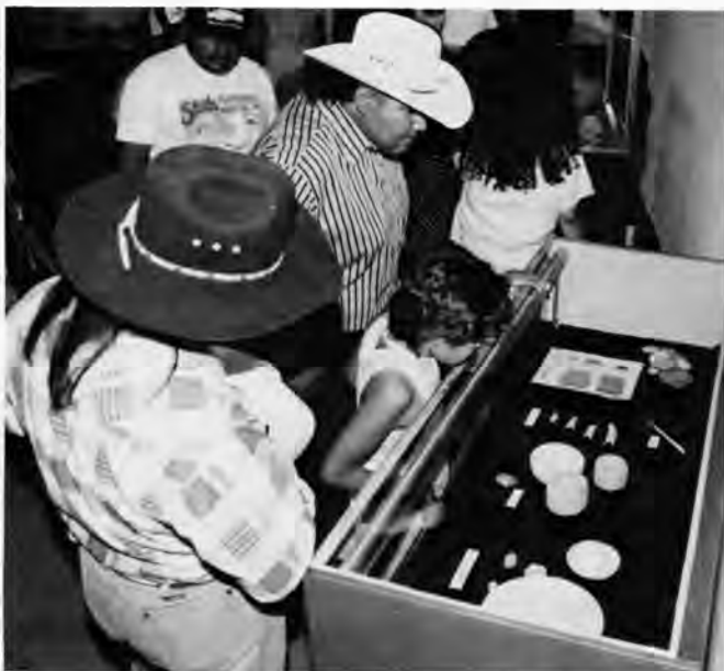
Community members and guests view an exhibition of artifacts excavated from an archeological site on the Ak-Chin Indian Community reservation.

The first part was designed to promote an awareness of the multiple roles and functions a museum could have in tribal life, and to build cooperation and consensus for the museum throughout the community. The plan called for tribal leaders, elders, project staff and advisors to visit museums and archives in the United States and Canada to see existing models firsthand, and to get a sense of the problems and