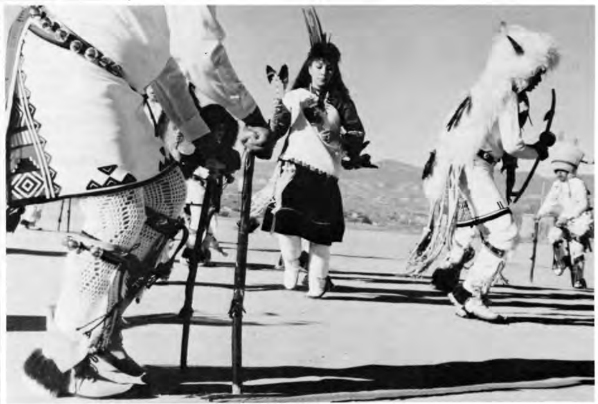
Buffalo/Deer Dance recreated and reinitiated in 1991 at Pojoaque Pueblo, New Mexico.