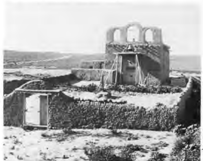
Mission at Pojoaque Pueblo in 1899. Neg. No. 13897.

Between 1912 and 1932, the Pueblo was not an organized community. Although the majority of the people remained in the area, Indian land was being used for open grazing by non-Indian ranchers. In 1933, the land of Pojoaque was returned to its people. Under the Indian Reorganization Act, 14 members of the Tapia, Viarrial, Romero and Montoya-Gutierrez families were awarded lands that had been in the hands of Mexican families. In 1946, the Pueblo became a federally recognized Indian reservation of 11,603 acres. With great determination and pride, the people of Pojoaque regained their tribal arts, and, in the early 1970s, danced in a public ceremony for the first time in more than a century.