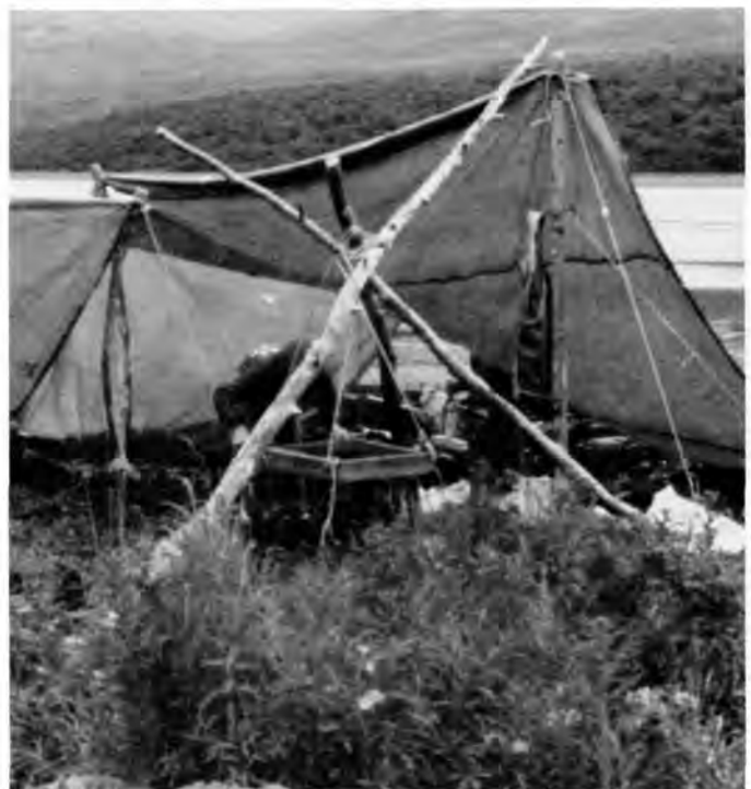
Covered site during excavation