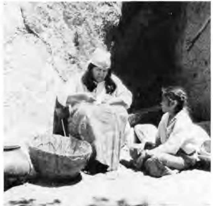
The continuation of cultural traditions often depends on access to resources on lands administered by public agencies. Cahuilla basketmaker, San Jacinto, California.

Ethnographic data collected during the initial stages of planning inventory may be summarized and used to identify management issues and Native American community concerns regarding potential conflicts. Tribal government officials and traditional cultural leaders should be identified in initial planning review and consulted in subsequent agency actions that could affect sensitive cultural values or tribal lands. The planning process also provides opportunities for developing programs to protect and enhance Native American concerns as one component of Federal land management mandates.