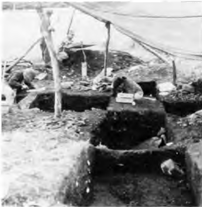
Excavation progress at the site

“One of the more successful joint BIA-Native programs involved an archeological field school with students from the Kodiak Area Native Association (KANA). Five youths, aged 15-18, camped at the isolated site on Kodiak for approximately two months. . . . Despite bear problems and some of the worst weather on record, all students stayed to the end, and successfully completed the university accredited course.”