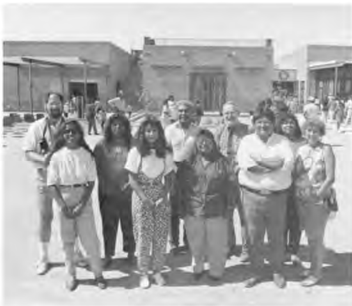
Ak-Chin Him Dak staff, with some of the project advisors, pose before the completed ecomuseum on opening day.

The Ak-Chin Indian Community consists of 550 people who are descendants of Akimel O'odham (Pima) and Tohono O'odham (Papago) Indians. They live on a 21,800 acre farm located approximately 30 miles south of Phoenix, Arizona at the northern edge of the Sonoran Desert. The reservation was created by Executive Order in 1912. A community council, which operates under Articles of Association adopted in 1961,