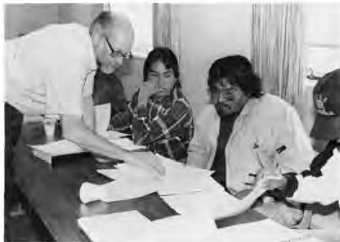
Advisory Council training, like this class for the Navajo Nation, features a seminar atmosphere stressing intensive interaction between trainees and the instructor. Participants receive and use course books containing a wide range of relevant laws, regulations, and guidelines.

"Preparing Agreement Documents under Section 106 of NHPA," with the University of Nevada, Reno. Fourteen introductory courses and five advanced courses will be offered at locations around the country in 1992. Those who want information about open enrollment or special courses can write or call the Council's Training Coordinator, Advisory Council on Historic Preservation, 1100 Pennsylvania Avenue, NW, Room 803, Washington, DC 20004; 202-786-0505.