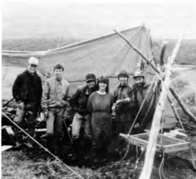
Field school students and BIA instructor

One of the more successful joint BIA-Native programs involved an archeological field school with students from the Kodiak Area Native Association (KANA). Five youths, ages 15-18, camped at the isolated site on Kodiak for approximately two months. More than 50% of a multi-component, 1,300-year-old dwelling structure was excavated. The students not only learned archeological methods and techniques, but also absorbed field camp operations and participated in evening discussions regarding daily activities. Despite bear problems and some of the worst weather on record, all students stayed to the end, and successfully completed the university accredited course.