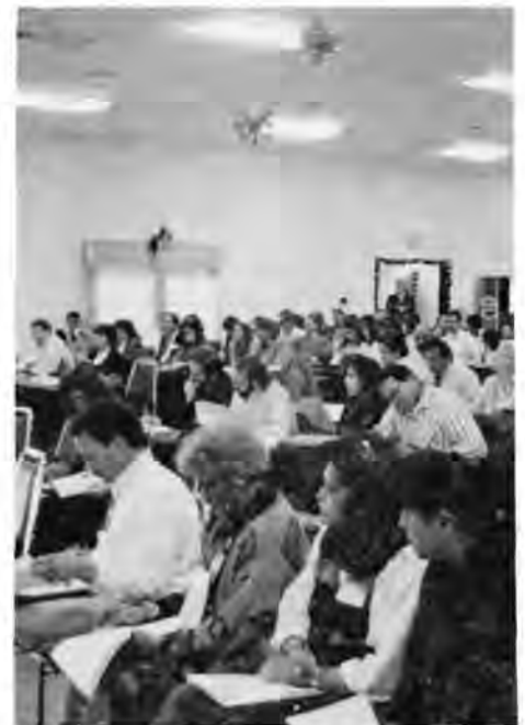
The Keepers of the Treasures conference at the Osage Reservation in northeastern Oklahoma, December 4-6, 1990.