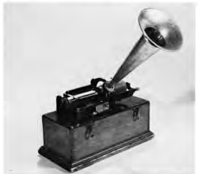
A cylinder phonograph machine. A person spoke or sang directly into the recording horn. The needle attached to the membrane at the bottom of the horn incised grooves onto the horizontally positioned spinning wax cylinder.

Before the dissemination process began, Cylinder Project staff met with a panel of Native American scholars, museum professionals, and cultural specialists to discuss methods and to contact people as well as to anticipate problems. Some of the latter emerge from the very nature of cylinder recordings. In the first decades that the cylinder machine was available, ethnologists, linguists, and early ethnomusicologists saw it as the ideal tool to help preserve traditions and languages they feared would otherwise disappear. Many recordists focused on the ceremonial lives of the people they visited. Thus many of the cylinders contain sacred songs; these are often genres that would not normally be heard out of context or by the uninitiated. In most cases, the early recordings were made openly with apparent community consent, but some were gathered under what would now be considered questionable circumstances. Paul Radin, for example, approached converts to the peyote