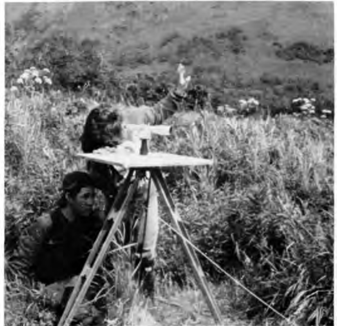
Students learning plane table mapping

artifacts collected by the BIA. Yet, in every case to date, the owner has chosen to allow the Bureau to curate the objects, house them under a long term loan agreement and to ultimately donate them to a local museum when such a facility is available. This little known fact shows the trust that is growing steadily between Natives and cultural resource personnel in the government.