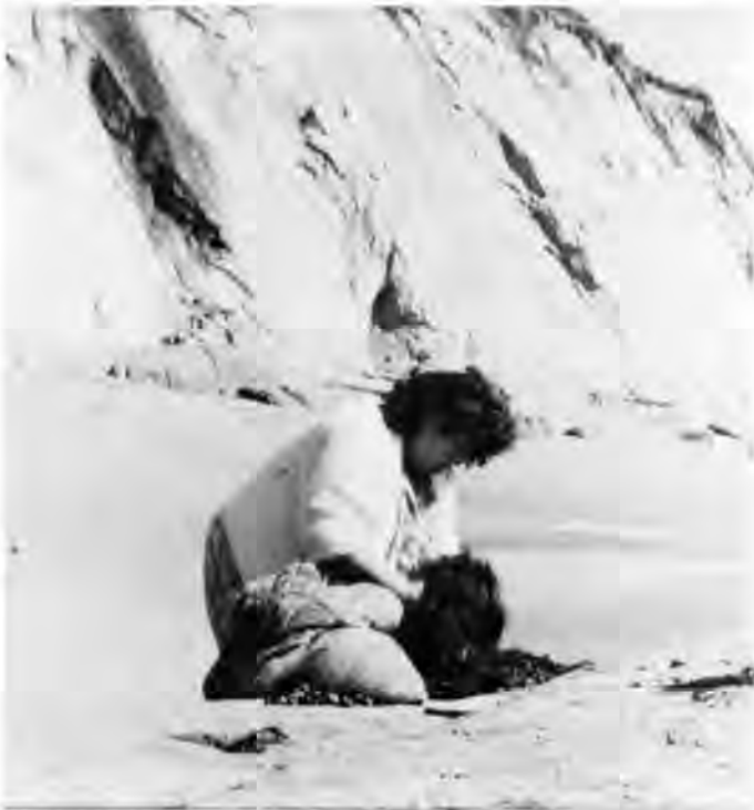
Hoopla woman collecting kelp seaweed, a traditional food resource, on Federal land. In some areas of the northwest, collection of aquatic resources is regulated by Federal and state agencies who must balance the need of Native Americans to gather and use these resources—some of which may be endangered species.

consistent with multiple use mandates of Federal resource-administering agencies, and can be accomplished in a manner which maintains the "neutrality" of the government with respect to particular religious interests (Suagee 1982). Although the term "mitigation" is still frequently used to describe agency options in this context, it takes on a new meaning in response to Native American cultural values. In many cases "mitigation" involves "accommodation" of subsistence activities, collection of crafts material, or religious and ritual practice: a very different concept than that applied to material cultural resources (archeological sites, historic structures, etc.).