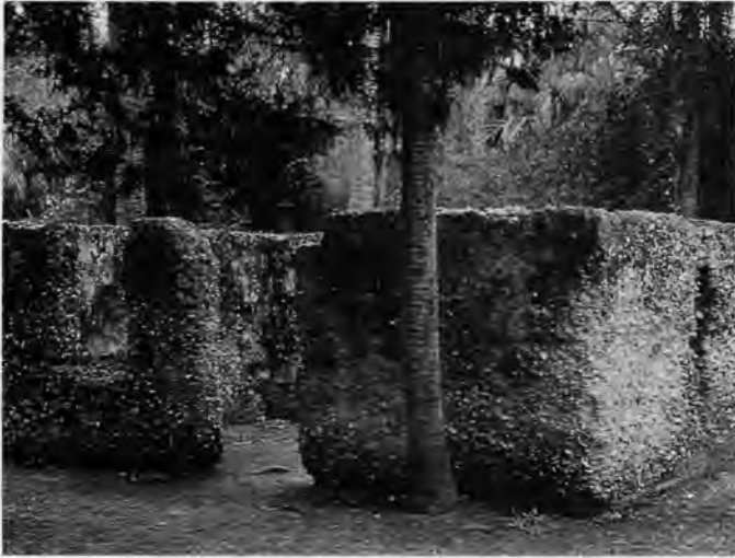
Twenty-three tabby slave cabins remain on the Kingsley Plantation site. Most are two-room structures with fireplaces and windows.

clear through the planning process and the first few months of daily operations is that interpreting slavery has become the biggest operational challenge and opportunity at Kingsley Plantation. The National Park Service has a large amount of experience interpreting people and places, such as Zephaniah Kingsley and Fort George Island. But it lacks experience in interpreting slavery, a broad social institution which is often misunderstood and creates a strong and varied emotional response from the visiting public.