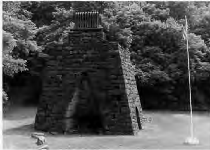
Stack with original heat exchanger, Eliza Furnace (c. 1846). Photo by Diane Reed, Pennsylvania Historical and Museum Commission, 1989.

The Bureau for Historic Preservation chose to nominate these resources as a multiple property submission for several reasons. It had determined by 1989 that the Pennsylvania iron and steel industry was highly important in state and national history. A historic context on Pennsylvania industry completed by staff determined that iron and steel manufacturing was one of the five most important industries in the state's history in terms of the number of employees and the value of goods produced. 1 The state's iron and steel furnaces were also critical to the development of the national industry.