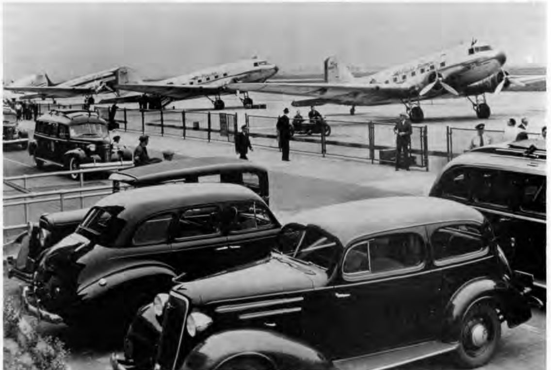
Floyd Bennett Field in the 1930s.

The opening of New York's LaGuardia Airport in 1939 seriously depleted Floyd Bennett Field of commercial business. Still, New York City's Police Aviation Unit