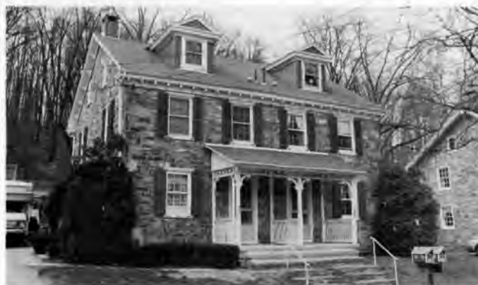
Double workers' house (c. 1845). Robesonia Furnace Historic District.

The Bureau for Historic Preservation also wanted to provide a broad history of Pennsylvania's iron and steel industry for the general public. A number of histories had been written about specific iron furnaces or steel mills, and about the technological, business or labor history of the industry. But no history adequately synthesized these various subjects into a broad, interpretative whole. The Bureau hoped to provide this history and distribute it to the general public. In this way citizens throughout the state could learn the full history of an important industry from their past, and the need to preserve vanishing historic resources. The Bureau for Historic Preservation plans to publish the historical narrative section of the multiple property documentation form for the general public. Thus the multiple property format enables the Bureau to identify and assess iron and steel industry resources, and educate the general public about their history and importance.