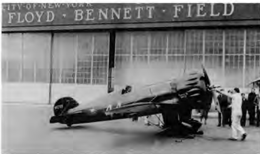
Floyd Bennett Field, take-off and landing point for aviator Charles Lindbergh.

found an ideal home in one of the old hangars where it continues to operate today. New York was the first city to have such an aviation unit in its police department. Today, New York City's familiar blue and white police helicopters from Floyd Bennett Field are used for rescues, emergency transport, traffic control and myriad other functions in all five boroughs.