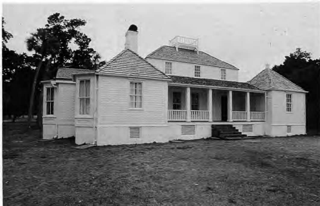
The original plantation house overlooks the salt marshes of the Timucuan Preserve. The widow's walk may have provided a view of the plantation fields.