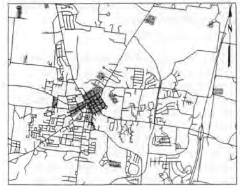
Close-up of Franklin, Tennessee. Shaded areas are National Register properties. Streets are U.S. Census TIGER/Line file data.

Digitizing these properties serves two main purposes. First, many of the properties played an integral part in the battles under study, as hospitals, headquarters, or part of the battlefield setting. By looking at the location of the sites in relation to the battlefield, we can, in part, assess the integrity of the battlefield. Second, the effort will serve as a pilot project in anticipation of creating a digitized map database of all National Register property boundaries as a product for use by planning organizations. For more information about the project, please contact either of the authors at 202-343-2239.