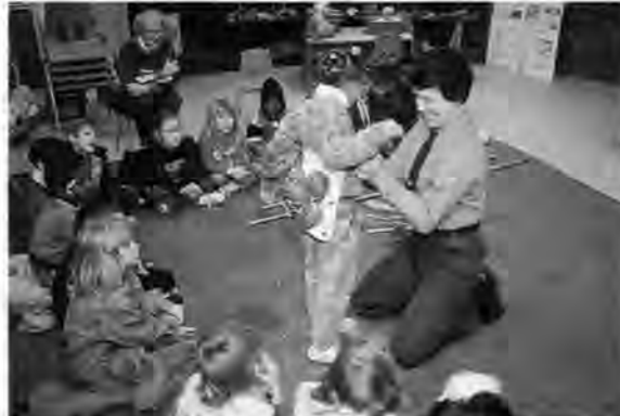
Discovery Lab.

After this unexpected success, straightforward requests for assistance were directed to other businesses. Amazingly, not one turned me down. Lumber, paint, even nails were donated. A bank and an insurance com-