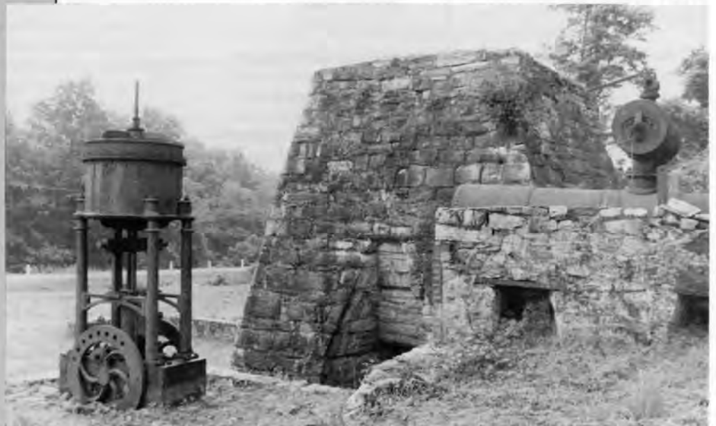
Carrick Furnace, with the blowing engine to the left, the iron furnace stack in the middle, and the boilers to the right.

Cultural Resources Management Information for Parks, Federal Agencies, Indian Tribes, States, Local Governments and the Private Sector