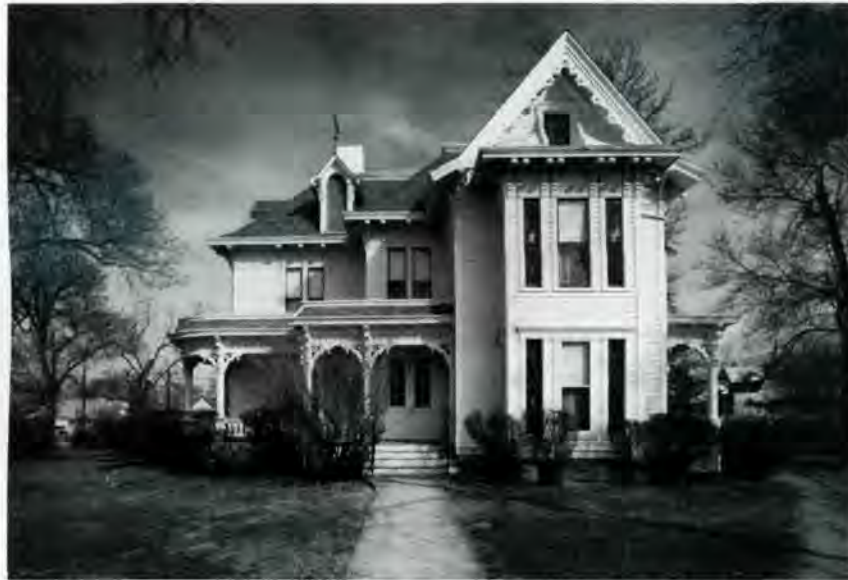
The Harry S. Truman National Historic Site in Independence, MO, was the home of the 33rd president of the United States from 1919 to 1972 and became a unit of the national park system in 1982.

Upon reviewing the amendments and publications, and the forms being submitted by the parks, I found that since the mid-1970s there had been a giant leap forward in the educational and interpretive value of the data found under the Description and Significance sections. I also recognized the importance of upgrading the docu-