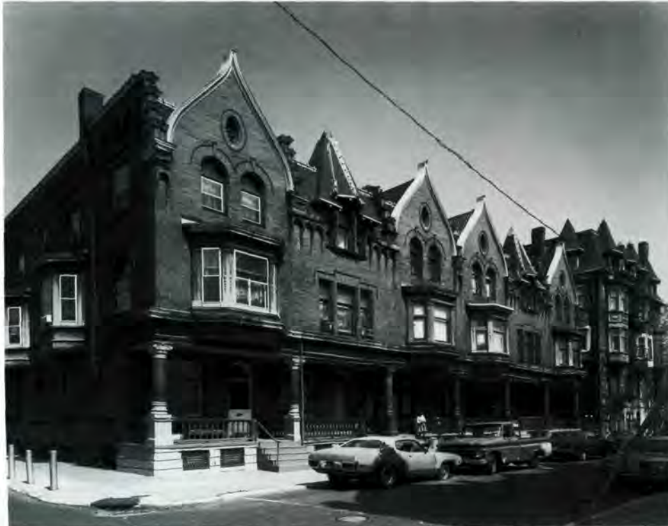
These historic row houses at Memorial and Viola Streets, are part of the Parkside Historic District in Philadelphia.

Located a short distance from the downtown, the Stuart Neighborhood in Kalamazoo, MI, used the