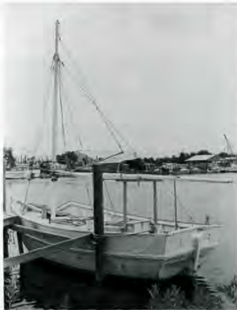
Sloop-rigged and 27 feet in length, Dutchess is the only surviving example of a distinctive type of small-craft designed for harvesting sponges in the shallow waters off Florida's Gulf Coast. The boat represents one of several boat types historically associated with Tarpon Springs's commercial sponge industry.

lines. Local history—the focus of community based nominations—is now organized by theme and time, so that a historic resource can be associated with a particular period and trend in a community's history. In places as culturally diverse and geographically distant as La Tierra Amarilla region of New Mexico, and Missoula, MT, listed properties—city halls, schools and colleges, commercial blocks, industrial plants, ranches, irrigation systems, and residential neighborhoods—testify to the historic patterns of agriculture, politics, commerce, industry, transportation and social history which shaped these communities. Furthermore, the well-researched National Register forms contribute to a rich and vivid documentary of community life and history throughout the United States.