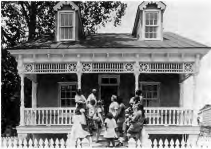
The King-Tisdell Cottage in the Savannah Historic District is valued not only for its Victorian architecture but also for the many stories it tells about Savannah's African American history.