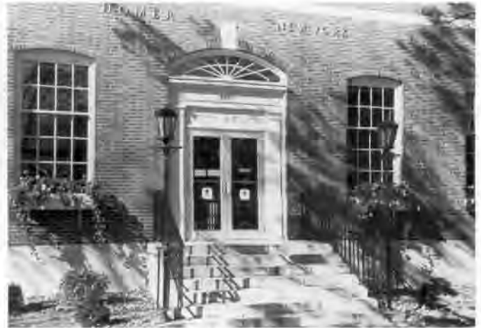
The U.S. Post Office in Homer, NY, was constructed as a public works project in 1937 and 1938. It is one of 155 post offices listed in the National Register of Historic Places under the multiple property group, U.S. Post Offices in New York State, 1858-1943.

The National Park Service maintains and expands the National Register. We settle disputes and hear appeals, and we set, publish, and distribute standards and guidelines in our National Register Bulletin publication series and provide training and technical assistance. We try to make the National Register accessible to the public by answering inquiries, querying the NRIS, copying registration documentation, and preparing such publications as the National Register cumulative list, the new book on African American historic places, regional travel itineraries, and so on. With the National Trust, we have embarked on Teaching with Historic Places. But we cannot measure the full impact of the National Register.