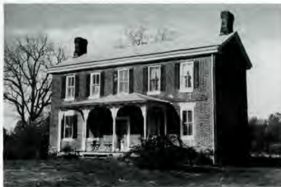
Windsor (ca. 1760) in New Castle County, DE, denotes "the construction of a stair-passage plan brick house which materially and symbolically linked its original owner with the particular community of central Delaware's rural elite."

comprehensive review of all surveyed historic properties which met the conditions of time (1770-1830) and place (central Delaware). The review process depended not only on an architectural assessment of each property but also on a process of record linkage where the information gleaned from all available sources—material and documentary—is synthesized within the larger historic context. 4 The goal is to reveal as much as possible about the significance of each property under consideration and to establish the kinds of multifoliate relationships connecting individual properties and their