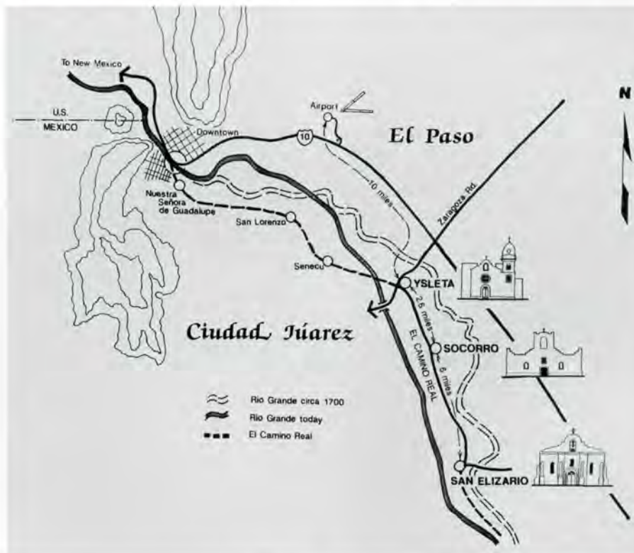
This map (not to scale) illustrates the location of the three mission churches connected by the Mission Trail, a section of El Camino Real, which the Office of Heritage Tourism in the City of El Paso expects will draw tourists to the area.

Work began at once on the San Elizario Chapel, which was in the most deteriorated condition. The Portland Cement stucco was completely removed and the adobe walls were allowed to dry out. The bells were temporarily taken down from the belfry, cleaned, and placed in working order. The damaged