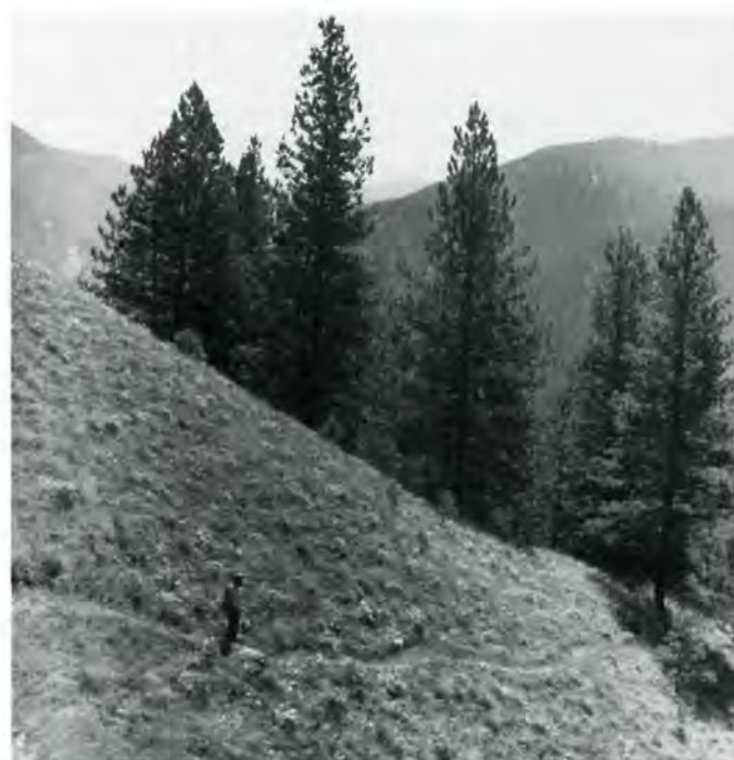
The Old China Trail connects the three Chinese garden sites in the Warren Mining District, Payette National Forest, ID.

Church-River Of No Return Wilderness. The Payette National Forest also has 26 buildings within four complexes that reveal four different architectural styles, reflecting significance in USDA Forest Service history. In addition, two fire lookout towers with associated buildings were nominated to the National Register in late 1993. However, within recent years, the Chinese cultural properties have been of particular public interest.