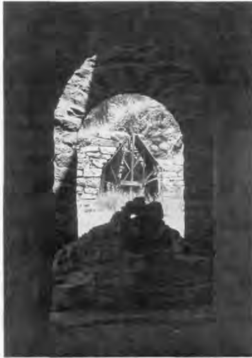
The furnace stacks at Greenwood Furnace in Huntingdon County, PA, reflect the important role of iron plantations in the evolution of America's iron and steel industry. Operating from 1834 to 1904, Greenwood Furnace helped make Pennsylvania one of the nation's greatest producers of iron in the 19th century.

a springboard for heritage tourism. The National Park Service itself has embarked on a demonstration project aimed at educating the tourism industry and the traveling public about the National Register. National Register