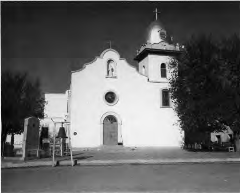
Work is presently underway to restore the Ysleta Mission, starting with the bell tower.

adobe walls were repaired using new adobe and mud mortar. Then two coats of mud plaster mixed with straw and cactus juice were applied. The result was a restoration that closely resembled the original church.