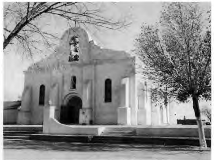
The Presidio Chapel of San Elizario, El Paso County, Texas, is the southernmost stop along the Mission Trail.

point of contact for city and county officials, and for all private organizations. It provided the leadership and the planning to direct and focus the funds and energies of these various groups. The result of these activities has been the beginning of the restoration and protection of