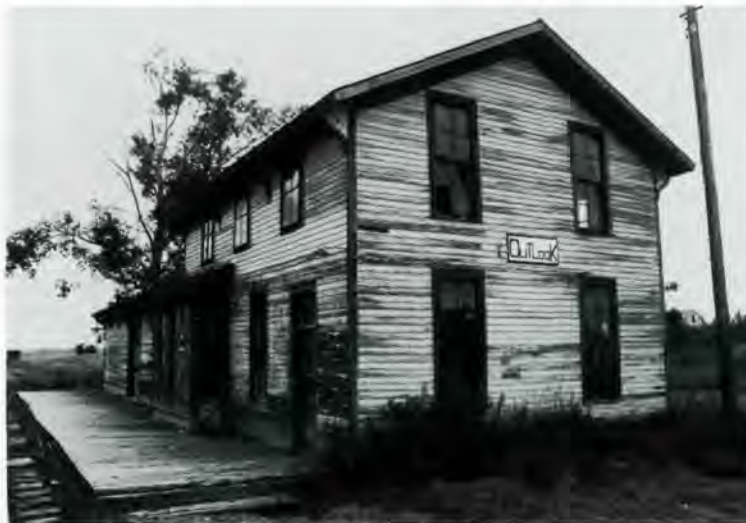
The Outlook Depot, Sheridan County, MT, illustrates the state’s transportation heritage.

or better planning, I believe the answer is an unqualified “yes.” In a state of 800,000 citizens, we claim 13 CLGs, almost 700 National Register listed properties, 400 National Register interpretive markers in place, $4,000,000 of federal rehabilitation tax act generated work this year alone, and a host of vocal, confident preservation activists. But I believe that the National Register’s role in Montana’s impressive preservation community is subtle. The National Register works because it rewards and honors and