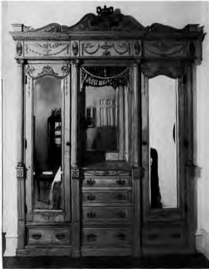
This elegant built-in armoire graces the second floor bedroom of a Parkside Avenue residence, Parkside Historic District, Philadelphia.

National Register process to define its origins and character. The Stuart Neighborhood Historic District was designated a local historic district in 1977 and listed in the National Register in 1983. The registration documentation describes the development of the neighborhood from the 1860s to the 1920s, when it was home to prosperous businessmen and self-employed craftsmen. Most of the building stock is made up of detached frame houses, many of which are large in size and handsomely detailed and sit back from tree-lined streets.