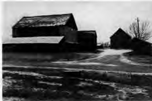
Multiple property submissions like "Dwellings of the Rural Elite in Central Delaware" include documentation of contextual resources such as landscape, land use patterns, and secondary structures and sites, such as these agricultural outbuildings associated with Green Meadow Farm (ca. 1789).

a vital, innovative, and integrated research approach which makes sophisticated use of buildings as evidence and uses that information to assess a wide array of historic themes relating to all geographic areas and historic periods.