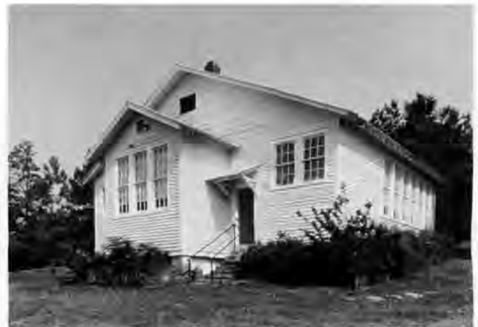
The restoration of the Noble Hill School and its conversion to a rural African American heritage center began with its nomination to the National Register.

What the National Register has done for Georgia's historic African American properties it can do—indeed it has been doing—for all the state's historic properties.