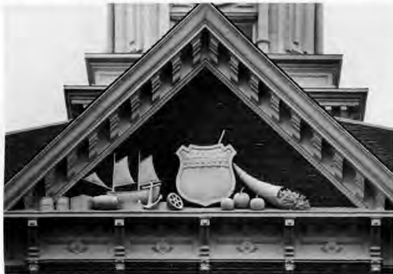
Detail of north pediment, Washington County Courthouse, Blair, NE, illustrates the basis of the state's economy.