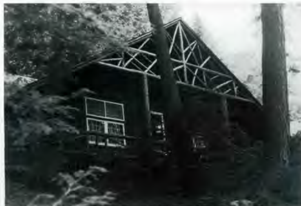
Moss Ledge Lodge is reminiscent of many guest quarters in Adirondack camps.