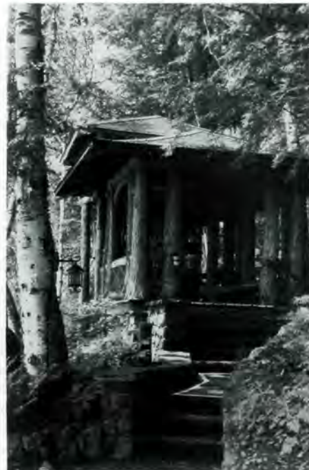
This tramway shelter protects the principal escalator-lift which transported guests from the boathouse landing to the main lodge at Camp Topridge, in Franklin County, NY.