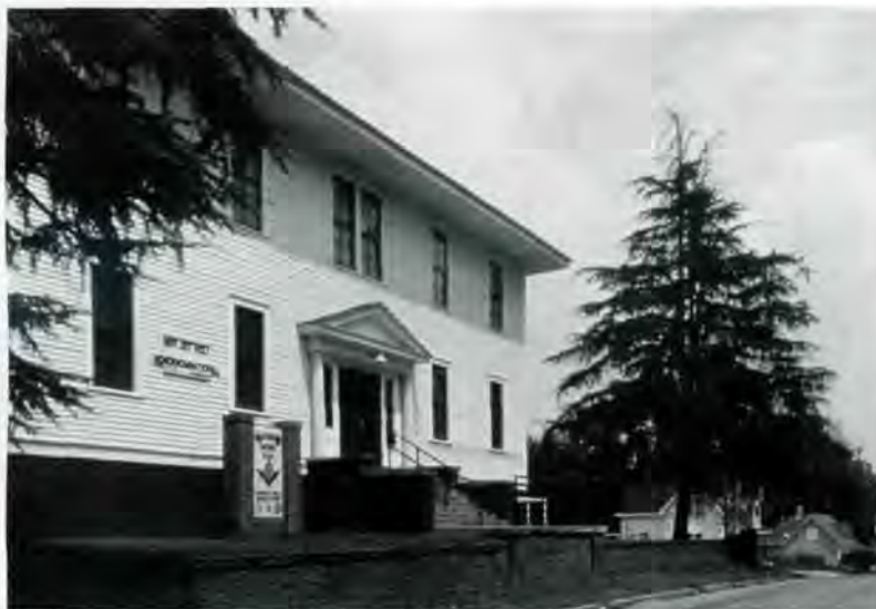
Many African American historic resources in Georgia are concentrated in neighborhoods like the Reese Street Historic District in Athens with its historic school, church, community stores, and variety of houses.

Finally, the National Register has served as a catalyst for African American preservation projects through the benefits and incentives of National Register listing. For example, preservation tax incentives (both federal and state) made available through National Register designation have encouraged the rehabilitation and continued use of numerous historic African American buildings across Georgia. Houses, especially in larger urban neigh-