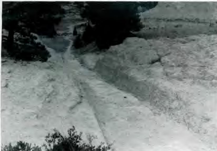
Obvious historic resources may be readily identified and interpreted, as is a section of the Oregon Trail near Guernsey, WY.

We in developed countries suffer from extreme urbanization which causes tunnel vision and severely limits