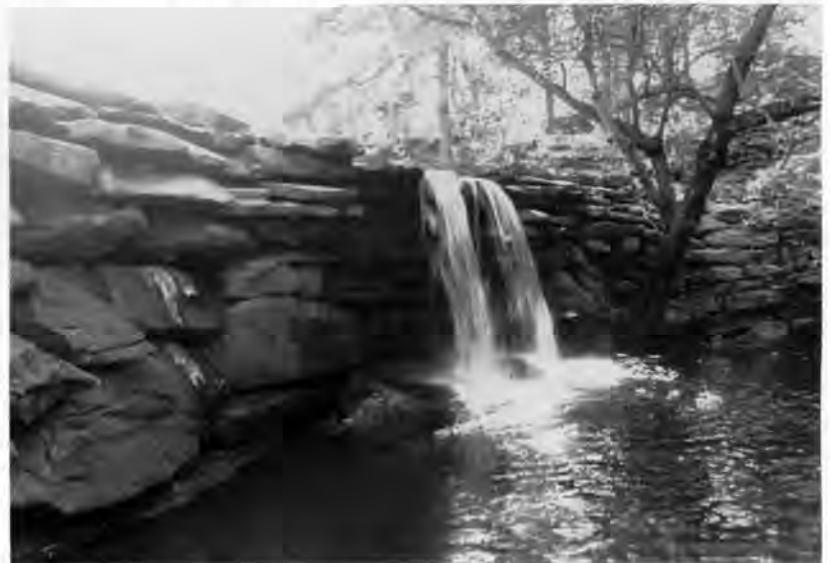
A naturalistic dam in Arkansas's Petit Jean State Park reflects the work of the Civilian Conservation Corps (CCC). Under the direction of the landscape architects, architects, and engineers of the National Park Service, the CCC developed recreational facilities from picnic shelters to manmade lakes in state parks across the United States during the 1930s.