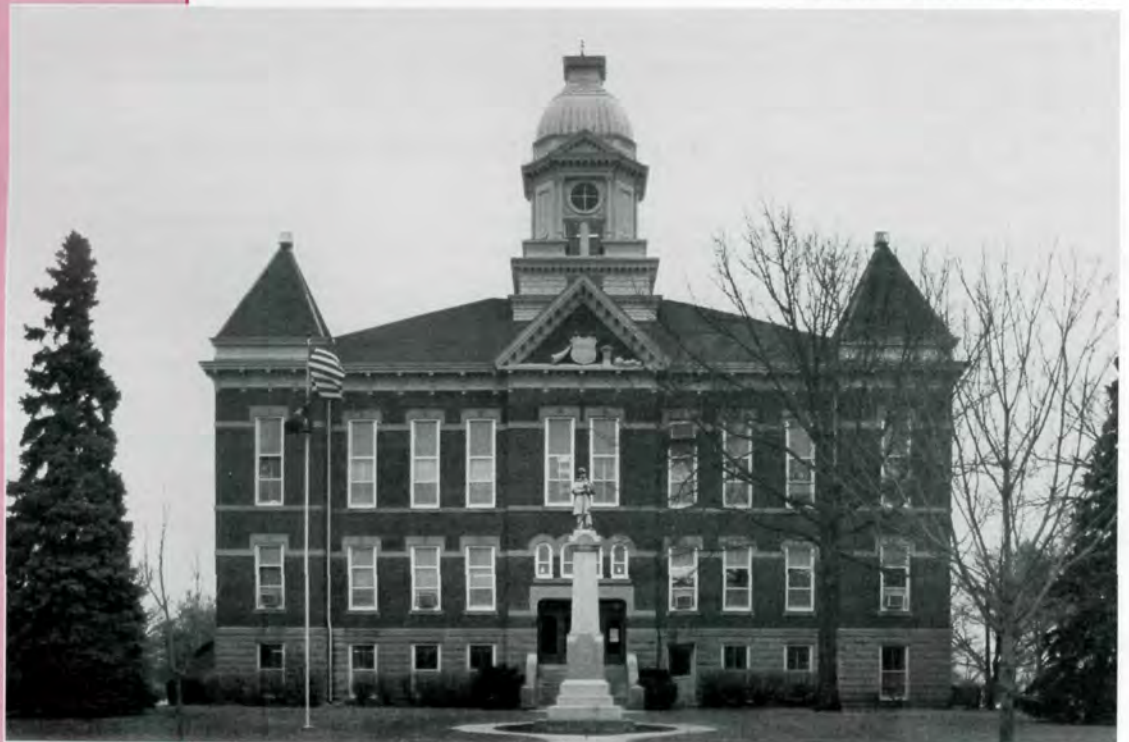
Communities across the country include districts, sites, buildings, structures, and objects listed in the National Register of Historic Places. Historic courthouses, like the Washington County Courthouse in Blair, NE, represent the heritage of older communities.