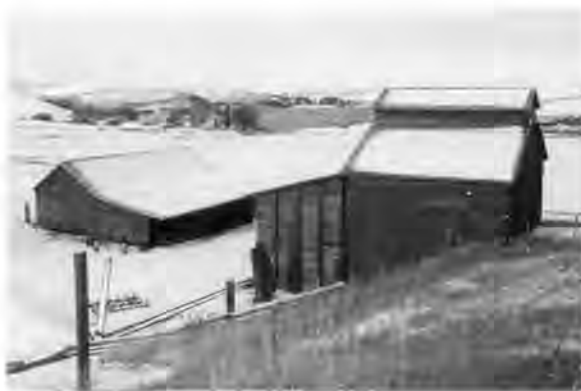
Built between 1904 and 1930, the Gustave Heilsberg Farm in Whitman County, WA, is today one of the most complete examples of the historic farms in the Grain Production Properties in Eastern Washington MPS.

The National Register of Historic Places encourages agencies to use multiple property documentation. Information about the evolution of trends, such as the construction of iron and steel bridges or the management of the federal lighthouse service, is relevant to evaluating the significance of properties in many locations. Furthermore, information about historic properties is useful for making comparative analyses and for understanding the material culture associated with a historical theme. In 1993, the National Register published a comprehensive list with selected annotations of all the multiple property listings in the National Register of Historic Places. This has enabled those preparing documentation