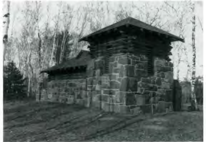
This water tower is listed in the National Register as part of the Jay Cooke State Park CCC/WPA Rustic Style Picnic Grounds multiple property nomination.

The long-term benefits of the county survey are too numerous to count. The base-line inventory that was developed continues to be used daily by staff, as well as by state and federal agencies, local governments, and independent researchers. It shaped the system of historic