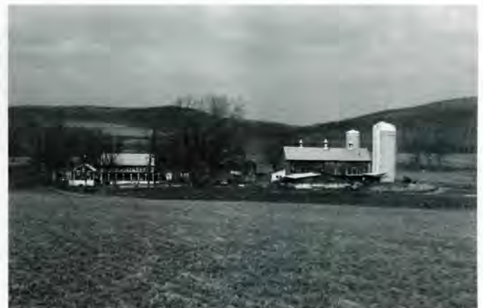
The Hoch Homestead in 1982, from the National Register file for Oley Township Historic District.