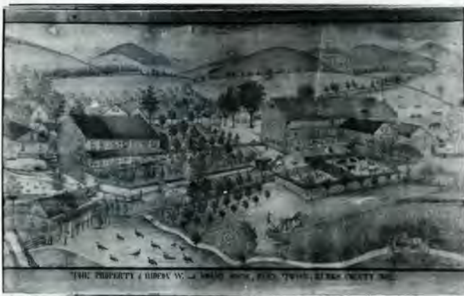
Historic drawing of the Hoch Homestead from the National Register file for Oley Township Historic District, Berks Co., PA. 1882 drawing: Brader; photo: Ken Haas.