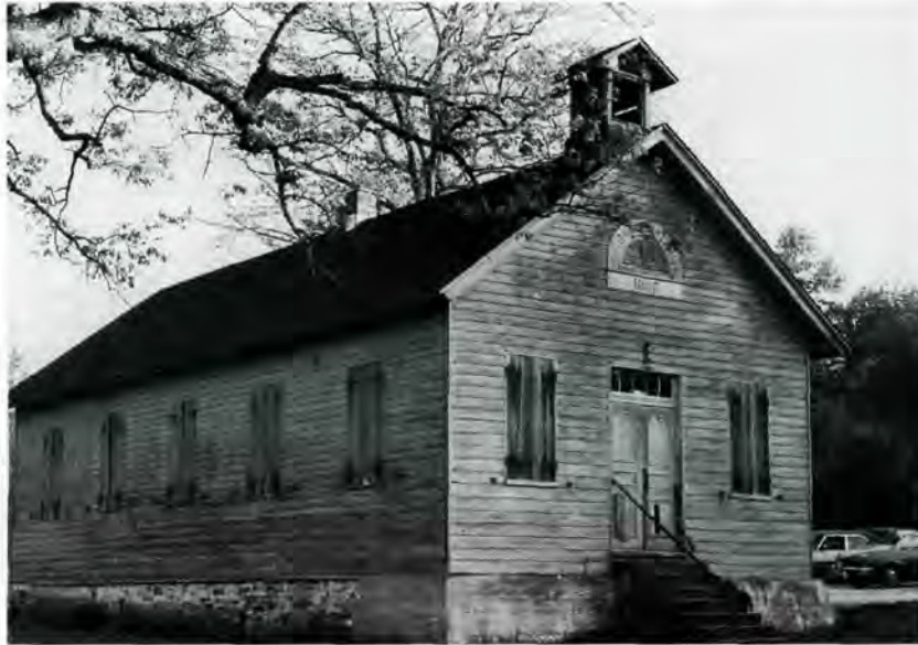
The McComas Institute in Joppa stands as the single most important property in the history of Black education in Harford County, MD. Constructed in 1867, it is one of three area schools built by the Freedmen's Bureau after the Civil War, and the only one that survives intact.

Beth L. Savage is a historian with the National Register of Historic Places, Interagency Resources Division, National Park Service, and serves as the project director for the book.