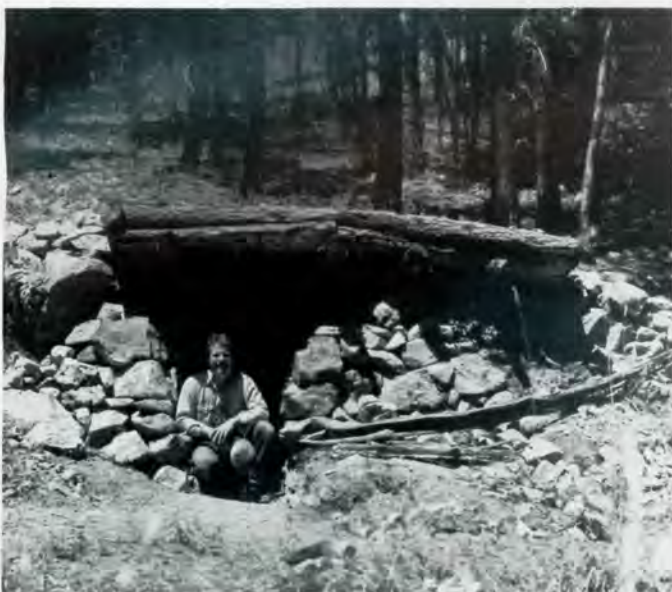
The author sits at the entrance to the Ah Toy Garden habitation site.

Other historic properties in the forest include stratified prehistoric archeological sites (part of the listed Krassel Ranger Station site) and the Cabin Creek Historic District, which contains buildings, ruins, ditches, and trails reflecting early ranching activity within the Frank