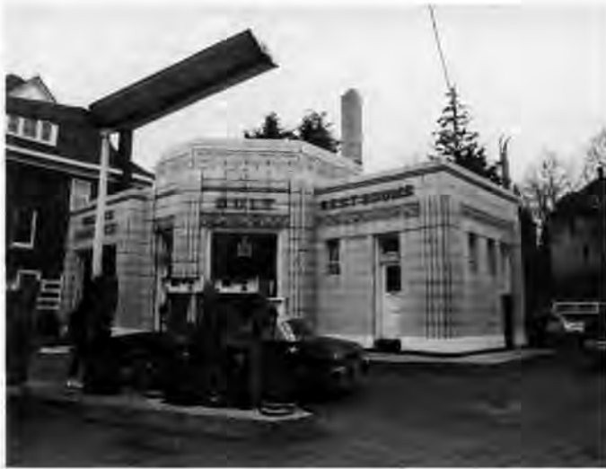
Transportation concerns pervade the history of Bedford, Pennsylvania. The Bedford Historic District includes this ca. 1936 Art Deco gasoline station for its association with early automobile travel on the Lincoln Highway (present-day Route 30).

provides a tourism substitute. In Williamsport, the Chamber of Commerce actively promotes the Millionaires' Row Historic District, and has reported increased tourism there since National Register listing in 1985.