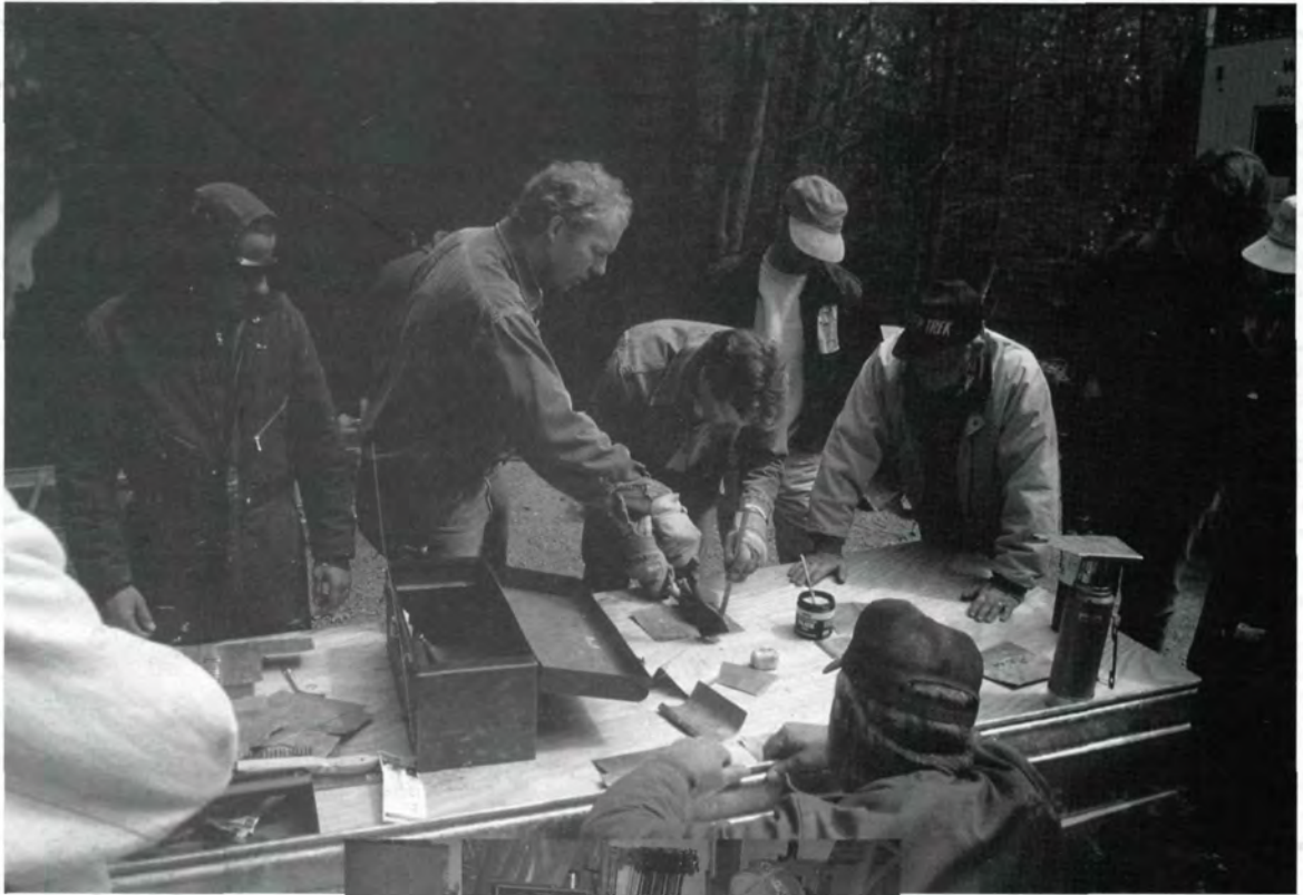
Right: Soldering workshop, Grey Towers National Historic Landmark.