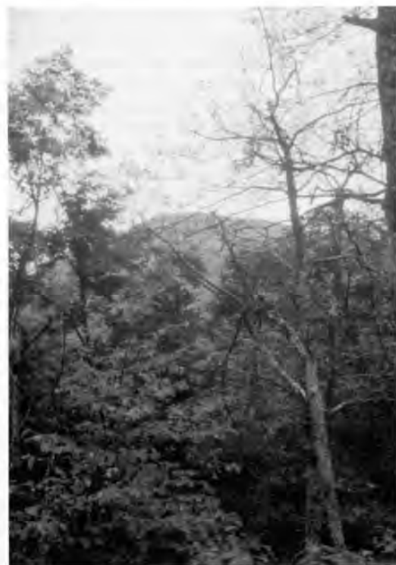
Judd Gardens below Sentinel Lodge showing stone walls and rock-pile flower gardens, 1938.