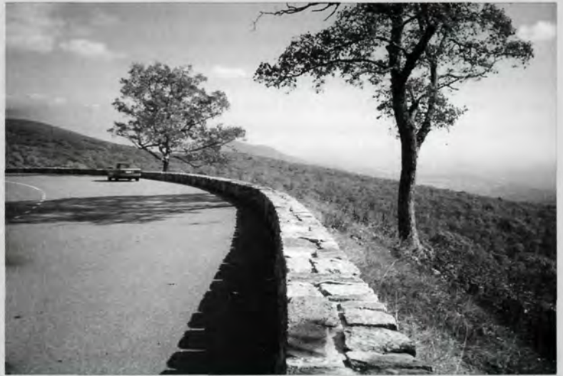
Wherever possible, specimen trees have been retained at overlooks and, when documented trees are missing, are being replanted.