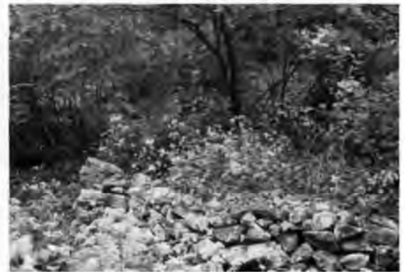
Stone wall and planting bed, 1995.

plagued all of those who worked on the project. Looking at the garden individually, it was questionable whether there was enough material present to convey its significance as a rustic Appalachian garden. Looking at the garden within the context of Skyland as a whole, it was clear that the garden was a very important surviving piece of this rustic vacation resort. After much discussion and debate, LCA's recommendation was that the Judd Gardens within Skyland possessed historic significance and integrity for its association with the development of late-19th and early-20th-century outdoor recreation and resort communities in the United States. 8 Therefore, the garden was considered a contributing resource to the potential Skyland Historic District. 9