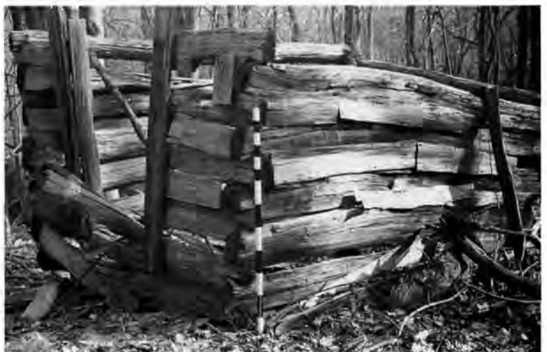
View of a Weakley Hollow henhouse before it was crushed by a falling tree in Autumn 1996.

Audrey Horning is research archeologist with the Colonial Williamsburg Foundation.