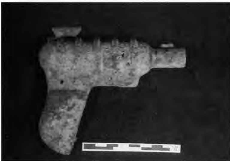
Toy ray gun found on a Corbin Hollow site.

Archeological evidence suggests that Weakley Hollow, a long valley separating the geologically-distinct Old Rag mountain from the Blue Ridge, was settled by the 1770s. It had grown into the village of Old Rag, complete with a post office, two stores, two churches, and a school by the 20th century. Residents during the previous century had capitalized upon their proximity to a through road by operating commercial sawmills, gristmills, and distilleries—all part of the hollow's archeological heritage.