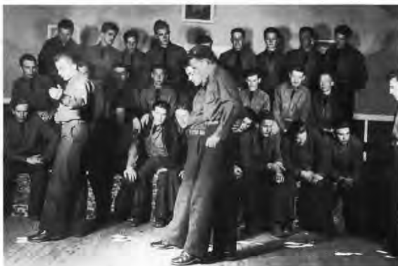
The CCC experience, however, did include education and recreation. This photo shows enrollees learned to dance, possibly prior to one of the many well-chaperoned dances in near-by Luray, Front Royal, or Elkton. Many of the boys married local girls and settled down near the park.