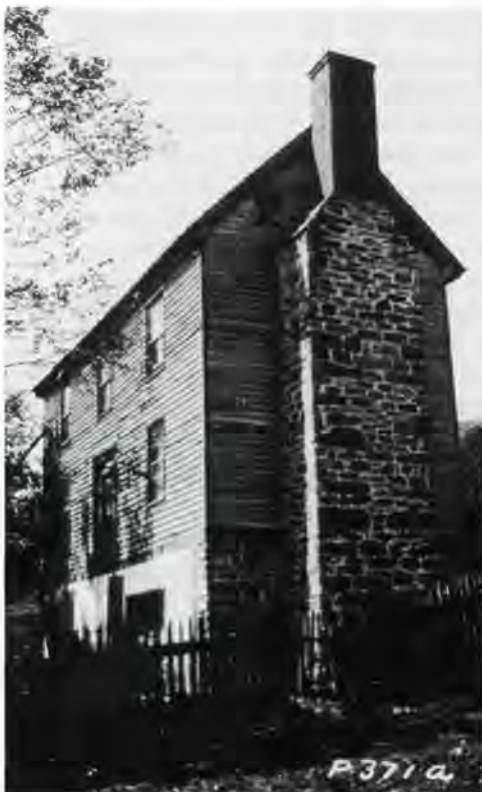
Haywood Nicholson home, Weakley Hollow (destroyed).

Because Shenandoah was destined to be managed as a “natural” park, the surviving log structures were not maintained. Instead, the declining traces of historic occupation have been celebrated. “Where else,” asked one writer, “has the supposedly inevitable trend of civilization, toward more and more consumption of earth's resources, been so completely reversed by democratic decision on so large an area?” But how can a region be “returned” to its “natural” state in 60 years? Furthermore, what is its “natural” state? For Shenandoah, the aim has been to return the land to its condition before European settlement. Beyond the environmentally questionable nature of this decision, the notion that the land was pristine wilderness 200 years ago denies the impact of Native American occupation and suggests that such prehistoric activity was not really “cultural.”