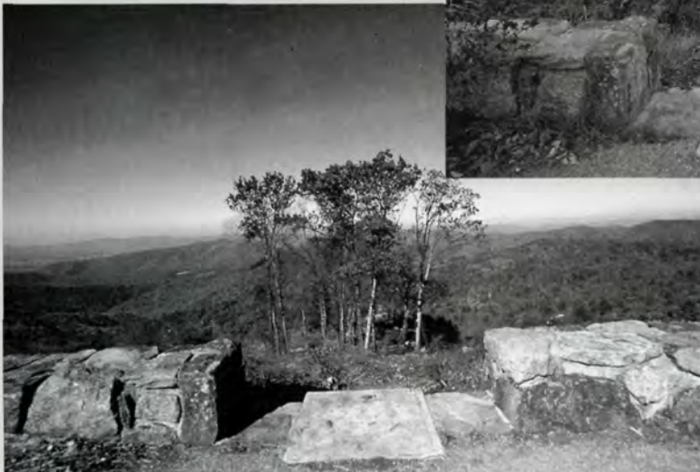
The photographs show "The Point" Overlook (milepost 55.6 on the Skyline Drive) before and after clearance.