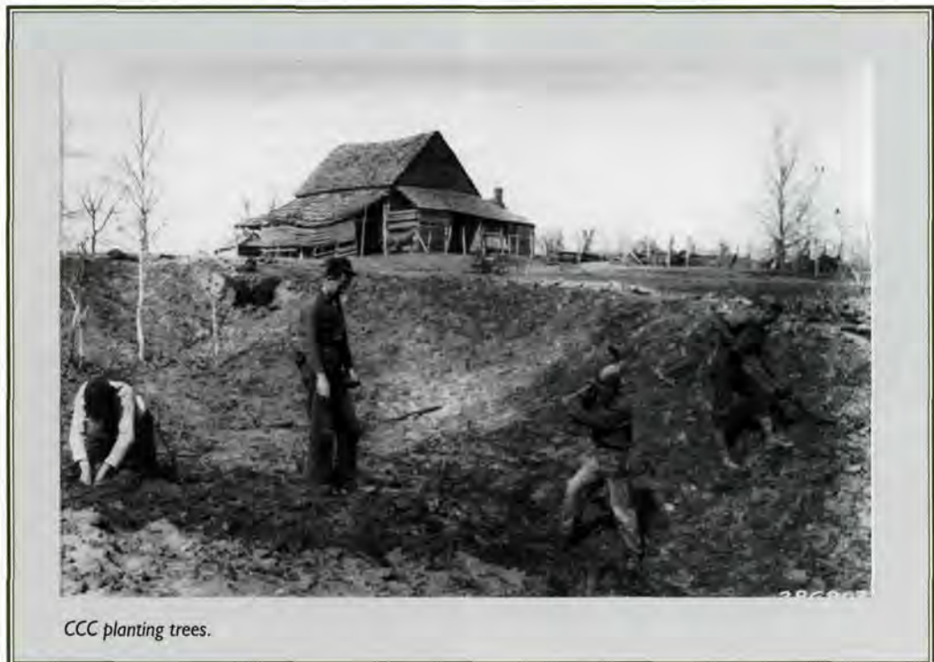
CCC planting trees.