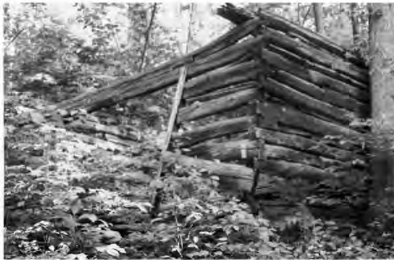
Surviving log structure with trail blaze.

are recovered from Corbin Hollow sites than on Nicholson or Weakley Hollow sites, indicative of wage-labor subsistence. Not only did Blue Ridge residents actively participate in the national consumer culture, they made choices regarding their subsistence and economic lives—choices and decisions that changed over time and were tempered and shaped, but not determined by, the natural environment.