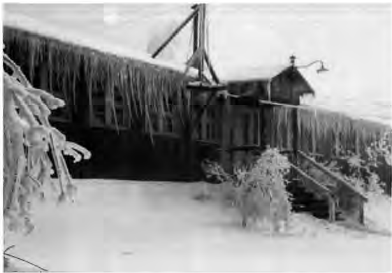
Life on the mountain was not easy for the CCC enrollees. They contended with rattlesnakes, regimentation, summer heat and humidity, and (as shown in this photo taken at Big Meadows camp NP-3 during the winter of 1933-1934) frigid cold.