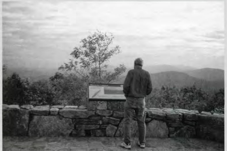
Range View Overlook (mile post 17.1) before and after clearance. The interpretive wayside discussed a vista almost entirely blocked by second growth vegetation.