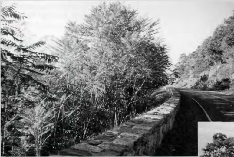
Long vista adjacent to milepost 6.0 on Skyline Drive before and after clearance. Ailanthus altissima , an exotic, was the dominant second growth species.