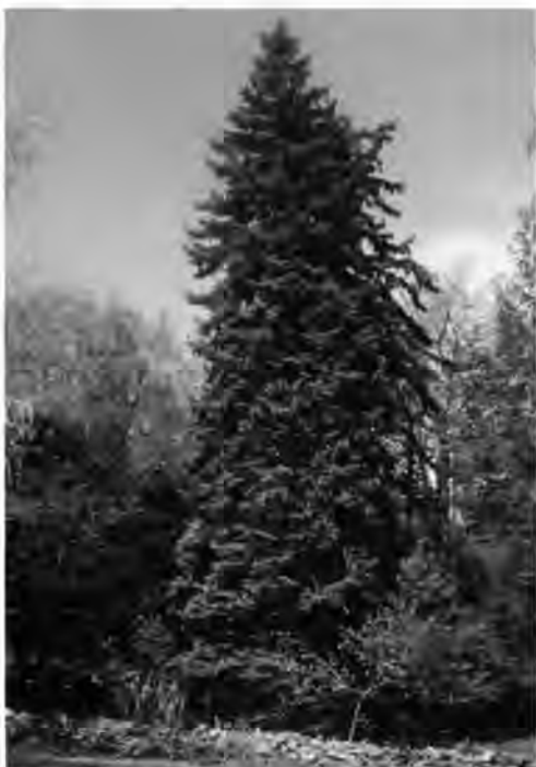
View from old Skyland road to Judd Gardens, note Blue Spruces and stone wall, 1989.