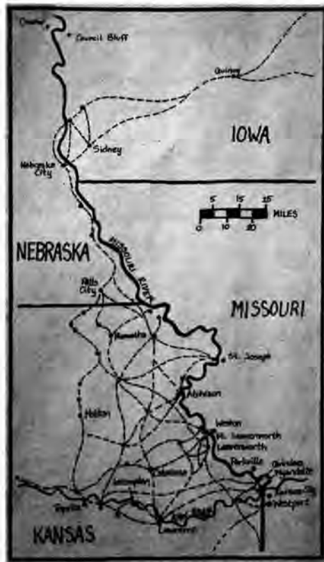
The Lane Trail from Topeka, Kansas, into Nebraska with connecting roads to the Missouri River towns.

hope of learning something about our cultural heritage—about the way a town was settled in the 1850s, about the way African Americans fled into Kansas Territory to escape slavery, and about the ways in which multi-ethnic communities developed after the Civil War. As all educators know, there is no substitute for experience in the field, on the very site where history took place. To stand in the center of the Quindaro ruins and imagine the bustle and industry that characterized this free port town in the 1850s is an experience that cannot be replaced by a classroom lecture or a “virtual visit” on the