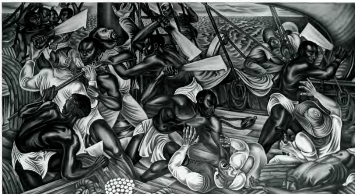
Mutiny Aboard the Amistad mural located at the Amistad Research Center.

Aside from the history of the AMA, the papers are most valuable as sources for studying the abolitionist movement, particularly as it affected the Northern Protestant churches, and for studying the education of the freedmen during and after the Civil War. Finally, although not extensive, students of the underground railroad will find