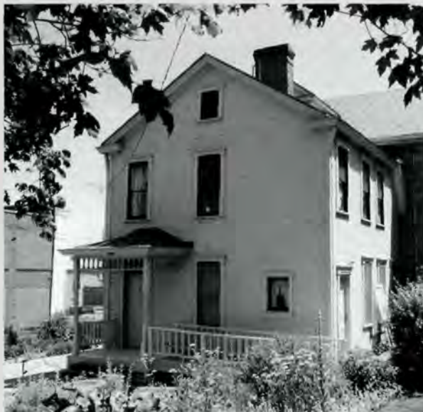
F. Julius Lemoyne House, Washington Co., PA.

The historic places along the underground railroad are testament to African-American capabilities. The network provided an opportunity for sympathetic white Americans to play a role in resisting slavery and brought together, however uneasily at times, men and women of both races to begin to set aside assumptions about the other race and to work together on issues of mutual concern. At the most dramatic level, the underground railroad provided stories of guided escapes from the South, rescues of arrested fugitives in the North, complex communication systems, and individual acts of bravery and suffering in the quest for freedom for all.