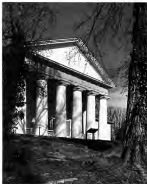
Arlington House.