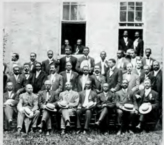
Niagara Movement meeting. Storer College, Harpers Ferry, West Virginia.

New Orleans Jazz National Historical Park, LA Nicodemus National Historic Site, KS Perry's Victory and International Peace Memorial, OH Petersburg National Battlefield, VA Port Chicago Naval Magazine Memorial, CA Richmond National Battlefield, VA Selma to Montgomery National Historic Trail, AL Timucuan Ecological and Historic Preserve (Kingsley Plantation), FL Tuskegee Institute National Historic Site, AL Virgin Islands National Park, VI