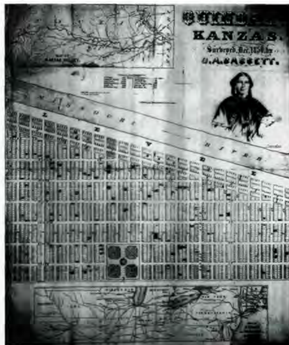
Plat of Quindaro, Kansas by O.A. Bassett, December, 1856. Illustration courtesy Kansas State Historical Society.

During the 1990s, groups of students and faculty from area colleges and universities have visited the Quindaro ruins at the northern terminus of 27th Street in Kansas City, Kansas, with the