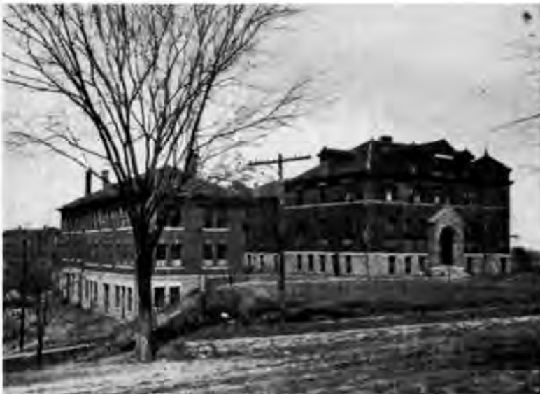
One of the buildings of Western (Freedmans) University overlooking Quindaro, 1920s.

During the spring, 1992, several architecture students from the University of Kansas and Kansas State University launched an initial sweep of local libraries and archives to locate documents related to the early history of Quindaro. After a couple of months of work, a number of published and unpublished sources that dealt with life at Quindaro in the 1850s were uncovered in several regional collections. Although these materials did not add substantially to the historical record, their existence did underscore the need to search some of the major collections of Western Americana at other places (Newberry Library, Chicago; Library of Congress, Washington, D.C.; John Carter Brown