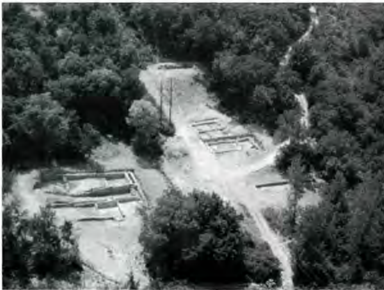
Aerial view of the partially excavated ruins in the center of Quindaro, 1987.

Library, Providence, RI; Beneke Library, Yale University) and archives and museums that carry records of the 19th-century settlement companies and trans-Missouri shippers. In other words, the best way to augment our knowledge of Quindaro is to pursue local oral histories with great vigor and to systematically search the major repositories that contain important records and documents describing towns on the western frontier.