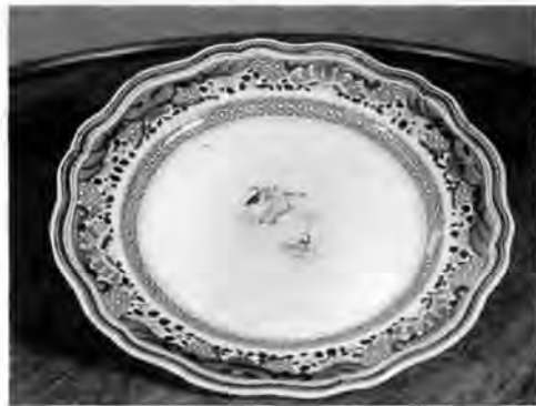
Martha Washington's knife boxes; dinner plate, Cincinnati service; and globe from the "Washington Treasury."