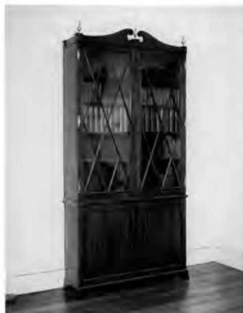
Mount Vernon bookcase from the "Washington Treasury" on display at Arlington House.

Around May 15, 1861, the Lees left Arlington for what they hoped would be a temporary exile. Removal from her home proved most painful for Mary Lee. She had grown up at Arlington, married in one of its rooms, and given birth to six of her children in another. Both of her parents had passed away in the house. Yet, as painful as the separation was, she could draw comfort from the knowledge that her home possessed a capable and vigilant guardian. Just several weeks after the Lees' departure from Arlington, an acquaintance commented on how cheerful Mary appeared, despite having left many of her valuables behind. Such peace of mind was possible only because of