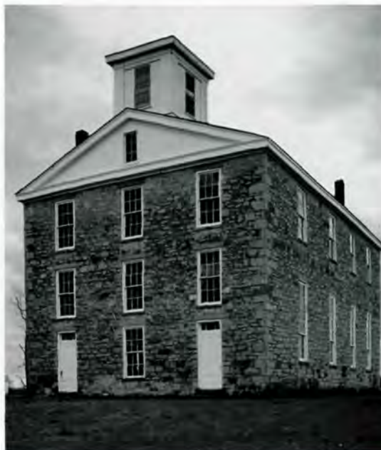
Above, Johnson House, Philadelphia, PA. Right, from top, Rokeby, Ferrisburgh, Vermont; Parker House, Ripley Ohio; Eleutherian College Classroom and Chapel Building, Lancaster, Indiana.