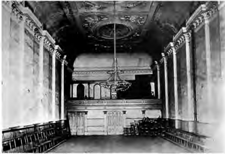
The Great Hall, seen before its restoration. In 1851 and 1854, Torontonians crowded into this large third-floor assembly and ball room, the raison d'être of St. Lawrence Hall, to listen to Frederick Douglass. From St. Lawrence Hall, 1969.

the April 1851 lectures, the first to be held in the building.