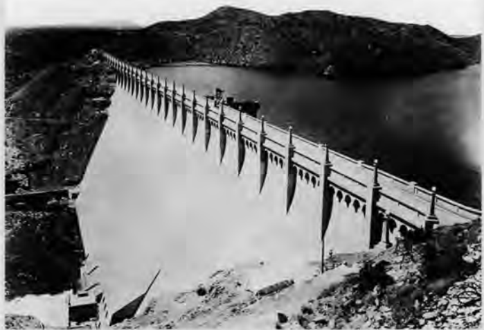
Elephant Butte Dam, Rio Grande Project, New Mexico-Texas.

The 1906 treaty marked a major milestone in international water law and established a doctrine of cooperation among nations that has lasted almost a century. Although controversies surrounding water resources in border regions still exist, the treaty established a solid foundation on which later agreements could stand.