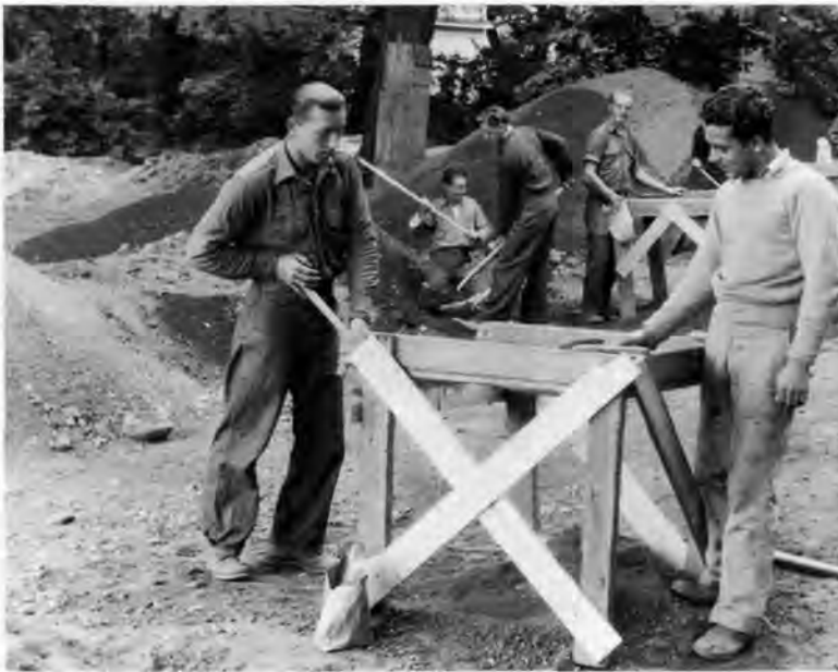
Above, CCC enrollees sifting dirt in archeological work in the back of General George Washington's headquarters at Morristown National Historical Park.