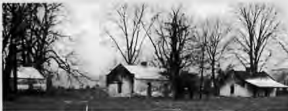
Quarters at Cane River Creole National Historical Park.

Even the meanings local people assign to ostensibly identical resources can reflect diversity. The resources at Cane River Creole National Historical Park in Louisiana, for example, offer special opportunities to explore relationships between plantation systems and people in different cultural and political niches. Two plantations are included there, one with a complex of farm outbuildings and the worker quarters that were occupied by enslaved black people