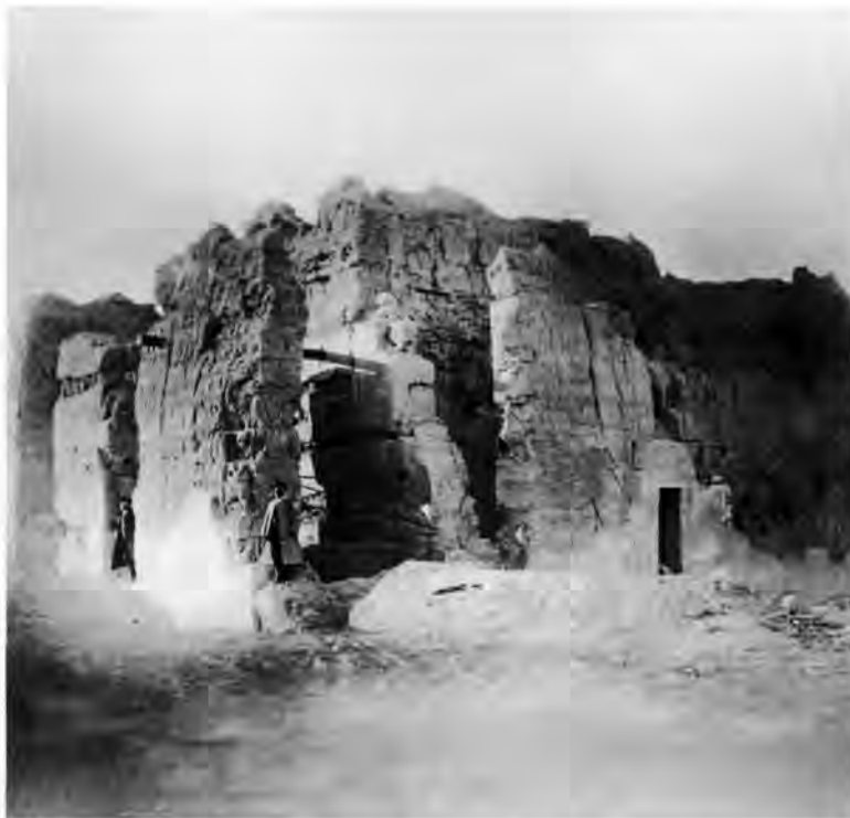
1892 photograph of Casa Grande

Archaeological Institute of America (AIA) responded by drafting a bill. U. S. Representative Jonathan P. Dolliver of Iowa introduced a modified version of it on February 5, 1900. 5 This first “antiquities bill” placed all prehistoric ruins, monuments, and objects on public lands under the Secretary of the Interior’s jurisdiction, permitted excavation and collection for educational or scientific purposes, made the willful destruction or collection of archeological materials a punishable misdemeanor, and gave the President the authority to establish parks. 6