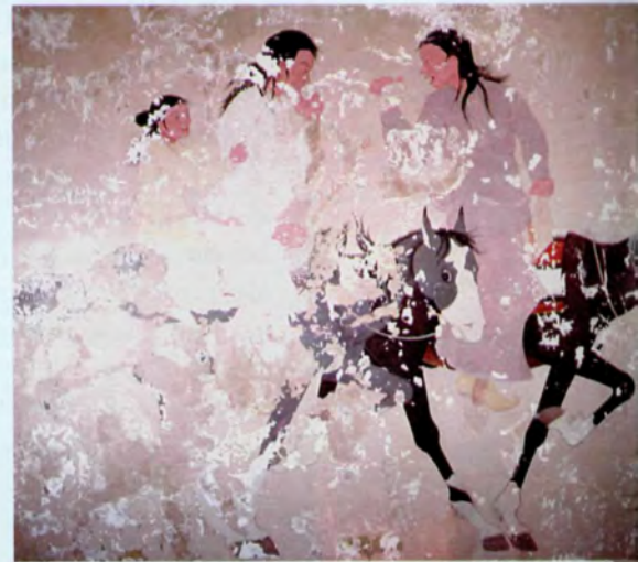
Allan Houser, before and after conservation.

Indian murals in the Interior building's south penthouse.