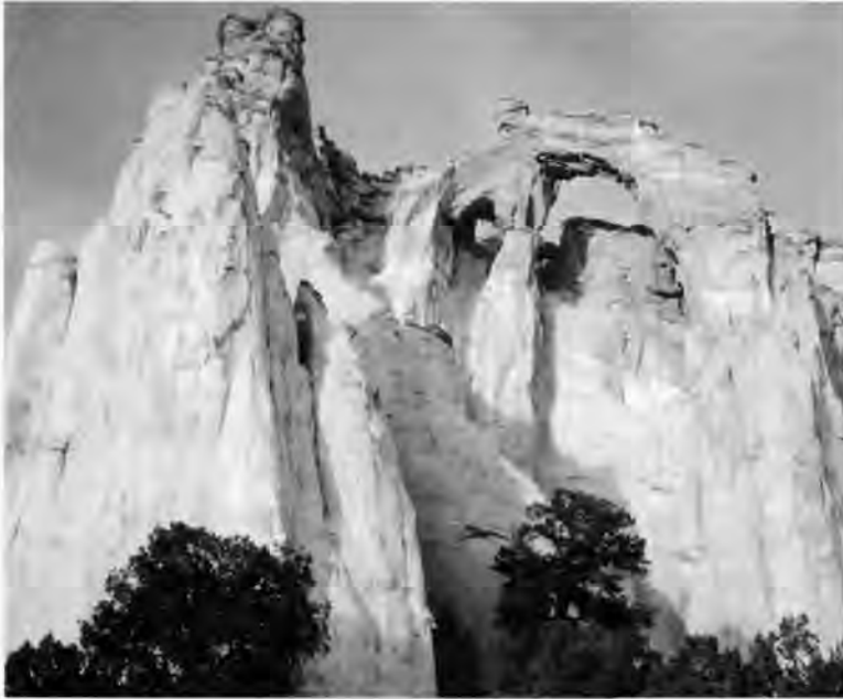
President Bill Clinton's 1996 proclamation of Grand Staircase-Escalante National Monument in Utah triggered local opposition and congressional efforts (so far unsuccessful) to curtail the executive authority granted by the Antiquities Act. Controversial national monument proclamations in Wyoming and Alaska earlier led Congress to restrict the Act's use in those states.

proclaim national forests, Roosevelt reacted by more broadly defining the Antiquities Act's language regarding "objects ... of scientific interest" and the extent of the reservations necessary to protect them.