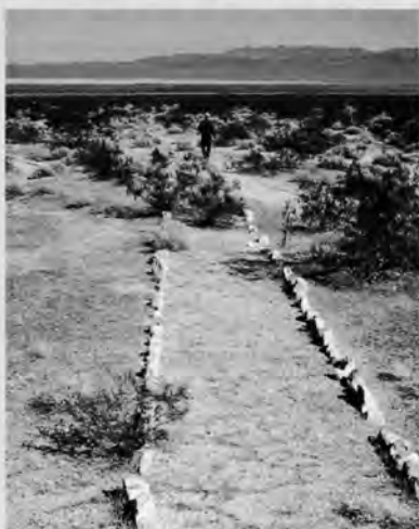
Example of rock-lined walkways remaining at the site of Camp Granite, Riverside County, California.