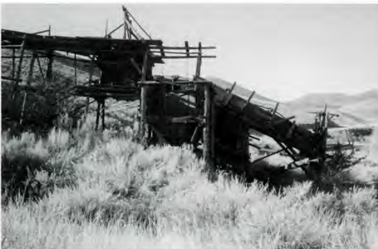
Roadside Mine—Coal Load Out.

States with approved coal mining regulatory programs, called primacy states, must have in place regulations that are no less effective than OSM's regulations governing the consideration and protection of cultural resources. These programs call for the regulatory authority to consult with the State Historic Preservation Officer