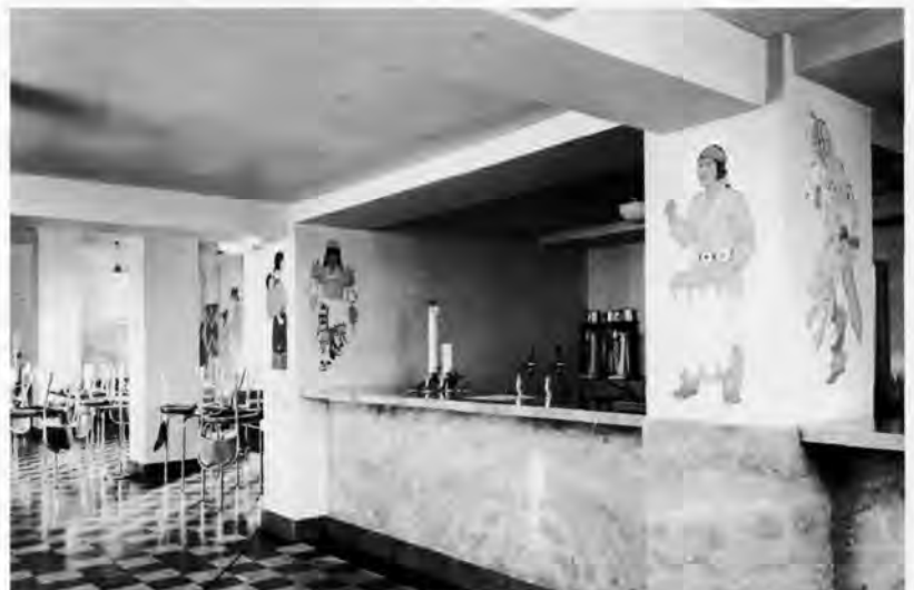
The employee lounge in 1940 (south pent-house, 8th floor). When the soda fountain was removed, the adjacent murals were damaged and over-painted. They have recently been restored.

twofold: to serve as a planning guide for any future work on the building; and to provide a model for other federal, state, and local agencies to identify, preserve, and maintain their own culturally significant buildings.