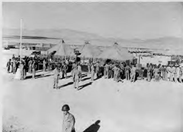
Field PX at Camp Coxcomb, one of several divisional camps in the Desert Training Center, 1943.

Presently, the majority of the Center is managed by the California Desert District of the Bureau of Land Management. Several initiatives are underway to preserve and interpret this extensive landscape. The BLM and Statistical Research, Inc., are cooperating to study, document, preserve, and interpret historic resources associated with the complex, including a recently completed historic context study to evaluate resources and plan for their management. The BLM is actively pursuing other partnerships with institutions to conduct research and promote cultural tourism opportunities.