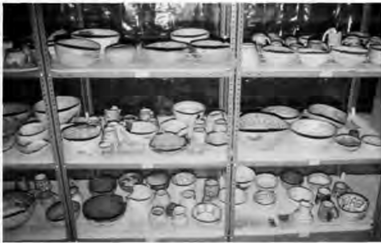
Storage of whole vessels at the Anasazi Heritage Center.