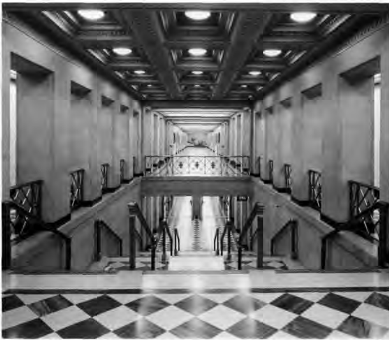
Upper grand staircase, main corridor, 2nd floor, looking south toward the William Gropper mural Construction of a Dam.

explorations and the settling and development of the various sections of the country and territories. The last group of murals represents Native American life.