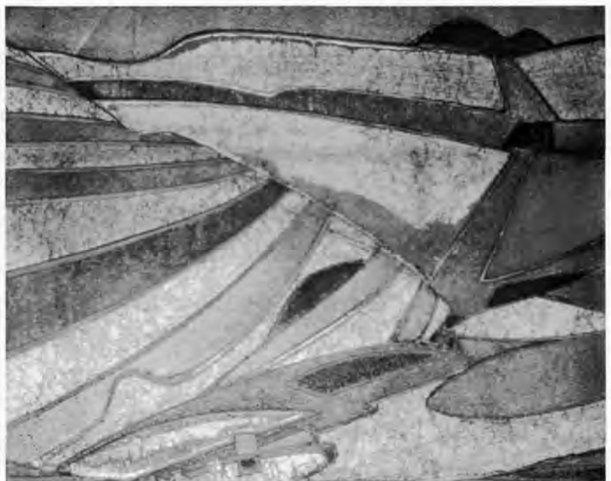
Whiskeytown Patterns, Roland Petersen.

A subtle message is advanced through the landscape paintings. These landscapes, painted in a wide variety of styles, generally portray some natural feature that has been created as a result of a Reclamation project. Alternatively, the painting shows the project in the surrounding landscape. Often the structure is not present in the painting, or if it is, it is rendered inconsequential by its size, treatment and placement in the painting. An example of a landscape painting that does not include the structure is Dean Fausett's painting Campsite at Dawn (p. 48). Here, a craggy landform rises majestically from a serene body of water. The clouds are suitably stormy to provide the dramatic background, and the lighting is relatively harsh, creating sharp shadows on the cliff-