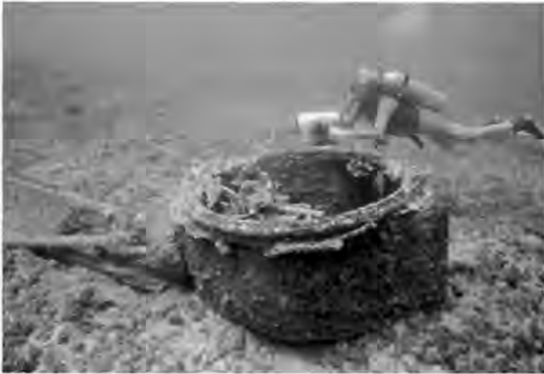
An archeologist studies a turret on a battleship sunk in War of the Pacific NSP.

Resources Unit (SCRU) 10 coordinates the underwater archeology program; conducts studies to inventory, map, and assess submerged cultural resources; develops management, preservation, and recreational use plans; and coordinates and cooperates with other agencies and nations on projects and issues of concern.