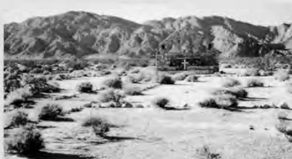
Altar remaining at the site of Camp Iron Mountain, San Bernardino County, CA.