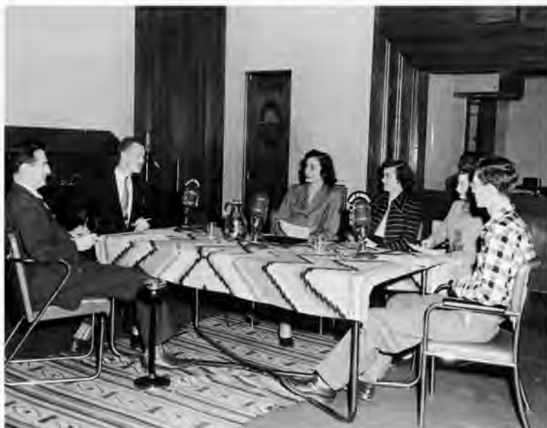
The radio broadcasting studio in 1951 (north penthouse, 8th floor) with a Voice of America broadcast in progress. The studio has been adapted as a conference center.

Many of the murals depict the activities of various Interior bureaus during the 1930s. Other murals portray historical themes, including early