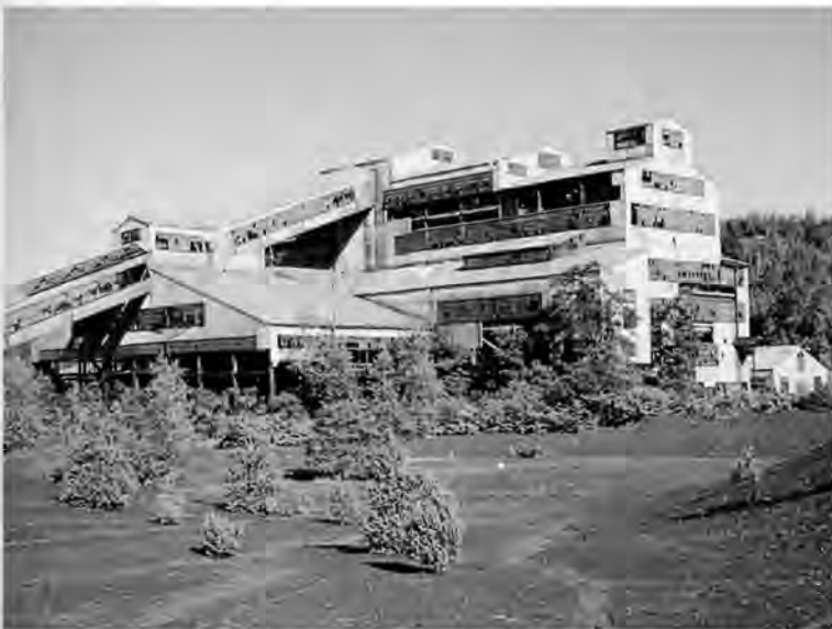
Locust Summit Breaker, anthracite coal region, Pennsylvania.