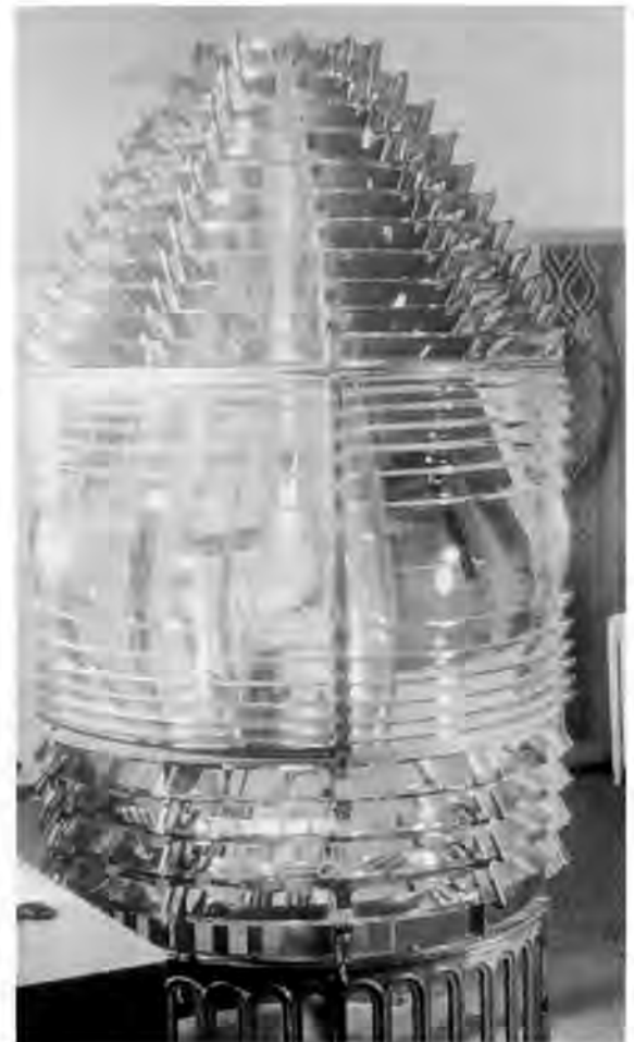
A third order lighthouse lens on exhibit in the lighthouse keeper's quarters.

The other treatment most often requested is that the brass support structure be returned to some previous appearance by repolishing it. The problem with polished copper alloys is that either constant maintenance or a brass coating that protects it from further corrosion is required to