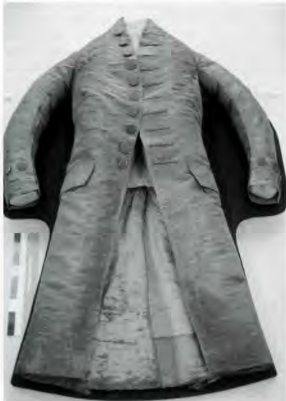
Inaugural coat worn by George Washington, Morristown National Historical Park. After treatment support board and interior supports.

Morristown National Historical Park, New Jersey, has in its collection the inaugural garments belonging to George Washington. The garments, a silk coat, vest, and trousers, are in very fragile condition. The park requested the garments be prepared for long-term storage. However, they also wanted the option to exhibit any one of the