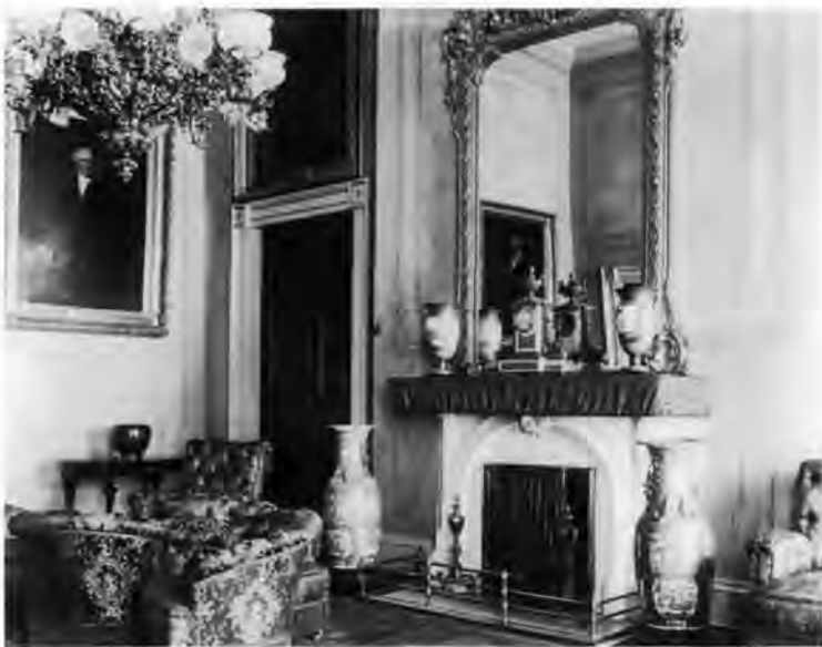
Green Room, 1893.

Somewhat lighter and airier in feel than the East Room, the Green Room is a small room located along the south side of the building, between the East Room and the Blue Room. In a photograph dated 1893, taken at the end of the Harrison administration, a large piece of upholstered seating furniture, serpentine in shape, is covered in a lavish textile. Known as an indiscret , this type of seating furniture is described as being “typical of conversational seating fashionable