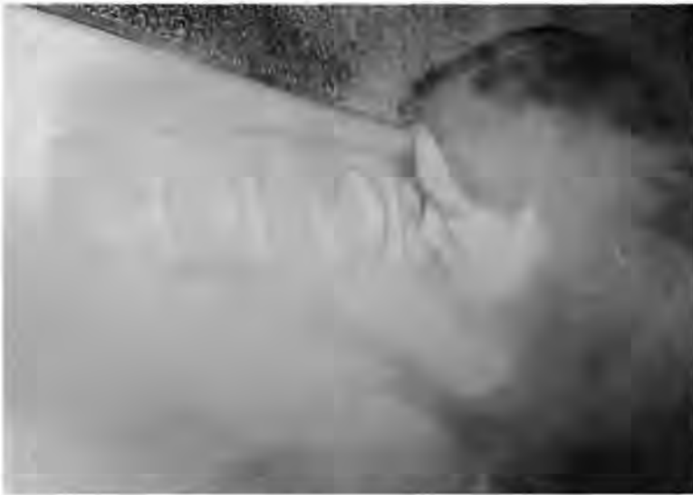
Conservator steam cleaning the "Colorado" stone.

the American Institute for Conservation of Historic and Artistic Works. These professional standards ensure that treatments are based on a thorough understanding of the problem(s), they cause no harm to the cultural property, they can be removed at a later time, and are documented with text and photographs.