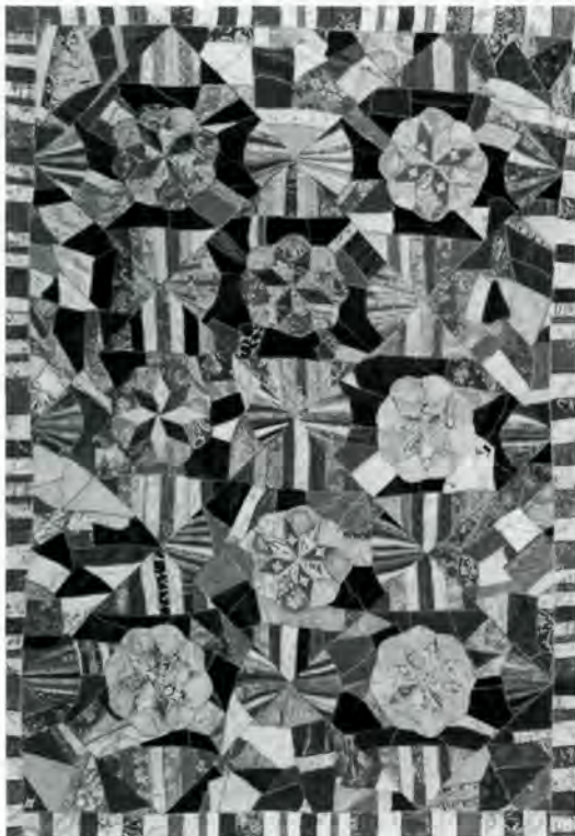
Crazy Quilt, c. 1893-1904, from The White House Collection.

A stereo binocular microscope (common equipment in most large conservation labs) was used to characterize the weave structure of the textiles. This step is particularly important in cases where there are several small pieces of simi-