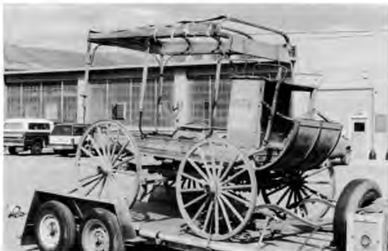
Shaw & Powell buggy, before conservation, being loaded for transport to conservator's workshop in Cody, Wyoming, 1997.

The treatment that was ultimately performed on the wagon is best characterized as a mixture of conservation and restoration. A noted expert on Yellowstone stagecoaches with a resume including treatment of vehicles in private collections and museums including the Buffalo Bill Historical Center in Cody, Wyoming, was selected for the job. Compromises to the original scope of work were made to accommodate some of his preferred techniques and materials, since he was deemed to be the best qualified, overall, to work on the vehicle. Before work began, Yellowstone's museum staff photographed every part of the vehicle, using both black and white and color film.