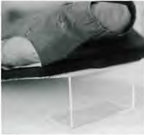
Inaugural vest worn by George Washington, Morristown National Historical Park. Acrylic support in place while artifact is on exhibit.

garments on special occasions for a short period of several weeks. The garments were too fragile to display on a mannequin or even to be handled frequently, so it was necessary to develop a passive system of mounting and storage that eliminated the need for direct handling. A base support was