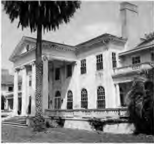
Plum Orchard Mansion.

darkness) and chroma (color saturation). Matches were also made with commercial paint fan decks.