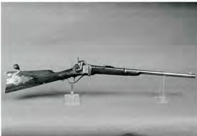
Model 1863 Sharps Carbine with mill crank installed.

The gun is a 0.52 caliber Sharps New Model 1863 carbine, serial number 81319. This weapon (without the crank) was