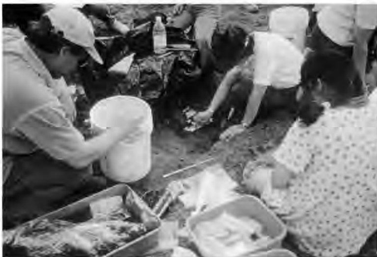
Field Conservation Workshop artifact recovery exercise at Pecos National Historical site.

One of the highlights of the workshop, according to all participants, was the tribal representative-led panel covering specific topics of culturally appropriate treatment. These topics are potentially very sensitive and emotionally charged. Nevertheless, the discussions were frank and informative. Representatives from the Pueblo of Jemez discussed certain concerns the pueblo has with the care and handling of objects from their heritage and site etiquette when on the pueblo's ancestral sites. The concerns were not only for the physical and spiritual well being of the objects, but also for the people handling them and for the pueblo as an organic whole. Discussions by representatives from Zuni Pueblo also emphasized the special concerns of the Zuni people. A guest presenter from the Navajo Nation expressed concerns about the typical methods and materials used by museums during fumigation and other preservation-related activities. The methods and materials used, while physically preserving the object, may in fact have serious detrimental effects on the spiritual well-being of objects, especially ceremonial and other sacred objects. Other discussions and presentations covered culturally appropriate treatment issues resulting from consultations held as part of