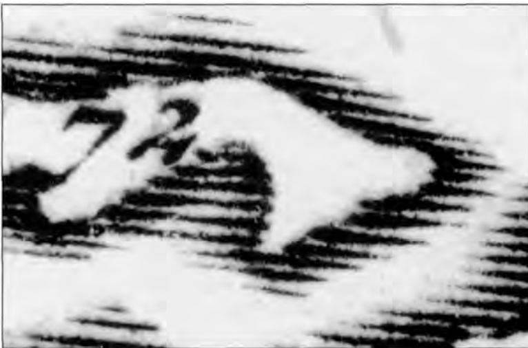
Magnified example of engraving.

the plate makes a casual or quick drawing style impossible. Shaded and dark areas are made with crossed lines, called cross-hatching. Solid, black, wide lines are impossible with this technique. Large, wide letters are made by cutting lines immediately adjacent to each other. Because the ink is deposited from troughs in the plate, heavy lines will be raised slightly above the paper sur-