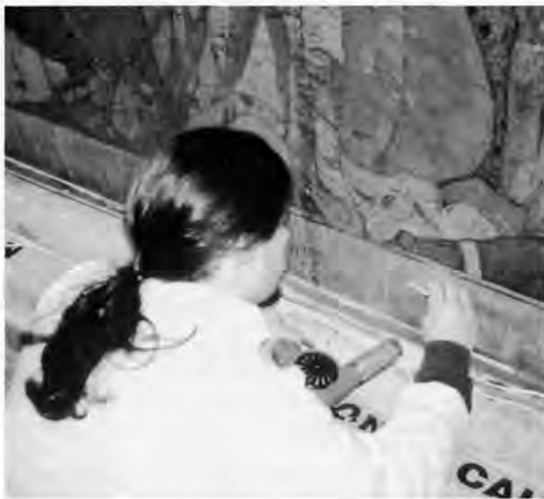
A conservator on the team of Cunningham-Adams Fine Arts Painting Conservation treats the north mural.

The conservators tested methods of cleaning and consolidating the murals before selecting treatments. The first step was to clean the paintings very delicately with one-foot square com-