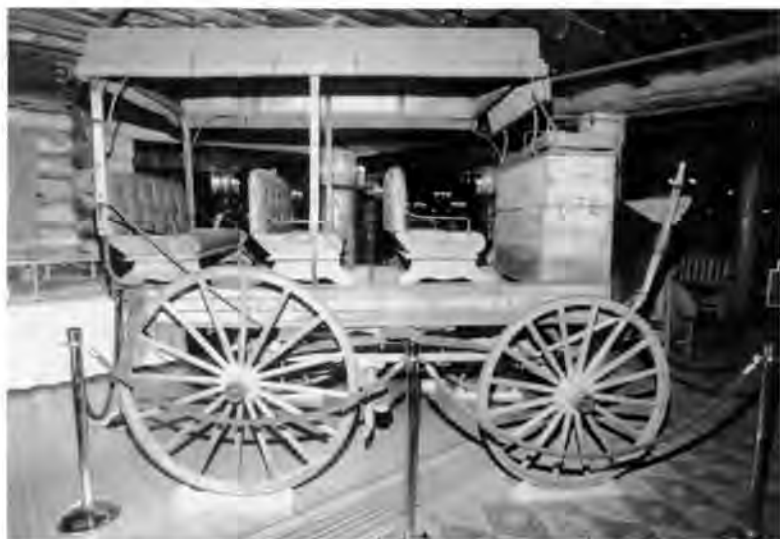
Shaw & Powell buggy—after conservation—on display in the Old Faithful Inn Lobby, summer, 1998.

The conservation/restoration of the vehicle was performed locally over a period of six months, and entailed stabilization as well as wholesale replacement of missing elements. Described and photodocumented in a final report, treatment included rebuilding most of the top of the wagon and replacing the left side-panels of the driver's box and the driver's footrest. A set of side springs, correct for this vehicle and from the same time period, was located near Helena, Montana and installed on the wagon. The original front springs were re-arched to match the side springs. Original seat parts, found lying on the floor of the wagon, were combined to create one complete seat. The two other passenger seats, all of the leather upholstery, the front leather boot, and the side curtains are historically accurate reproductions of the originals, based on archival photographs and Studebaker catalog illustrations. The seats were stuffed with a rubberized hair product recommended by HFC in place of the excelsior with which the seats appeared to have been originally filled. The iron tires of all four wheels were tightened, but required no other treatment. Pigmented microcrystalline wax may be applied to the wagon's ferrous metal elements at a later date.