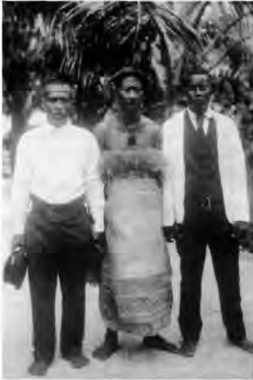
Traditional clothing vs. "western" clothing, c. 1900.

nation where the majority of its citizens are Marshallese in heritage. Land tenure is such that it is difficult, if not impossible, for outsiders to own land. Several organizations are collecting and preserving historical information. 4 However, while people elsewhere, say, Hawaii, perceive the adverse effects of external cultural influences, and are joining together to preserve traditional art and customs, the movement is less evident in the