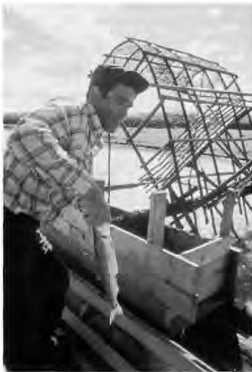
Fishwheel on the Yukon Charley River, Interior Alaska.

geographic area be identified as having C&T subsistence use of an individual resource; for example, brown bear, or resource category, such as all fresh water fish. A positive finding gives residents of the community a status as federally-qualified rural subsistence users. Typically, the analysis emphasizes past and present harvest levels and use areas, but also includes a range of ethnographic data as part of the factors used to evaluate eligi-