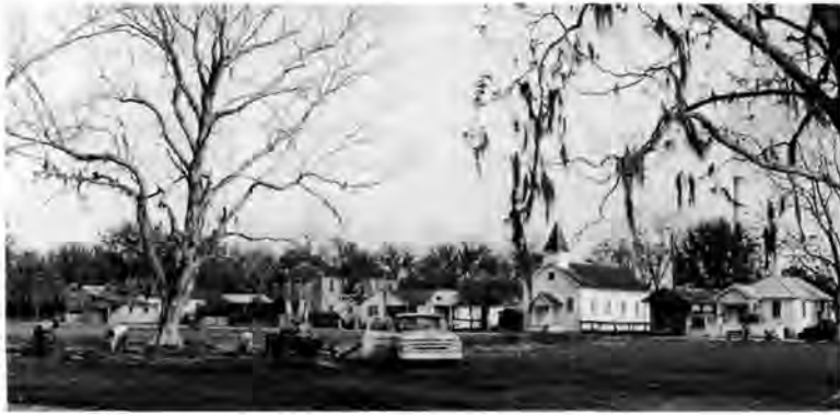
Fazendeville, showing Battleground Baptist Church and homes, 1960.

Parish, Louisiana, where the Battle of New Orleans had been fought in 1815. Fazendeville exemplified the early reconstruction period African-American communities that sprang up after the Civil War. The land was listed in 1854 as part of the succession of Jean Pierre Fazende, a free man of color, 3 who passed it on to his son. After the Civil War, c.1867, the younger Jean Pierre Fazende began to sell lots to former slaves. The residential community of African Americans known as Fazendeville started to grow. 4