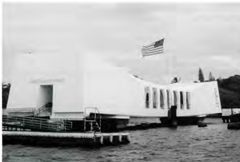
USS Arizona Memorial.

What is at stake at Pearl Harbor? The USS Arizona Memorial condenses highly charged stories about events that changed America and the world—a bombing attack that killed over 2,000