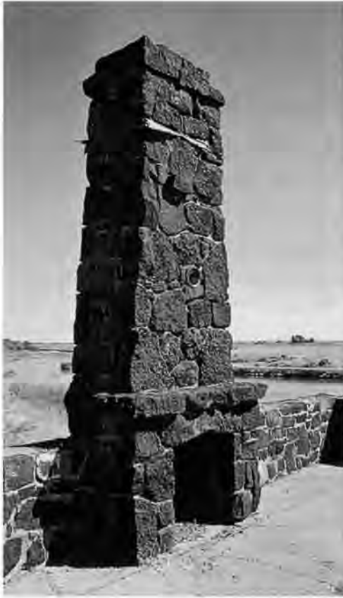
Chimney in waiting room of entry building.

ated in the 950-acre heart of the 33,000-acre reserve.