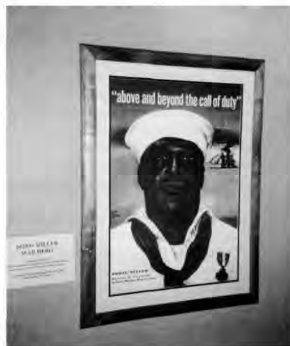
Museum exhibit of recruiting poster of African-American war hero Doris Miller, USS Arizona Memorial museum.

For Americans of Japanese ancestry, Pearl Harbor not only marked the beginning of the Pacific War, it marked the advent of intensified public suspicions, discrimination, and appropriation of property. While elements of this story do emerge in the course of interpretation (as in presentations by a Japanese-American veteran volunteer, who was himself interned in California), in general the memorial does not address this aspect of war history. The absence contributed to the recent controversy in which local Japanese Americans objected to the depiction of Japanese Americans in the documentary film, leading to modification of offending parts of the film. The newer film, like the one it replaced, only referred to Japanese Americans in the context of the U.S. commanders' mistaken assumption that large numbers of local Japanese were potential spies and saboteurs. It disregards the experiences of local Japanese Americans, many of whom worked on the bases and rallied to the defense of the island during the panicky days after the attack. The relative absence of local stories may be one