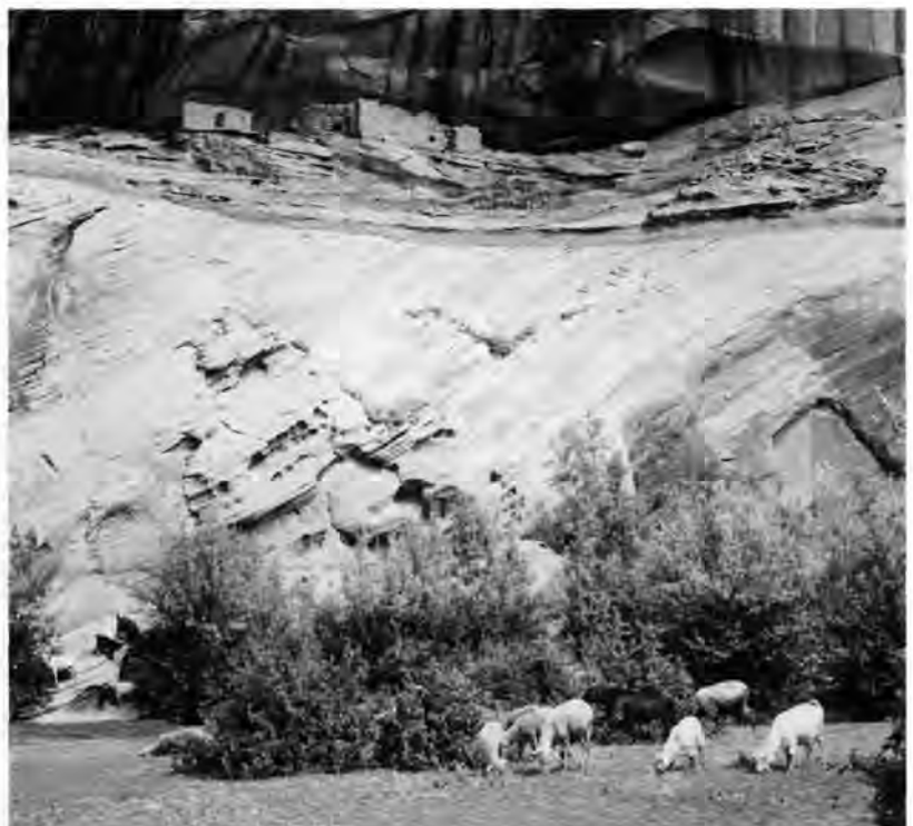
Navajo sheep grazing near Junction ruins, the cliff masonry construction by earlier American Indian people at Canyon de Chelly, Arizona.

We noticed another interesting pattern. The canyon residents we interviewed, not surprisingly, emphasized places within their own customary use areas. More surprisingly, they told different stories about widely-known sacred places in those areas than non-residents told about those same places. The non-residents referred to stories known all over Navajoland about the origin of particular Navajo ceremonies, beliefs, and customs. They referred specifically to the episodes of these stories that occurred at particular places in the canyon. The residents told about encounters between family members and immortal personages ("Holy People") or unusual manifestations of power that go with these places according to the widely known origin stories. The residents' stories linked the family through personal experi-