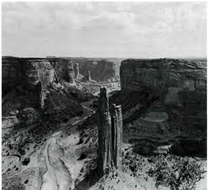
Spider Rock at Canyon de Chelly National Monument, Arizona.

Limits on time and money in both phases of this project allowed us to interview a total of 16 people, a group too small to represent a cross section of resident families and others who use the canyon and its rims for Navajo cultural purposes. To get as wide a range of information as possible, we tried to talk to people with as many different interests in the canyon as possible. The group includes residents of different parts of the monument, non-resident users, medicine people, guides, women and men, old and relatively young, people interested mainly in the Navajo occupation in the last few centuries, and others interested mainly in the canyon's role in Navajo ceremonialism.