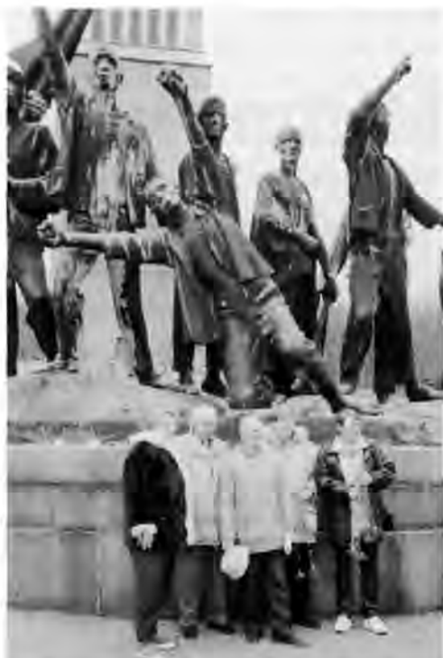
Survivors at Buchenwald in front of statuary representing the victims of the camp. This monument was built in the Communist era, but remains to this day.

mesh with the perceived realities of living communities. Anthropology has been called “the uncomfortable science” because we look beneath the surface of public presentations of self and community to understand such cultural dynamics. Thus, using my observations from several different countries and traditions in public history, I have come to the conclusion that there are some guidelines to follow in making discrediting history a part of public displays.