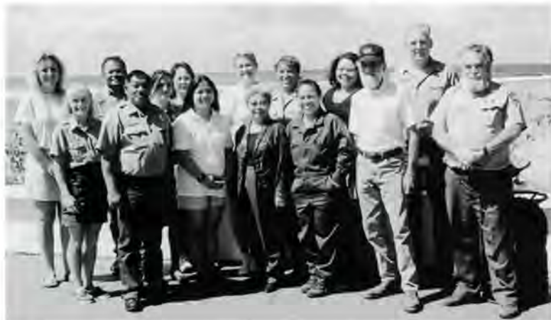
Staff (including native Chamorro personnel) at War in the Pacific National Historical Park Headquarters on Guam.