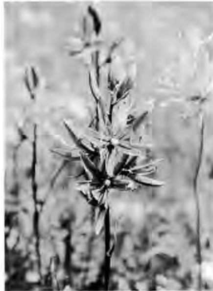
Camas (Camassia quiviana) was an important root food for the K'tunaxa and Piikani. The bulbs were collected in large quantities and cooked in large, stone-lined ovens.

be a return of some selected areas in a landscape to a condition approximating what they were in at the time some parks were established—at least from the standpoint of selective plant productivity and condition. This would amount to a historical reconstruction of landscape elements that more closely reflects the condition of the land and resources when non-Indian peoples first arrived. If such limited experiments were successful, the concept of “cultural landscape” would be expanded to recognize the resource-managing skills of Indian peoples. For the natural scientist, experiments that reveal the effect of plant horticultural and collection techniques on the range, morphology, and productivity of native plants should also be of great importance. If such experiments are conducted, they can be allowed under a scientific permitting system, thereby avoiding