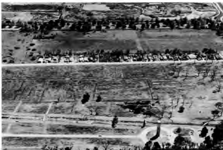
Aerial photograph, c. 1960, showing Chalmette Monument in foreground, Fazendeville community in center, Chalmette National Cemetery among the allée of oaks in rear and Kaiser Aluminum Plant, far rear.