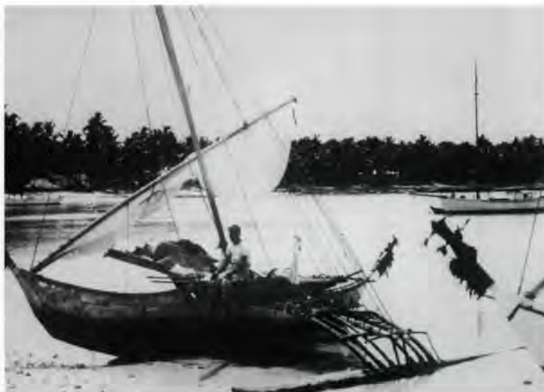
Traditional outrigger canoe, c. 1900.

The Republic of the Marshall Islands (RMI) has much in its favor. It is an independent