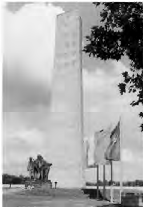
Sachsenhausen monument designed in the Communist era and still standing. A symbolic chimney meant to show the thousands of deaths that occurred in this camp.

Anthropological training and perspectives are useful in resolving some of these issues. We understand that historical presentations must