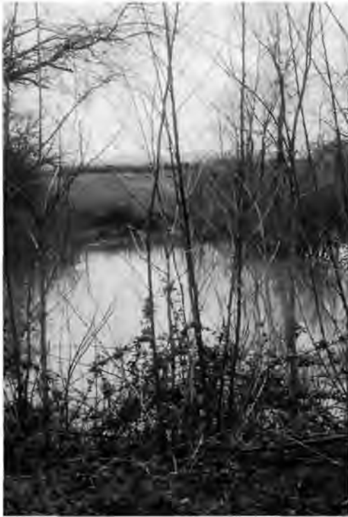
In the background, site of the now-leveled but legendary AME Church near Cane River Creole National Historical Park. It still serves local residents as a place marker; an ethnographic resource, in NPS parlance.