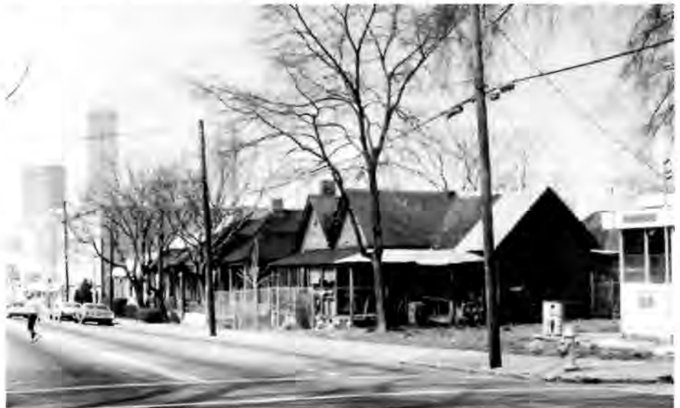
An ethnographic resource, the contemporary residential and business community known as Sweet Auburn contributes to the dynamism of the Martin Luther King Jr. Historic Site.