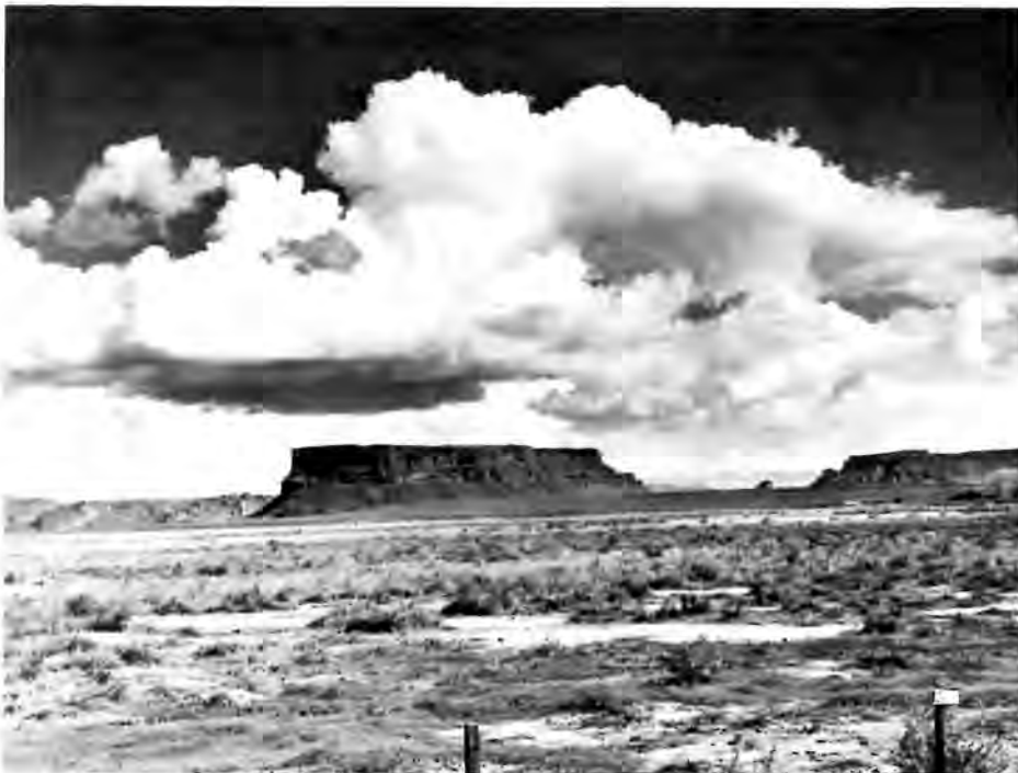
Grand Coulee National Natural Landmark, Washington, a 32,000 acre illustrating the sculpture of the land by volcanism and the advance and recession of glacial ice.

This year, the 25th anniversary of the National Natural Landmarks (NNL) Program, heralds the beginning of new friendships and working relationships with other programs within the NPS, other Federal and State agencies, private organizations, as well as the general public. The key to establishing these relationships is better communication. The means is the creation of programmatic links through increased sharing of data. Our objective, through information management, is to encourage the integration of natural landmarks data into public and private planning and decisions to help protect these unique sites.