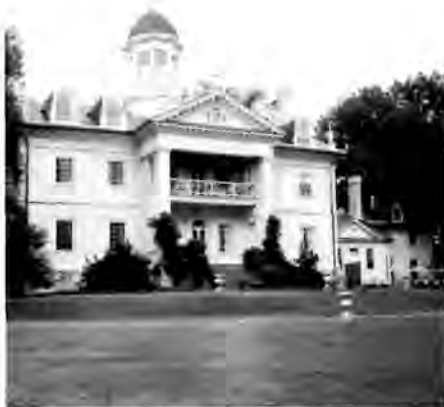
Hampton Mansion