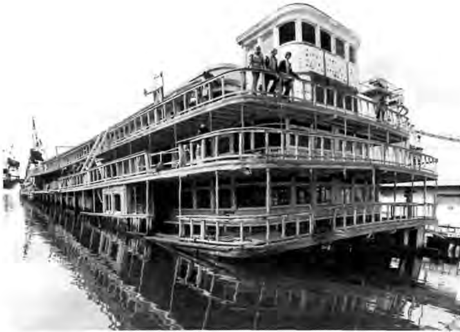
Shown being raised from the bottom of San Francisco Bay in 1984, Delta King is now a floating riverfront attraction in Sacramento, California.