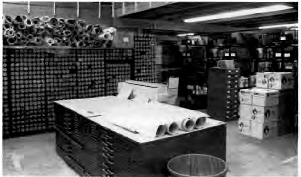
A portion of the processing and storage area for vessel plans at the San Francisco Maritime National Historical Park. A mixture of archivally-sound storage in flat map files and temporarily rolled storage of unprocessed collections is shown.

The museum's collection is particularly rich in vessel specifications, notable among them the wooden ships of Hall Brothers of Washington State, the long and varied life's work of the shipbuilding Dickie family, and the iron and steel vessels produced by Moore & Scott of Oakland (California). Specific data about type of wood, dimensions of timbers, method of rigging, and kinds of fittings contained in the shipbuilder's specifications combined with core samples or measurements taken on site often make possible a positive identification of a shipwreck site. The juxtaposed remains