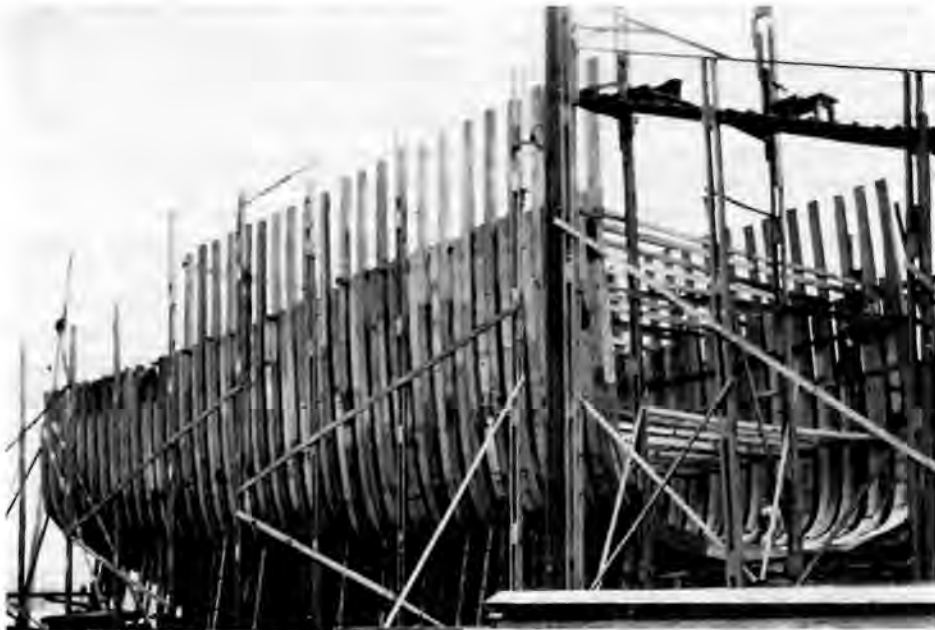
Photographs and vessels under construction often document otherwise unmentioned construction details. Note the tight spacing of the frames in this view of a steam schooner under construction at the Rolph Shipyard, Fairview, California.

Growing public awareness of the significance and value of submerged cultural resources had led to increased pressure and threats to the resource. Managers from the Channel Islands National Park, the Golden Gate National Recreation Area, and the