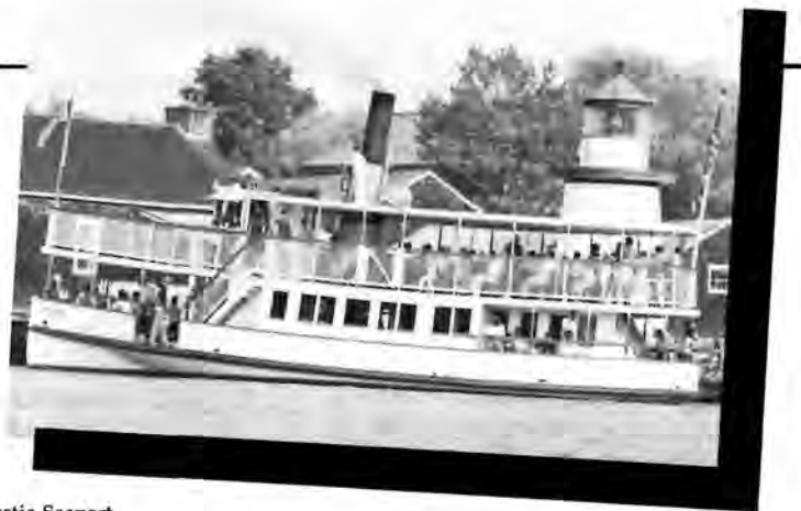
Steamboat Sabino at Mystic Seaport.

Four other opportunities are available for the public to experience the thrill of steamboating: Mystic Seaport