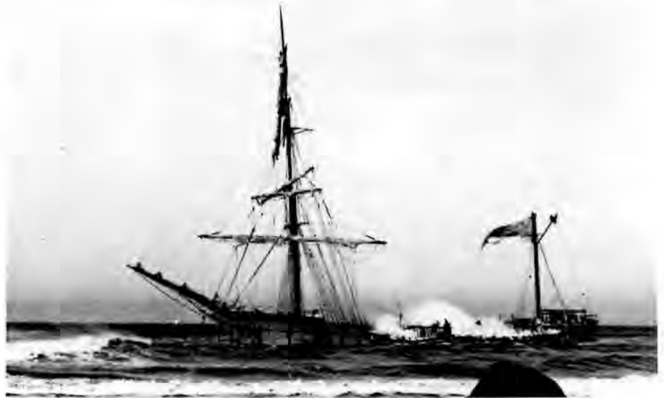
Shipwreck research now looks at how and why a wreck occurred.

Most current academic shipwreck research perceives wrecks as isolated sites disconnected from a larger context. Site-specific shipwreck research is somewhat like early historic preservation studies that sought to collect specific details for architectural reconstruction and particulars for site interpretation. A single wreck is usually evaluated in terms of its level of preservation and excavated to recover all the artifacts. Shipwreck archeology reports are normally descriptive accounts of the investigation, recovered cargo, and other materials, and it is a rare report that goes beyond description to discuss a wider wreck context. Most wreck studies conducted for CRM purposes have paralleled the academic research, in that only questions of "where" and "what" are addressed.