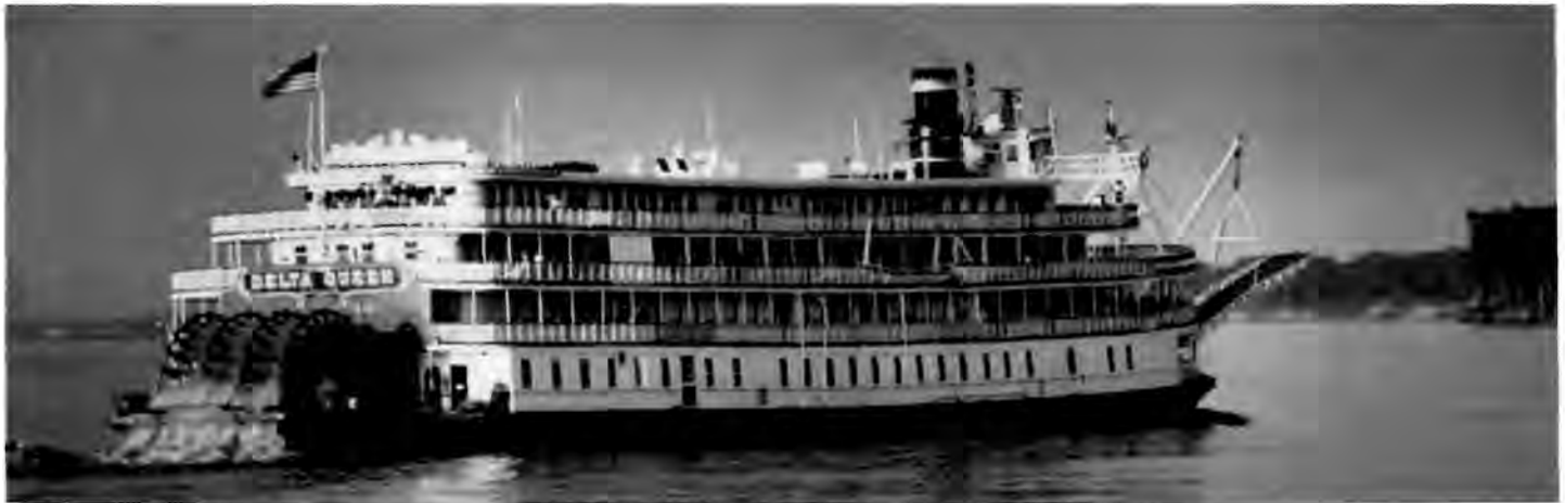
Riverboat Delta Queen steams down the Mississippi.

owners financially responsible for the design and operation of their vessels. The loss of 1,523 lives in the steamship Titanic disaster in 1912 also had immediate and long-lasting effects on vessel safety laws. Lifeboat capacity was required to equal the number of people aboard and new regulations made radio a more effective safety device. Later acts and regulations strengthened these laws considerably.