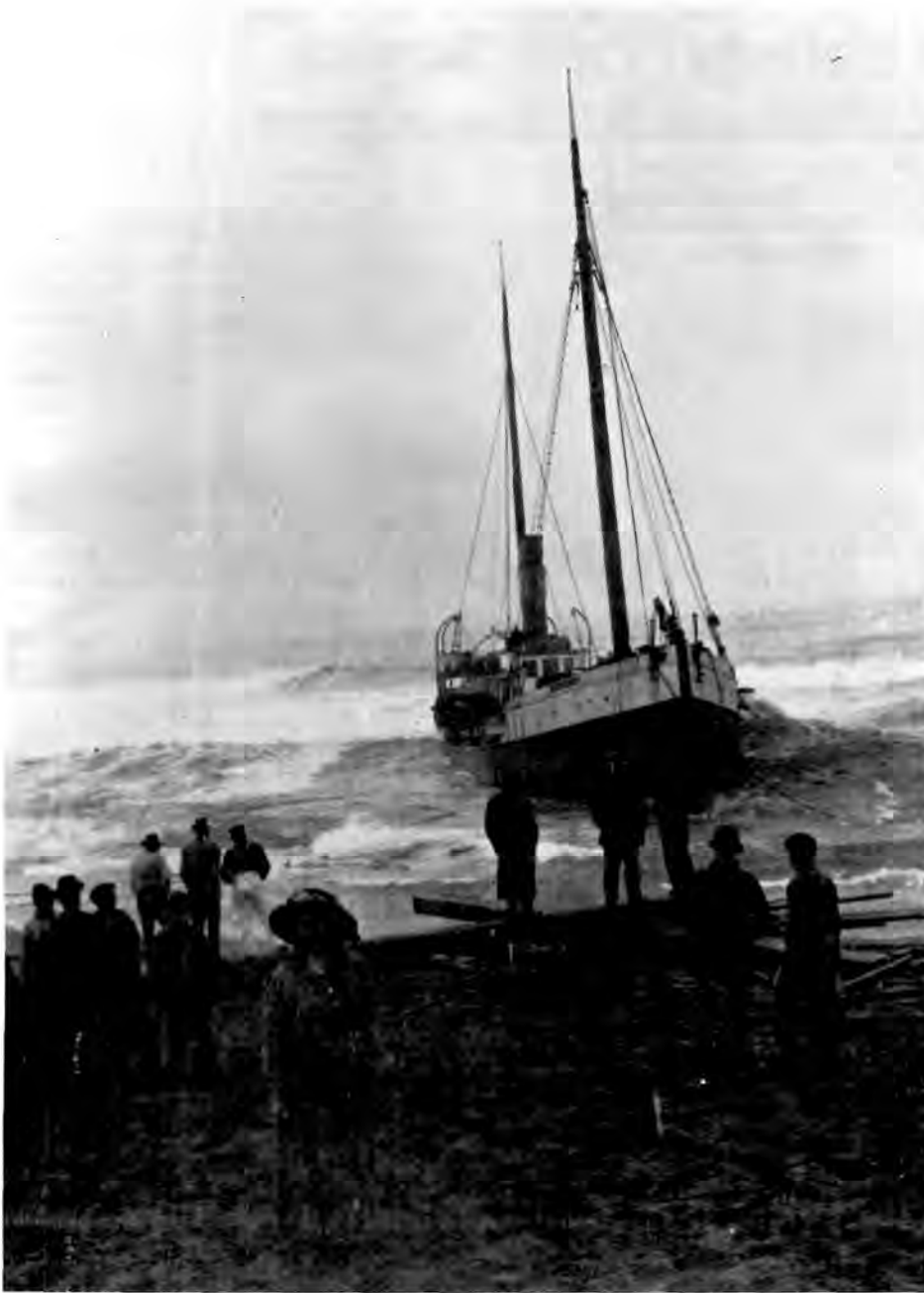
Shipwrecks were not isolated events. They often had a profound effect on local culture and reflect society's response to tragedy.