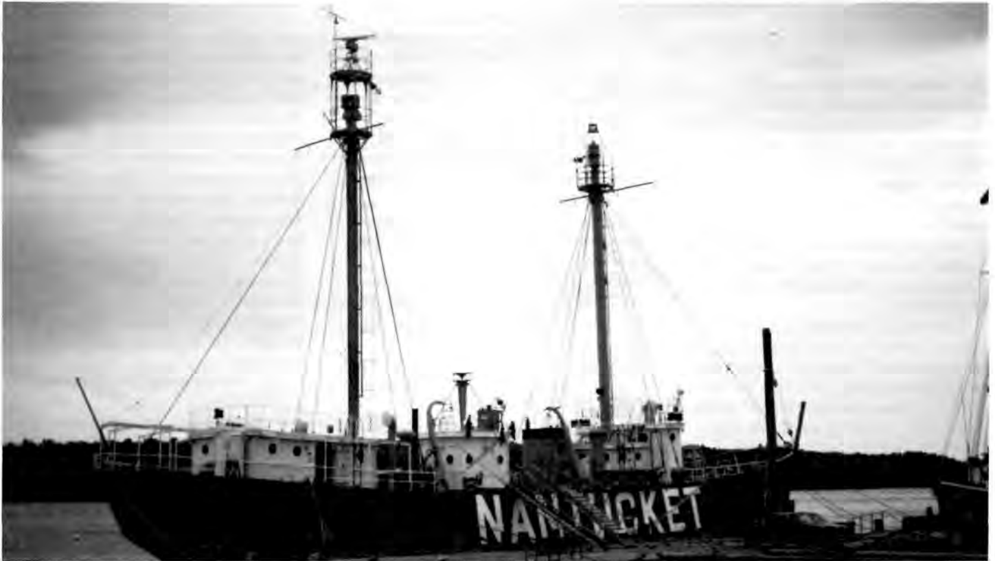
Lightship "Nantucket," recently restored, is in need of a permanent home.