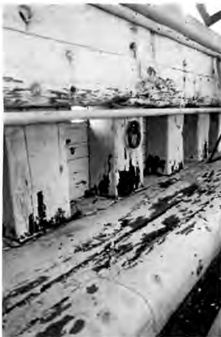
Dry rot in the bulwark, stanchions, and waterway of Wapama.