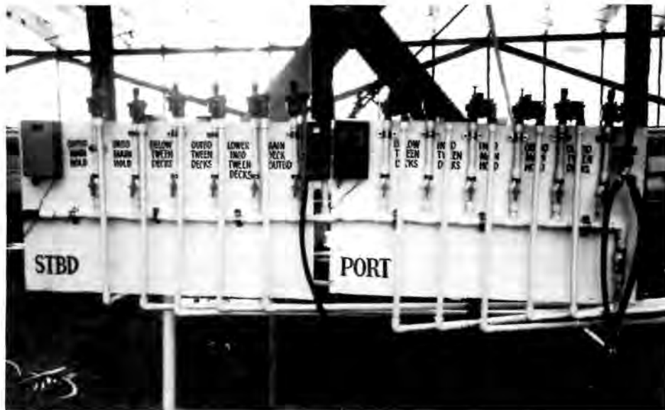
Three times a day, an intricate system of tubes and valves sprays an aqueous solution on the interior of Wapama to arrest her most serious ongoing problem — dry rot decay.