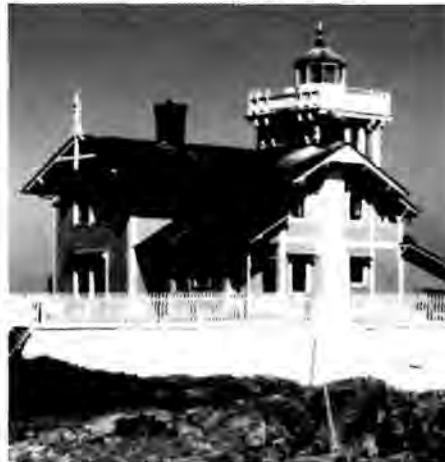
East Brother Light.

Grosse Point Lighthouse. Owned and maintained by the Lighthouse Park District of Evanston, Illinois, Grosse Point Lighthouse still operates