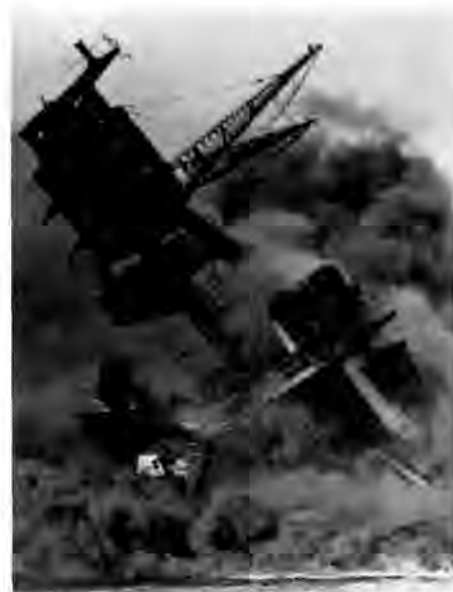
The wreck of USS Arizona is the tomb for several hundred men who died aboard her on December 7, 1941.

The guidelines still fall short, however, of addressing the sensitive issue of dealing with human remains that are interred in a shipwreck site where sport diving occurs or has the potential to occur. Should the site be closed to diving until arrangements can be made to recover the individuals? If the ship is in deep or cold water and the remains are difficult to reach, should they be left in place in the hope that inaccessibility will continue