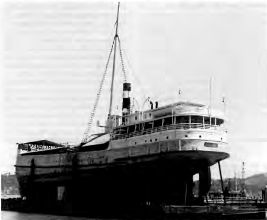
Wapama on her preservation barge with a protective roof over her decks, 1986.