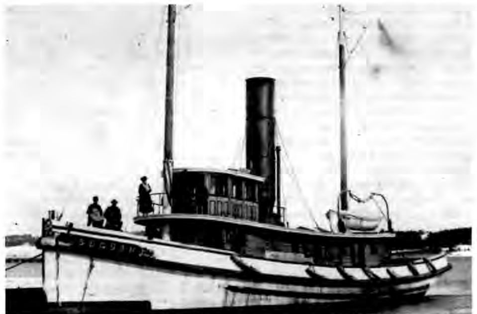
Seguin in 1885.