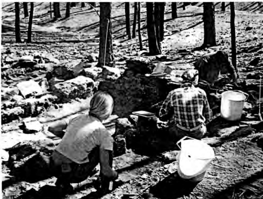
Archeologists at work after the La Mesa fire.

While all the post-fire studies from the La Mesa fire should be considered as a whole, the La Mesa Fire Study focused in particular on the impact of the fire and fire suppression activities on cultural resources within Bandelier National Monument. The study was designed in part to: survey all areas affected by fire suppression within the Monument boundaries; excavate selected sites burned in varying degrees for specific data on artifacts, architecture, and ecofacts; salvage sites damaged during fire suppression activities.