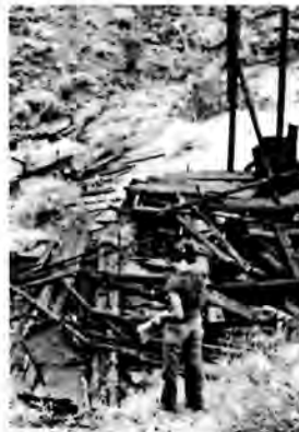
Recording mining structures — Lake Mead.