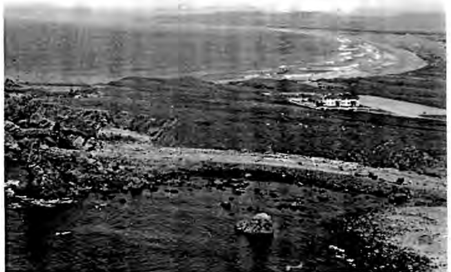
Aerial view of Point St. George, facing North.