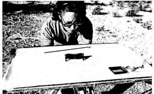
Mapping desert mining site.

Recently, the regional historical staff called regarding a cluster of 1940s buildings slated for demolition by park managers. Historians and architects had looked at the buildings and found them to be without redeeming value. They were, however, intrigued by a small adobe ruin on the property. Could this ruin be of interest to the historical archeologist, they wondered? We drove to the park, looked at the property, and agreed that, indeed, the 1940s frame buildings didn't amount to much. The older adobe ruin was another story. It also was an old ranch building, with remnants of footings and walls, traces of outbuildings and fences, and, best of all, a large accumulation of late-19th-century trash.