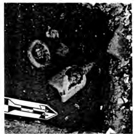
Cellar fill, City Point, Virginia. Note the glass bottle seal resting on the circular glass Bottle Pontil, foreground. It is dated 1742 and contains the initials P.T.

In addition, a remote sensing survey of the Point contracted by the Park Service used ground-penetrating radar apparatus and a magnetometer to locate and map sub-surface anomalies, geophysical features which may indicate the presence of cultural resources on further investigation of the site. Upon excavation, one such rectangular area proved to be the