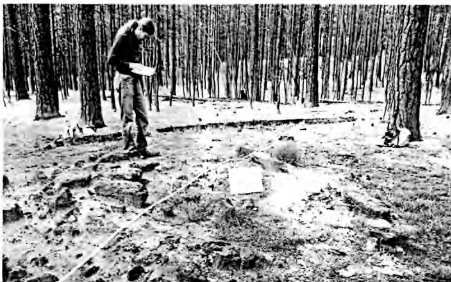
Work continues on site of La Mesa fire.

10. Good luck -- because that's what these cases seem to hinge on.