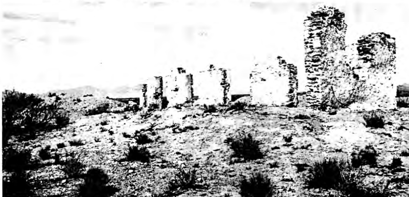
Officers Quarters at Fort Craig, New Mexico, a major frontier post from 1854 until 1885, site of the first major Civil War battle in the West.