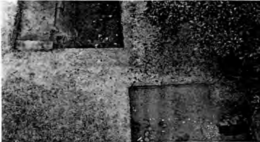
Aerial View of the Cellar (top) and South Chimney Foundation of the pre-1763 House, City Point, Virginia.