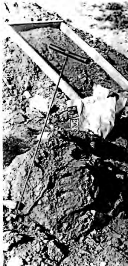
Auger and screen in use by pothunters, near Petrified Forest National Park.

Issuing a Magistrate Violation Notice: When should an MVN be issued? What should be said to a parent who asks if his child can keep a chipped stone tool? To a visitor using an electronic discovery device? The CFR indicates that the removal or destruction of park resources is against the law. In cases of clear illegal intent, the MVN is issued with customary procedures. In cases where a visitor seems genuinely uninformed, the park staff should thank the person for bringing the resource to their attention, note discovery location and explain that such historic objects are part of the total park resources and have possible interpretive value to