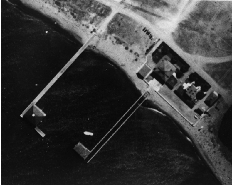
History figure 7. Aerial photograph from about 1938. This view corresponds closely with the site plan drawn up that year. Note that old boathouse (PE 1902) has not yet been aligned with buildings PE 1901 and PE 1903. Maintenance shop (PE 1907) at head of marine railway shows original north-south orientation of roof. [34]

The interbellum was a relatively stable period for the Fort Point Coast Guard Station. Following its reconstruction in 1915 at the present location, only minor changes were made to the facility until after World War II. Sometime between 1924 and 1926 the hen house and water tower were removed. By 1926 a basic landscaping scheme was also introduced, the rudiments of which still survive. This included a grass lawn surrounding the Boathouse and the O-in-C Quarters, a cypress hedge along Marina Drive, and a row of palm trees just inside this hedge (the palm trees can be seen in photographs from as early as 1922). The most significant structural changes occurred sometime between 1932 and 1935, when the front porch of the Boathouse was enclosed. The O-in-C Quarters were probably modified at this time as well. A detailed site plan made in 1938 indicates that the old kitchen has finally been removed and the building remodeled according to the plan proposed by Andre Fourchy in 1914. [35] The center rear dormer was also extended so that it is flush with the outer wall of the shed below it. The 1938 plan shows a number of other modifications which occurred sometime between 1926 and 1938. During this period the wooden seawall was replaced with the present concrete wall. The flagpole was moved to the middle of the driveway in front of the O-in-C Quarters again (this is where it stood in 1915). And two small garages were added just west of the old boathouse.