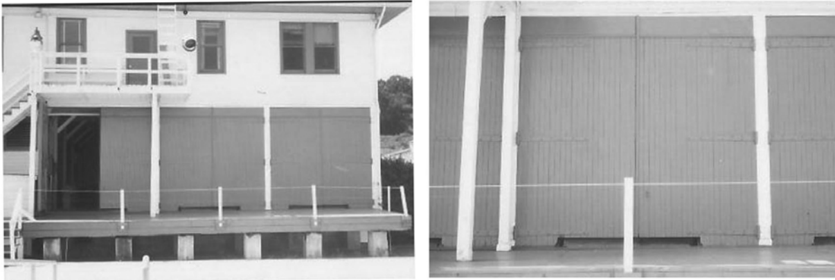
History figure 10. Photograph of main boat doors with detail, taken in 1978 shortly before their removal. [48]

between existing load-bearing piers. Whether these recommendations were followed is not known. All proposed actions except number 4—removal of the World War II-era shop—were eventually carried out. [47]