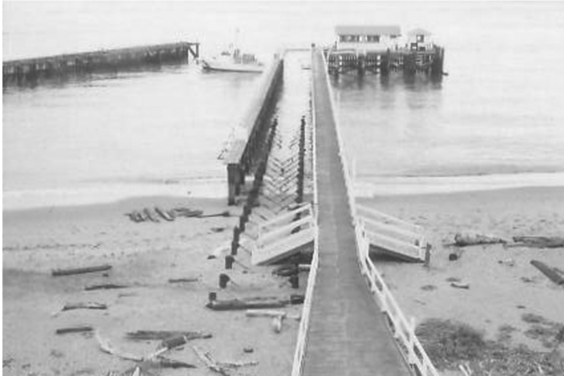
History figure 9. Photograph of deteriorated marine railway in 1978 shortly before its complete demolition. [45]

The marine railway has not been used for over 15 years. It is in an advanced state of deterioration. All that is left of the railway itself are the pile bents. Only the easterly catwalk, which is in fair condition, is still required as access to the search and rescue boat dock. [44]