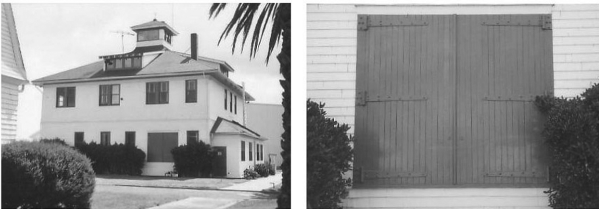
History figure 11. Photograph of beach apparatus door with detail, taken in 1978 shortly before its removal. [49]