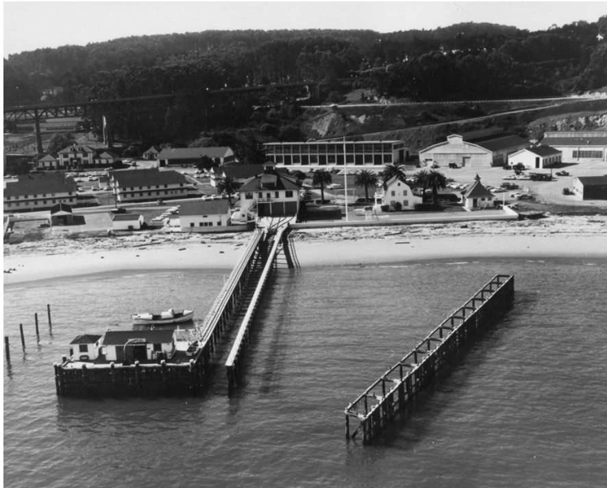
History figure 8. Aerial view from north ca. 1958. [39]