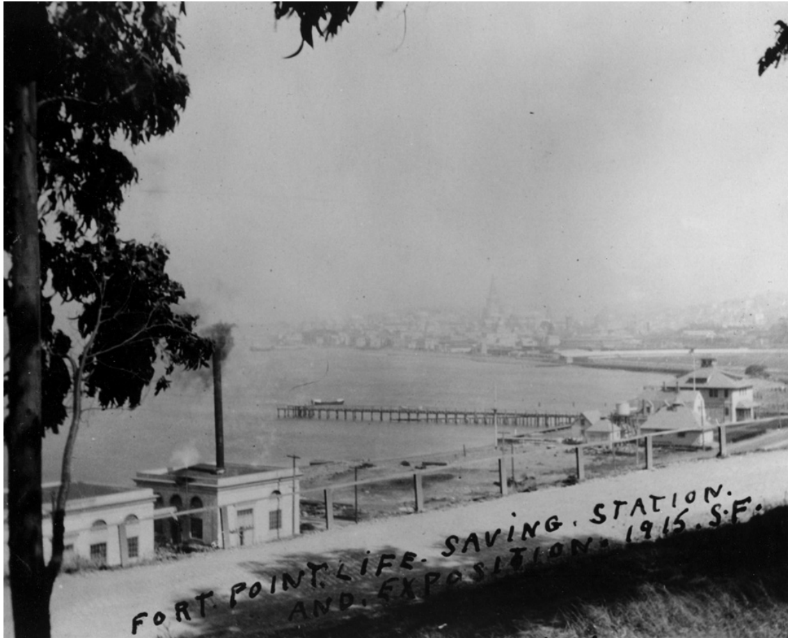
History figure 6. Photograph of Fort Point Coast Guard Station from late 1915. The new boathouse (bldg. PE 1903) is visible in background. This is the earliest known image of the new boathouse. Old boathouse (bldg. PE 1902) has been moved to present location and converted to a garage. Exposition garbage incinerator visible in left foreground. [30]