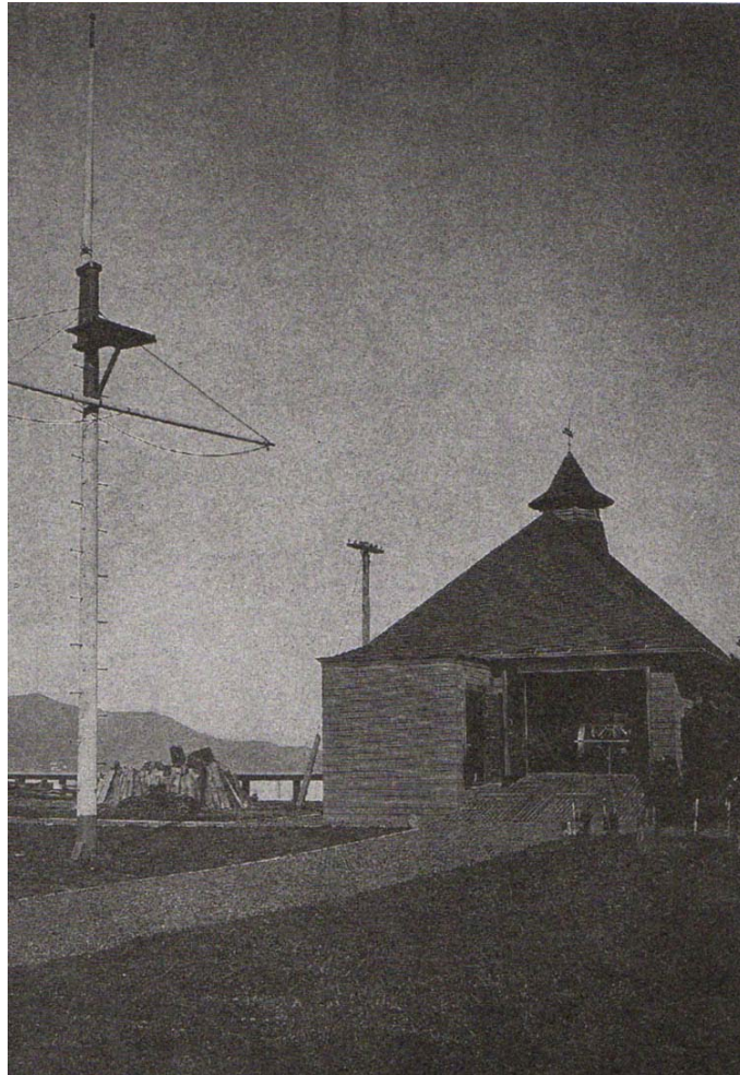
History figure 3. Photograph of the boathouse (bldg. PE 1902) from about 1900, looking north. Note the beach apparatus wagon just inside the open door. The winch room is just to the left of it. [16]

Two wreck poles were also installed at the original facility, though they do not appear until after 1890. The larger of the two stood on the beach just seaward of the keeper's quarters. It was at least 30-feet high and replicated a fully-rigged ship's mast, including three yards, a gaff boom, crosstree and stays. The complexity of this pole exceeded LSS regulations. It was probably used as a flagpole and signal staff as well (no other flagpole appears during this period). The other wreck pole was much simpler. It stood no more than 20 feet in height and included a single yard with stays and a small platform. It was located just south of the boathouse at one end of the grassy field separating the two buildings. The Fort Point facility also included a storeroom, 16 by 24 feet in dimension, and a lamp room, 16 by 16 feet in dimension. Both of these outbuildings stood east of the main building (keeper's quarters). On the west side of the boathouse was a wooden water tank which was elevated on a short tower.