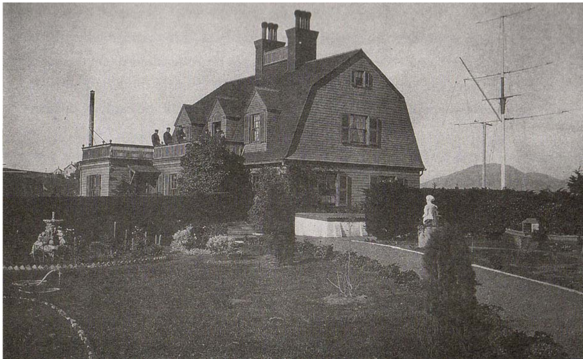
History figure 2. Photograph of the Keeper's Quarters (bldg. PE 1902) from about 1900. Note the established vegetation and garden ornaments. A hose bib is also visible, indicating the existence of an underground water main. [12]

The original boathouse stood west of the keeper's quarters approximately 200-feet. It measured 24 by 40 feet. Like the keeper's quarters, it was clad in rough shingle and painted a neutral red. Its steep, hipped roof with decorative cupola remains largely unchanged, but the original building had large, barn-like