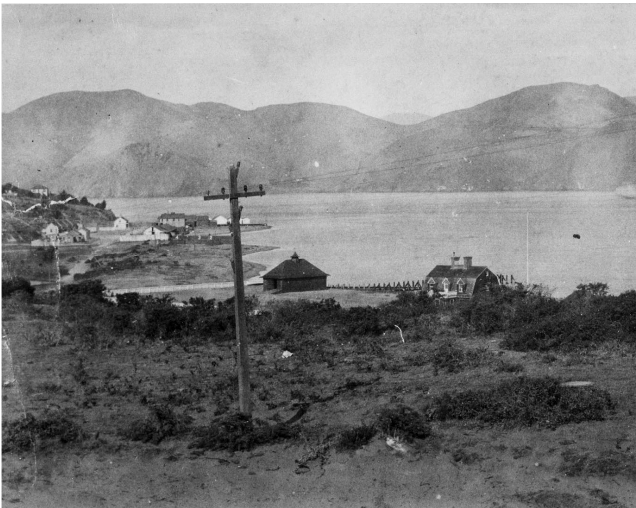
History figure 1. This photograph was taken shortly after the station was completed in 1890. The photographer is looking northwest toward the Golden Gate. [10]

the supply of specified materials, and broken contracts with subcontractors, so that the facility was not actually completed until February 14, 1890. The contract for a wooden fence to surround the property was bid out separately and completed in March of that year. It was extended into the surf with barbed wire seventy feet on either side. The fence had proven necessary in order to keep wandering livestock out of the facility. [9] A few months after the completion of the station, the Life-Saving Service requested permission from the Army to erect a lookout tower on Fort Point. This was necessary in order to provide comprehensive visual coverage of the mouth of San Francisco Bay, the outer part of which was obscured from the station by Fort Point itself. The Golden Gate Park Life-Saving Station on Ocean Beach already maintained a lookout on the bluffs above Point Lobos, as did the Mercantile Exchange. These facilities provided good visual coverage of the Gulf of the Farallones, but were not able to observe vessels inside the Golden Gate itself. The Army granted permission to the Life-Saving Service, even agreeing to provide a telephone line between the lookout and the Fort Point Lifeboat Station.