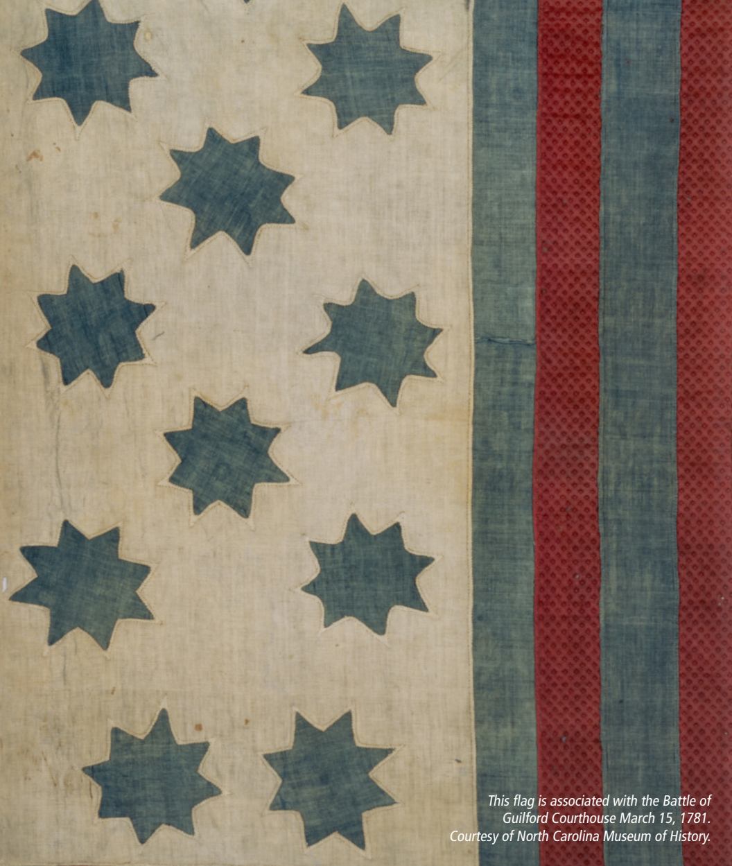
This flag is associated with the Battle of Guilford Courthouse March 15, 1781.