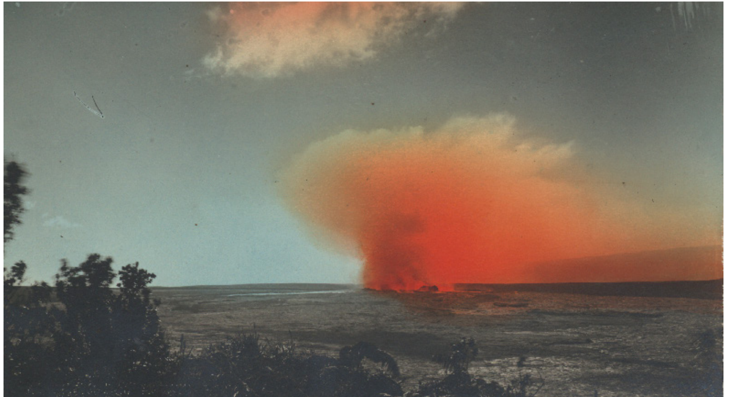
Image Right: Colored postcard depicting early 20th century eruption at Kīlauea.