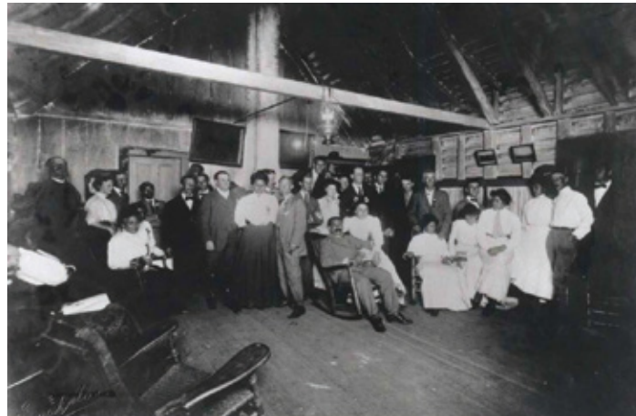
Photo Right: Congressional party on a visit to Kilauea in 1909.