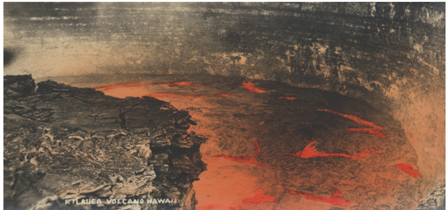
Photo Right: Kīlauea Volcano prior to 1924.