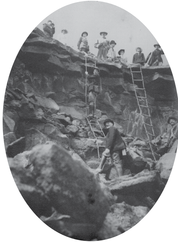
Photo Right: A party of visitors climbing the walls of Halema'uma'u by ladder in 1917. Print No. 170107-HA.

ate funding to create the park,” and finally they advised he “add in any other land areas of interest” because it would be easiest to add it now then include land in the future. On the final piece of advice, Jaggar added the summit of Haleakalā (Haleakalā Section) on Maui Island and a strip of land connecting the Mauna Loa and Kīlauea Sections. The original bill was withdrawn and re-written to model the Rocky Mountain National Park bill which had passed Congress in 1915. 57