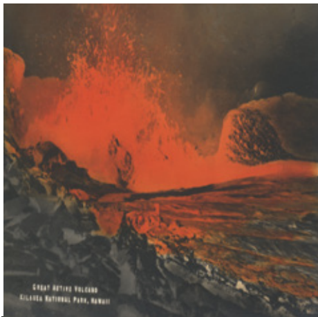
Photo Bottom: Colored postcard depicting 1921 Halemaumau eruption.

After he left his government position Thurston became much more involved in Kīlauea and the business ventures that were possible at this great attraction. His first project was to organize the Kīlauea Volcano House Company in 1891. He purchased some leases of the Volcano House from Samuel G. Wilder, head of Wilder's Steamship Co. and a new lease was also purchased from the owner – the Bishop Estate. 30 The Volcano House Company, made up of several investors, also acquired the hotel at Punalu'u. The company remodeled the Volcano House and made additions so that “it was much more commodious and attractive.” 31 Having interest in the only accommodations available in the Volcano area at that time, insured that Thurston (a shrewd businessman) would directly benefit from all visitations to Kīlauea. Next, in cooperation with the O'ahu Railway and Land Company, the Volcano