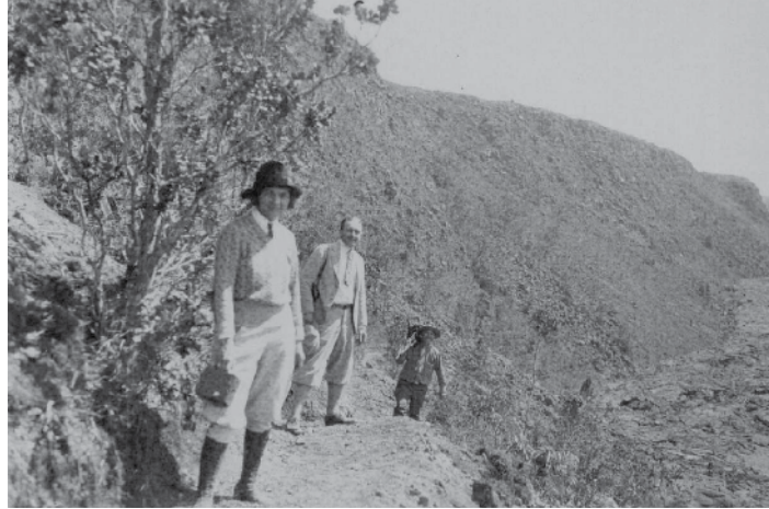
Photo Right: The “World’s Weirdest Walk.” Visitors on a trail to Kīlauea at Halema‘uma‘u.