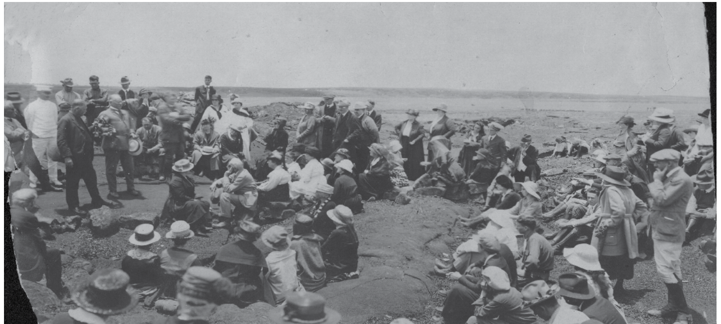
Photo Right: Dedication ceremony for Hawaii National Park on the rim of Kilauea, July 9, 1921.

14 William Ellis, Journal of William Ellis. Narrative of a Tour of Hawaii, or Owyhee ; With Remarks on the History, Traditions, Manners, Customs and Language of the Inhabitants of the Sandwich Islands , (Advertiser Publishing Company,