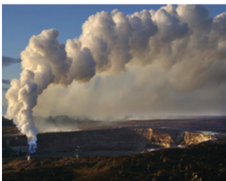
The many faces of Halemaumau. Top Photo: Jaggars Lake, 1919; Middle Photo: Kīlauea Military Camp in 1923; Bottom Photo: Halema‘uma‘u degassing, 2008.