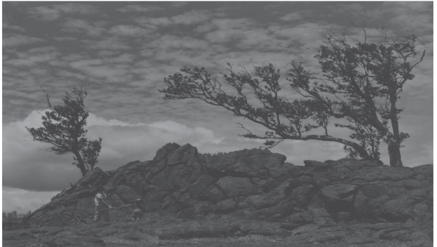
Photo Right: The Ka'u Desert.

A distinct change in the kind of visitor to Kīlauea is noted in the late 1840s. Prior to 1845 people visited the area primarily for scientific or exploration purposes. After 1845, there is a sharp increase in casual and pleasure visits especially by Americans. The rise of visitors to Hawai'i from the United States who were interested in exploration and travel coincides with a period of reconnaissance and expansion in America between 1835 and 1850. This expansion was made possible in part by a transportation revolution that was occurring across the United States. New canals, railroads and better wagon trails facilitated travel by the American public. It was also a time when the US Government charged the Army to explore the West and gather information on natural resources. Kīlauea was very active during this time, thus, Hawai'i, and in particular Kīlauea, was a curiosity and natural draw to Americans during this period.