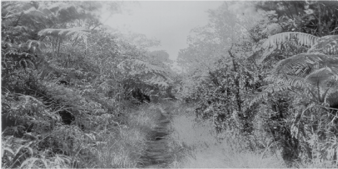
Photo Top: Trail leading through native rainforest at Hawaii National Park.

In 1916, the United States Congress established the National Park Service. The Service was formed to “promote and regulate the use of the national parks... which purpose is to conserve the scenery and the natural and historic objects and wildlife therein and to provide for the enjoyment of the same in such a manner and by such means as will leave them unimpaired for the enjoyment of future generations.” 3 Prior to the creation of the Service, several large tracts of land across the United States had already been set aside for special use and protection. 4 Yellowstone, for example, was established in 1872 as the nation’s first “national park,” yet it was managed for 44 years before the agency which was to manage all national parks was even created. Yellowstone thus established a precedent for preserving large land areas for “non-consumptive use” where “unrestricted free enterprise and exploitation of natural resources (was) prohibited.” 5