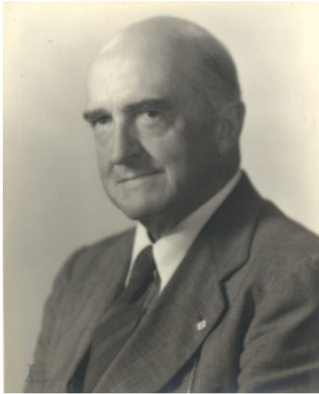
Photo Top: Thomas Jaggar.

director. 48 As part of his campaign, in 1911 Thurston formed the Hawaiian Volcano Research Association (HVRA) which continued to further the cause of both a national park and an observatory.