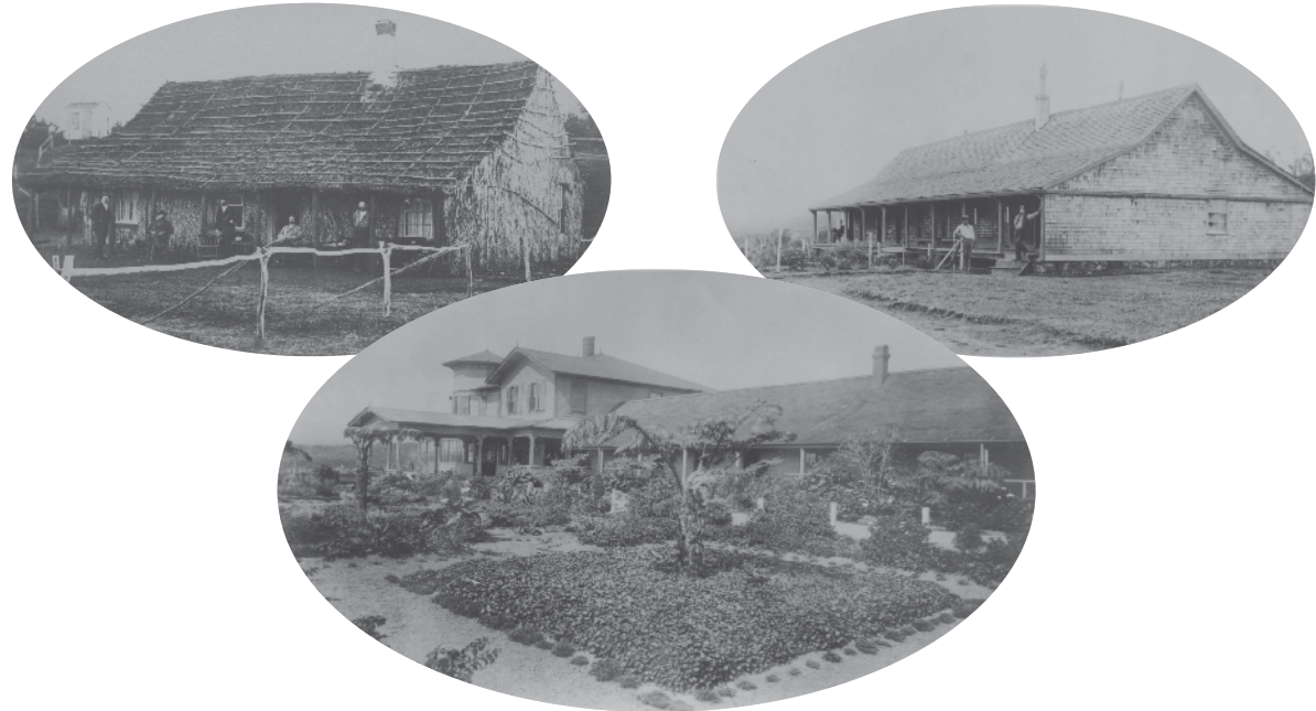
Photo Bottom: Volcano House front garden, 1891-1905. Note that a portion of the original 1877 Volcano House is depicted in this photograph (structure on right side of print).

Over time, as the popularity and interest in Kīlauea increased, it too experienced a transformation of its infrastructure. The ability to access the Volcano was facilitated by the opening of new sea ports of entry, the improvement of trails and the establishment of new lodging areas. As the infrastructure grew, so did the interest in the scientific study of the volcano as well as general tourism.