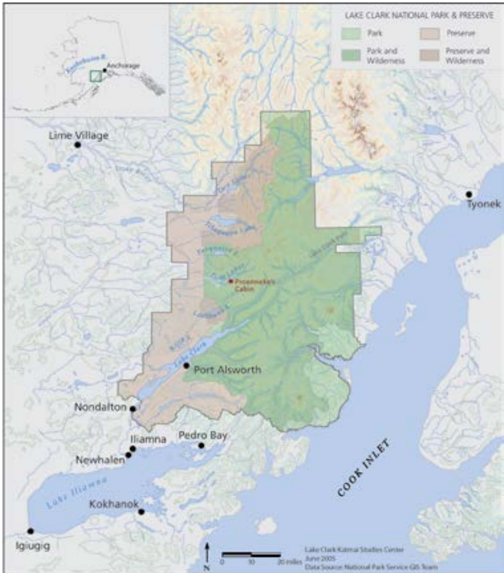
Lake Clark National Park and Preserve, and environs