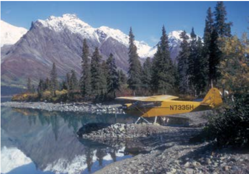
The Proenneke brother's J3-Piper Cub, the "Arctic Tern," on floats at Proenneke's in 1975 or 1976 Page 221