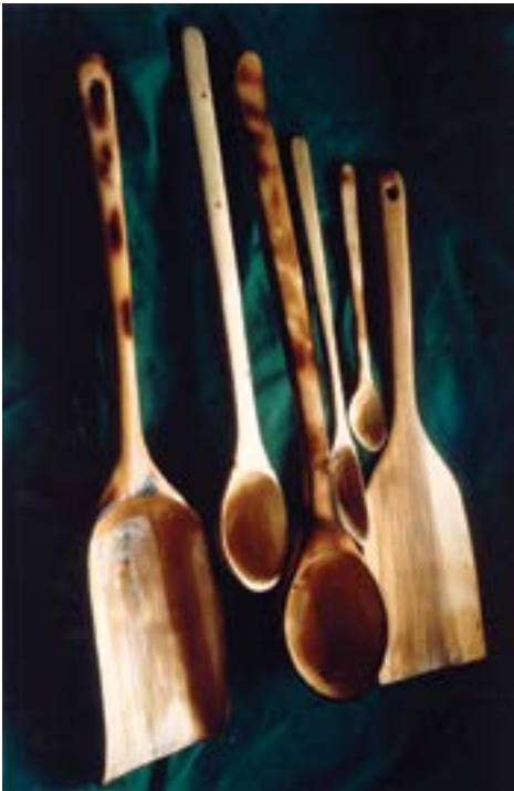
Woodenware carved by RLP