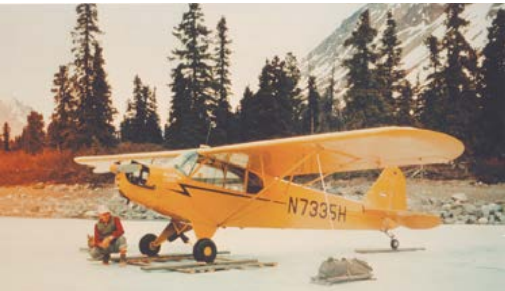
Below: RLP kneels in front of the J3-Piper Cub on the ice near his cabin in the spring of 1976 • Photo courtesy of Raymond Proenneke