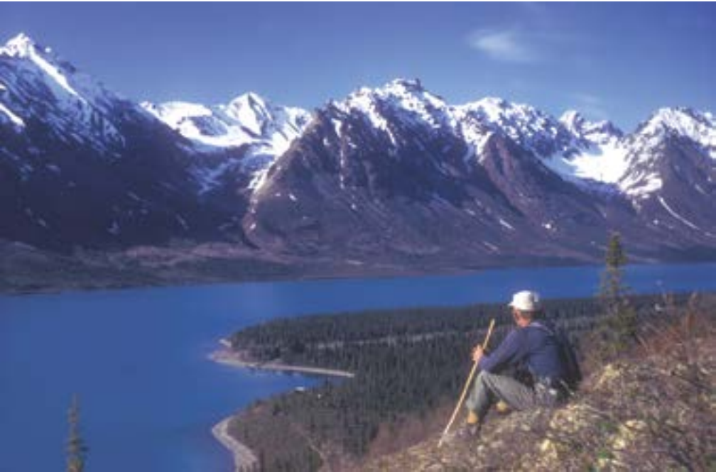
RLP overlooking Carrithers' point with Allen Mt., Spike's Peak, Glacier Creek, Bell Mt., and Bell Creek in the background