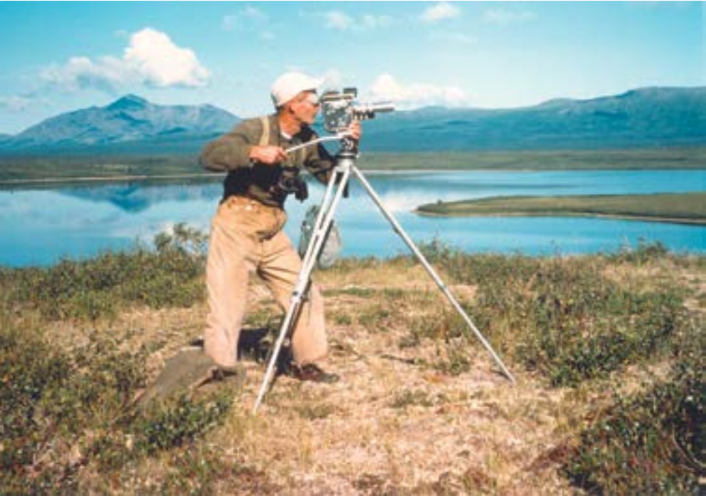
RLP filming at Snipe Lake 1975