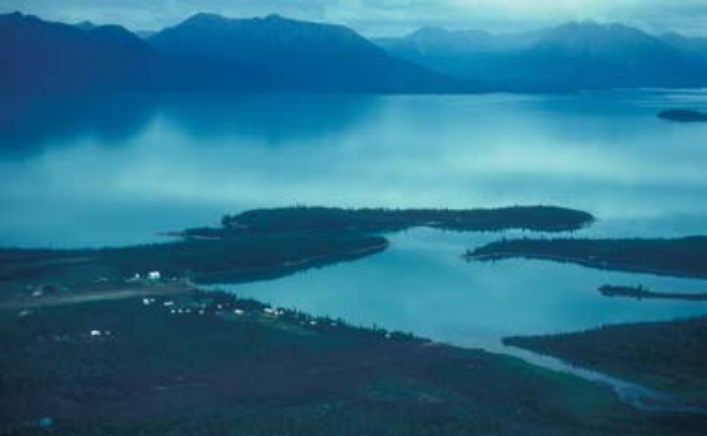
An aerial view of Port Alsworth looking north across Lake Clark toward Kijik Mountain, center background, with Bee Alsworth's new landing strip under construction in the center foreground