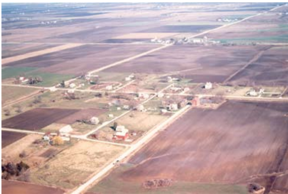
Aerial view of the Proenneke hometown of Primrose, Iowa in 1975