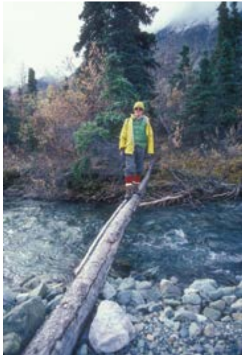
A hiker crosses Proenneke's Hope Creek bridge in 1982