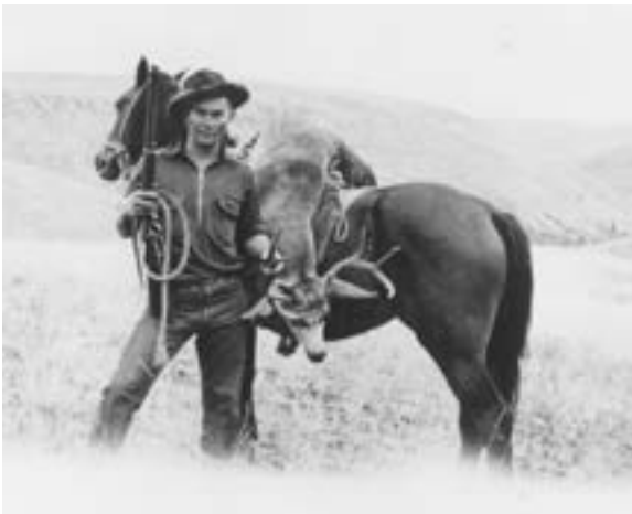
Richard Proenneke near Heppner, Oregon circa 1940