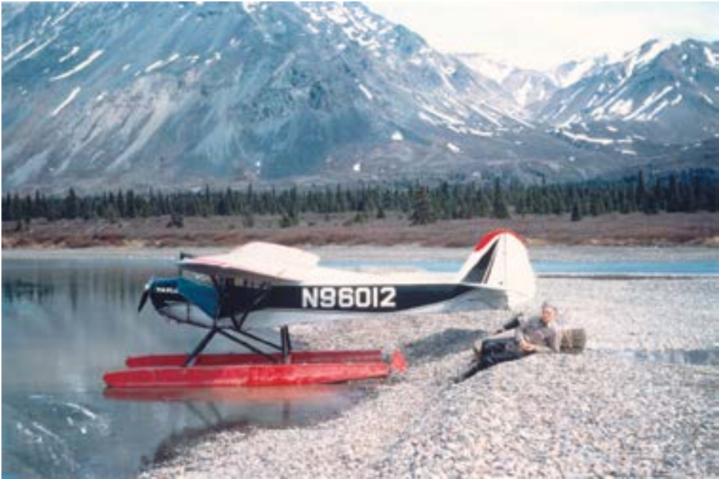
Babe Alsworth at lower Twin Lakes with his "T-craft" in 1968