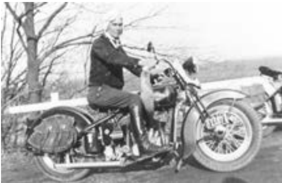
Richard Proenneke on a Harley Davidson motorcycle in Iowa in the mid-1930s