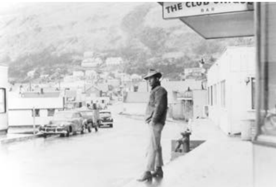
Richard Proenneke in Kodiak, Alaska circa 1950