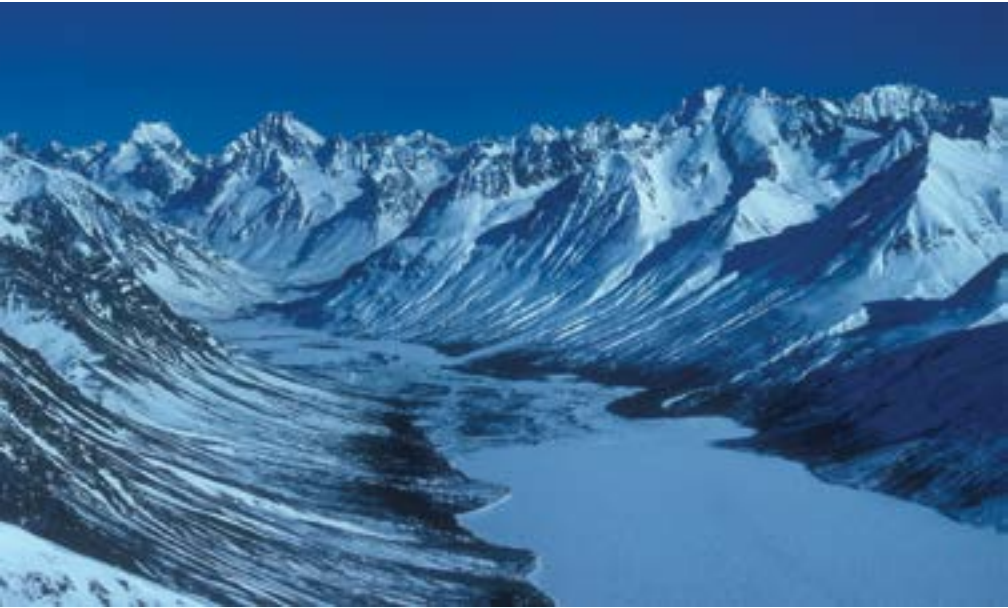
The upper reaches of upper Twin Lakes