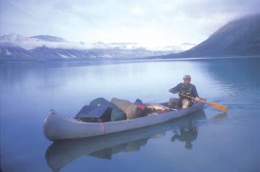
RLP in his loaded canoe 1991