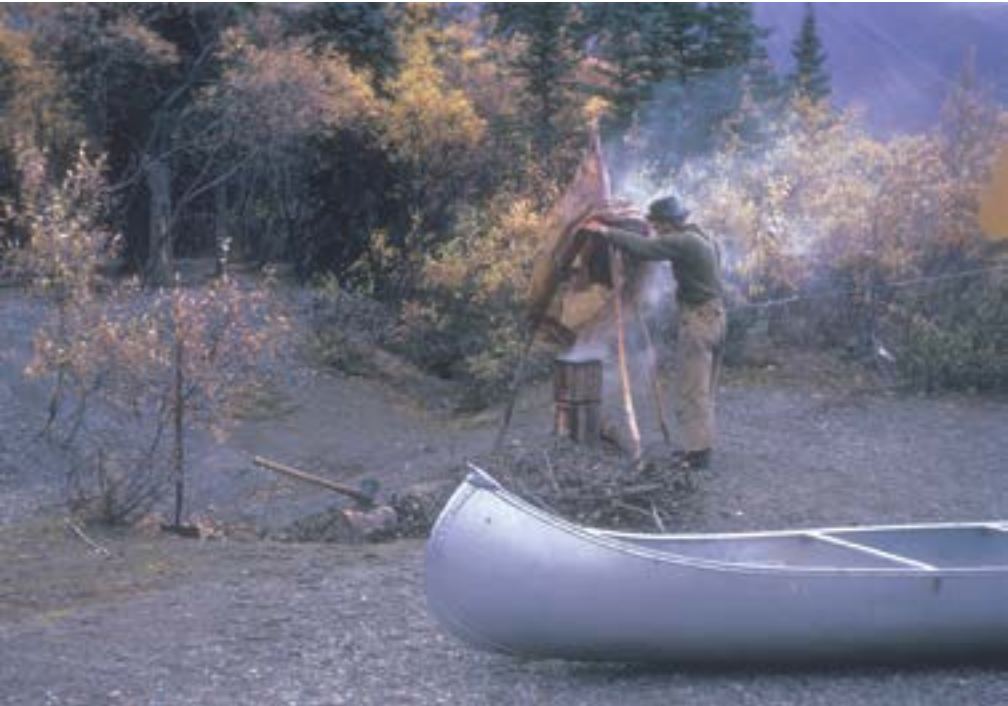
RLP smokes meat on the beach near his cabin circa 1976