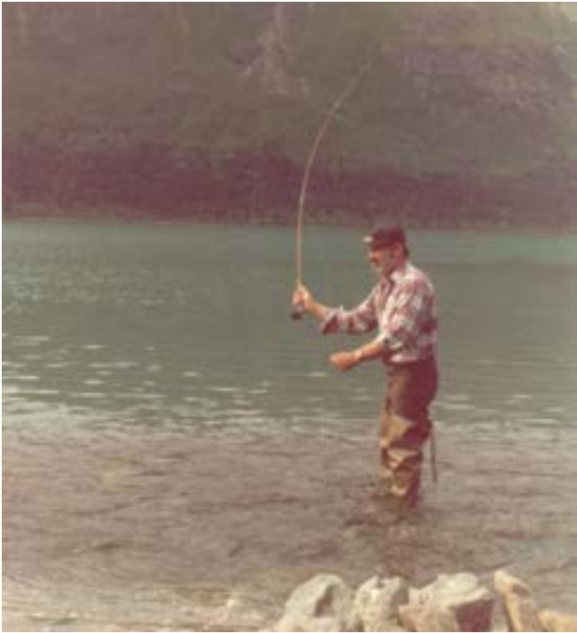
Governor Jay Hammond fishing at the mouth of Hope Creek circa 1980