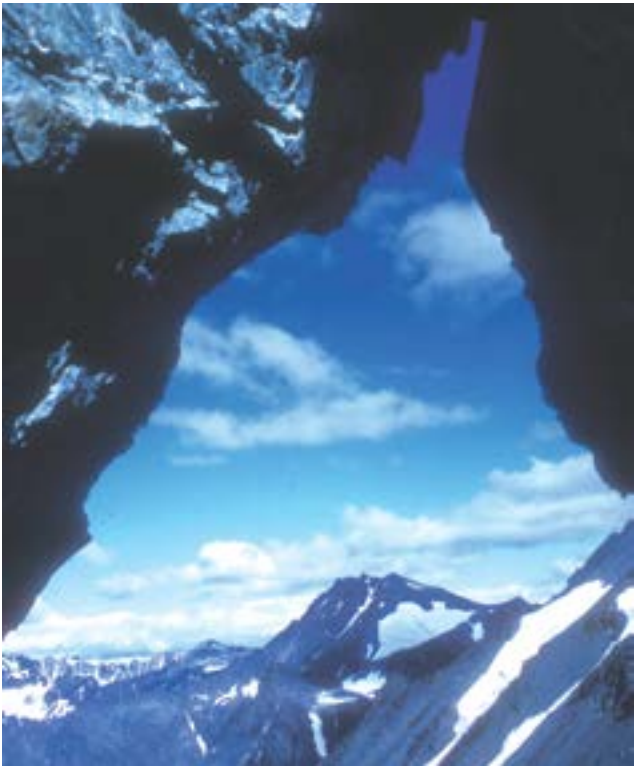
Proenneke's "eye of the needle" arch near Low Pass