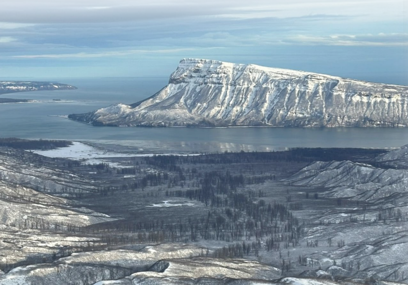
Left: View of Tuxedni Channel and Chisik Island from Bear Valley.