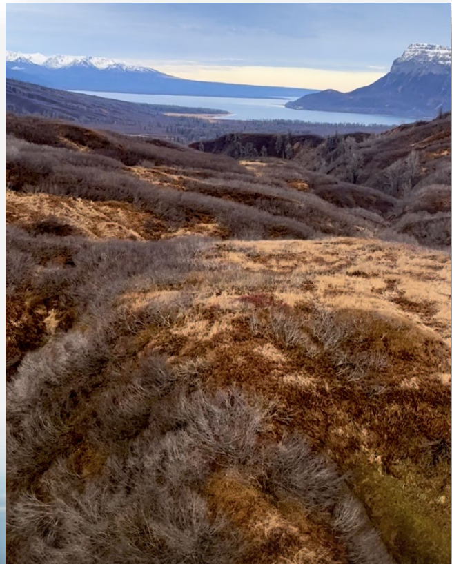
Above: View of Tuxedni Bay and Channel from Bear Valley.