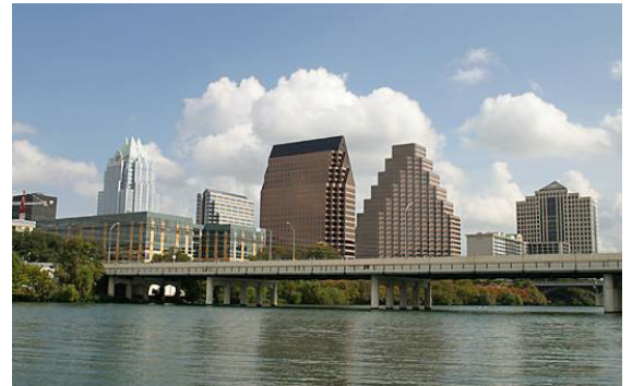
Colorado River, Austin, Texas