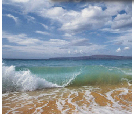
Padre Island National Seashore