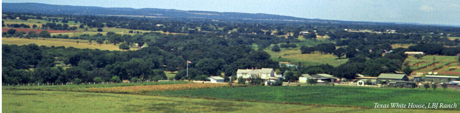
Texas White House, LBJ Ranch

We see that there is another course...Down this course lies a natural America restored to her people. The promise is clear rivers, tall forests, and clear air—a sane environment for man.