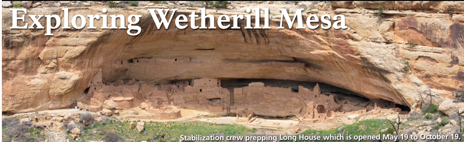
Stabilization crew prepping Long House which is opened May 19 to October 19.