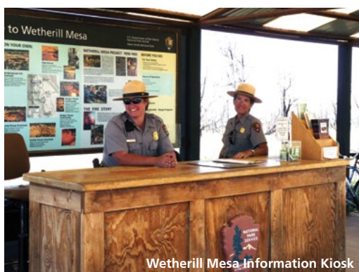
Wetherill Mesa Information Kiosk

The Wetherill Mesa Information Kiosk is located near the parking area at the end of the Wetherill Mesa Road. Rangers are available to help you plan your visit. The paved Long House Loop begins at the kiosk and leads to several paved and unpaved trails you can hike or bicycle. See inside for details.