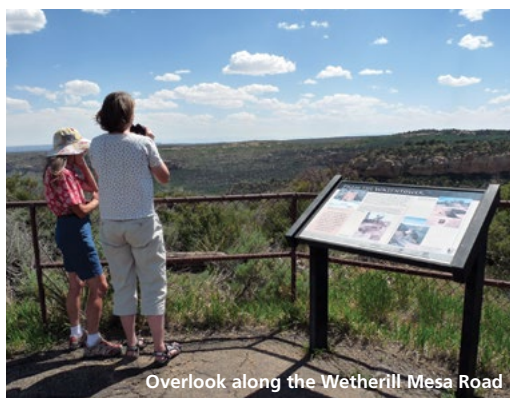
Overlook along the Wetherill Mesa Road

The Wetherill Mesa Road begins at milepost 15 along the main park road in the Far View Area. The 12-mile (19 km) road is narrow, steep, and winding, offering spectacular views of the surrounding valleys. It is not suitable for large RVs or bicycles. Vehicles must be less than 25 feet long to drive this road. Vehicles over 8,000 lbs GVW are prohibited. Allow about 45 minutes to drive the Wetherill Mesa Road. There are several overlooks and pullouts available for slower traffic to use so others may pass.