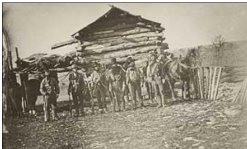
Armed Lawrence settlers.

attack on Massachusetts Senator Charles Sumner the following day. 22 Northern newspapers issued a rallying cry for a violent response. Ruffians “must be crushed by the same spirit and the same power that broke the rule of the tyrants of ’76.” 23 Some writers connected the North’s “virtual slavery” to its “feeble manhood” and called for a more militaristic defense. 24