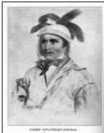
Opothleyahola.

About the same time, in winter 1861, Muskogee leader Chief Opothleyahola fled from Oklahoma into southern Kansas to escape pro-Confederate Cherokees led by Stand Watie. Opothleyahola's followers numbered 9000 Union loyalists, including hundreds of escaped slaves and free blacks. Their desperate winter time escape, pursued by Native American Confederates, resulted in three major battles and the loss of nearly a third of the fleeing Indians and many of