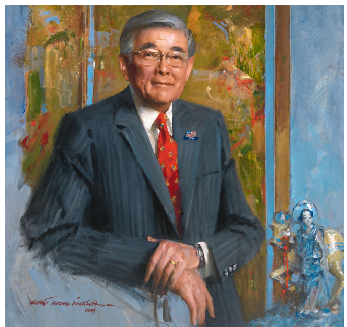
Norman Y. Mineta (1931–2022).

Following these legislative requirements, the National Park Service cannot provide a blanket waiver of the non-Federal match for all JACE grants as these factors will be different for each individual organization and each proposed project. Applicants can submit a written request for a waiver of the non-Federal match as part of their application package, which will be reviewed by the Secretary. Additional details on this process will be included in the NOFO.