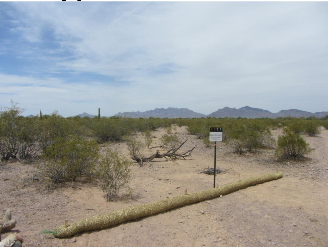
SOVA-2014-0002AE_010_20150512 – Post vertical and horizontal mulching