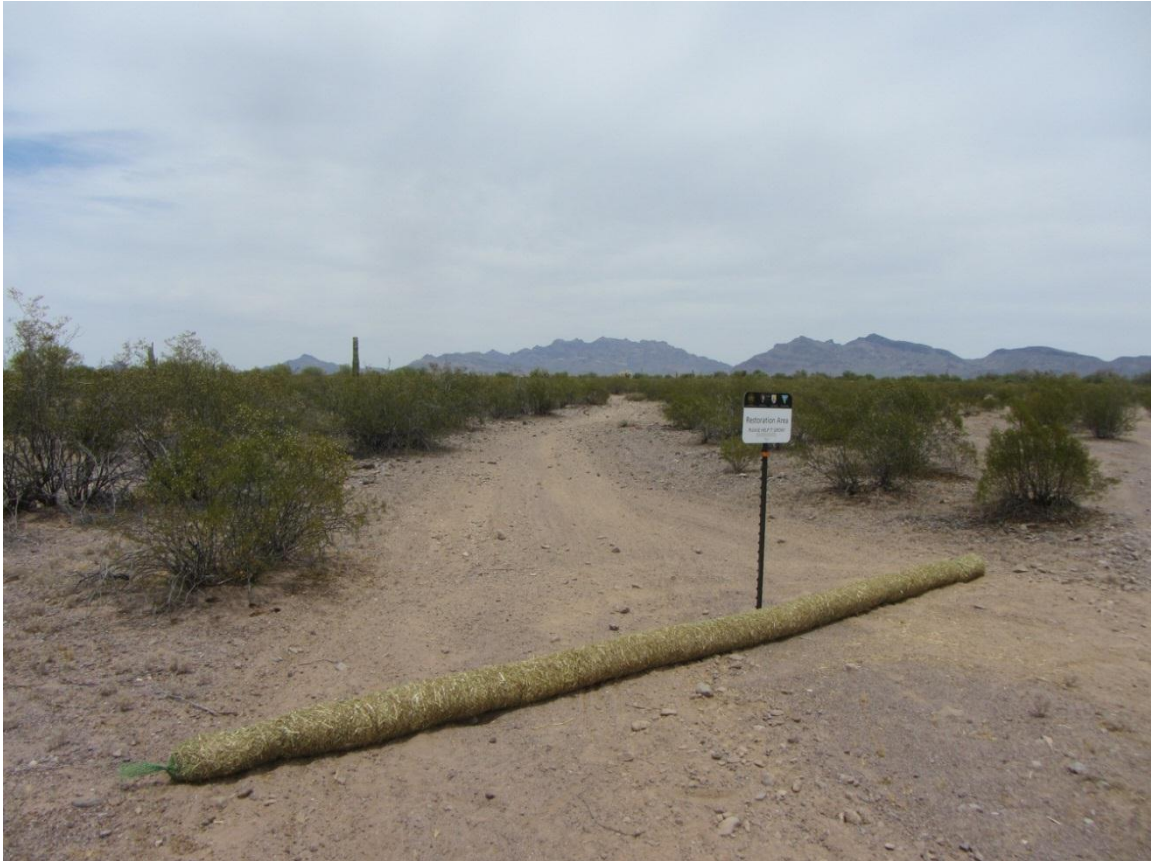
SOVA-2014-0002AE_010_20150512 – Post mechanical treatment