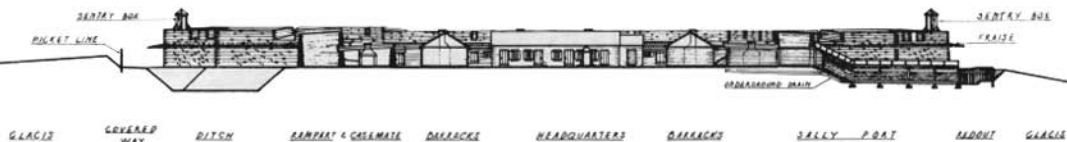
WEST - EAST PROFILE