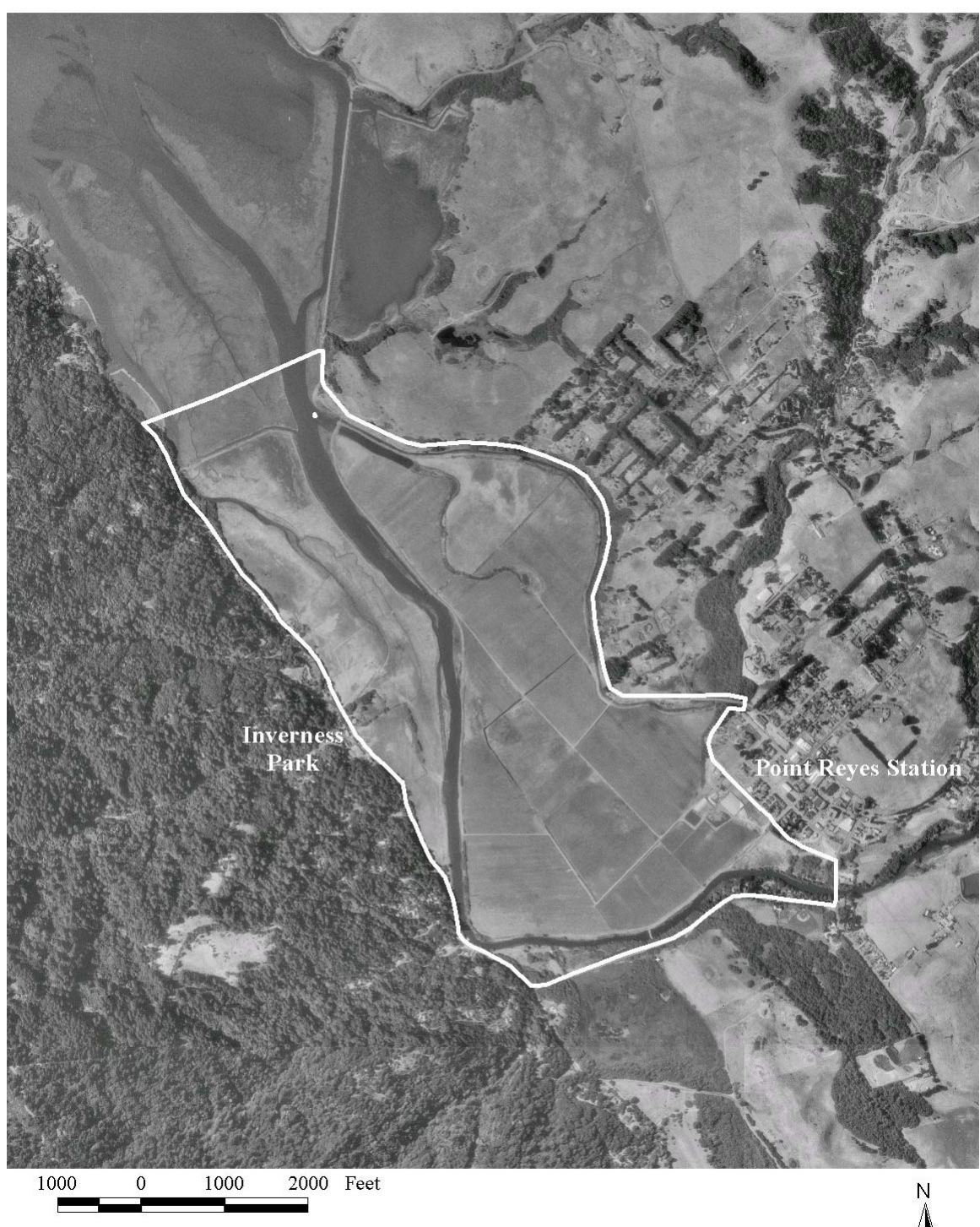
Figure 1. Giacomini Wetland Restoration Project Study Area. Marin County, California.