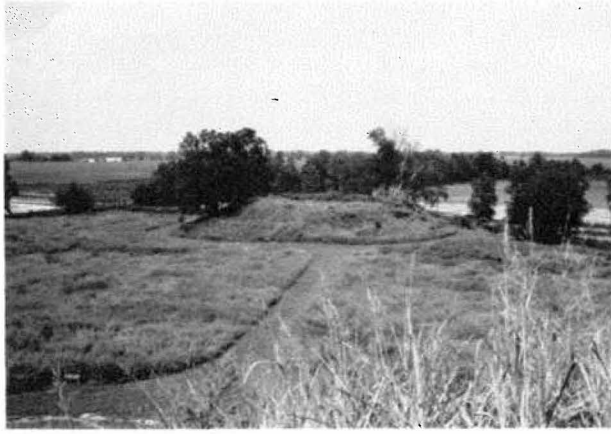
Figure 2. Winterville Mounds in Mississippi with a dense growth of Johnson grass (Shorghum halepense) used for stabilization and traffic routing.

amount of additional site loss can be predicted before the plantings reach their maximum protection potential.