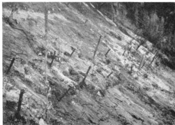
Figure 3. Willow cuttings immediately after sprigging, Lake Britton, Shasta County, CA.

While not directly a concern for stabilization projects, care must be exercised to protect against the introduction of species that might ultimately become weeds. The best approach to a revegetation program is to try to select species that are native to the vicinity of the stabilization project. If a non-native or commercially supplied species