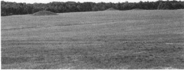
Figure 1. Pharr Mounds, Natchez Trace Parkway, MS, stabilized with native grasses.

The types of water-generated erosion that are most frequently mentioned as impacting archeological deposits are sheet erosion and stream channel erosion. In many areas, lacustrine erosion of sites has a greater impact on archeological materials than channel erosion, but a one-to-one comparison is not possible since two very different kinds of forces are operating to remove the cultural deposit.