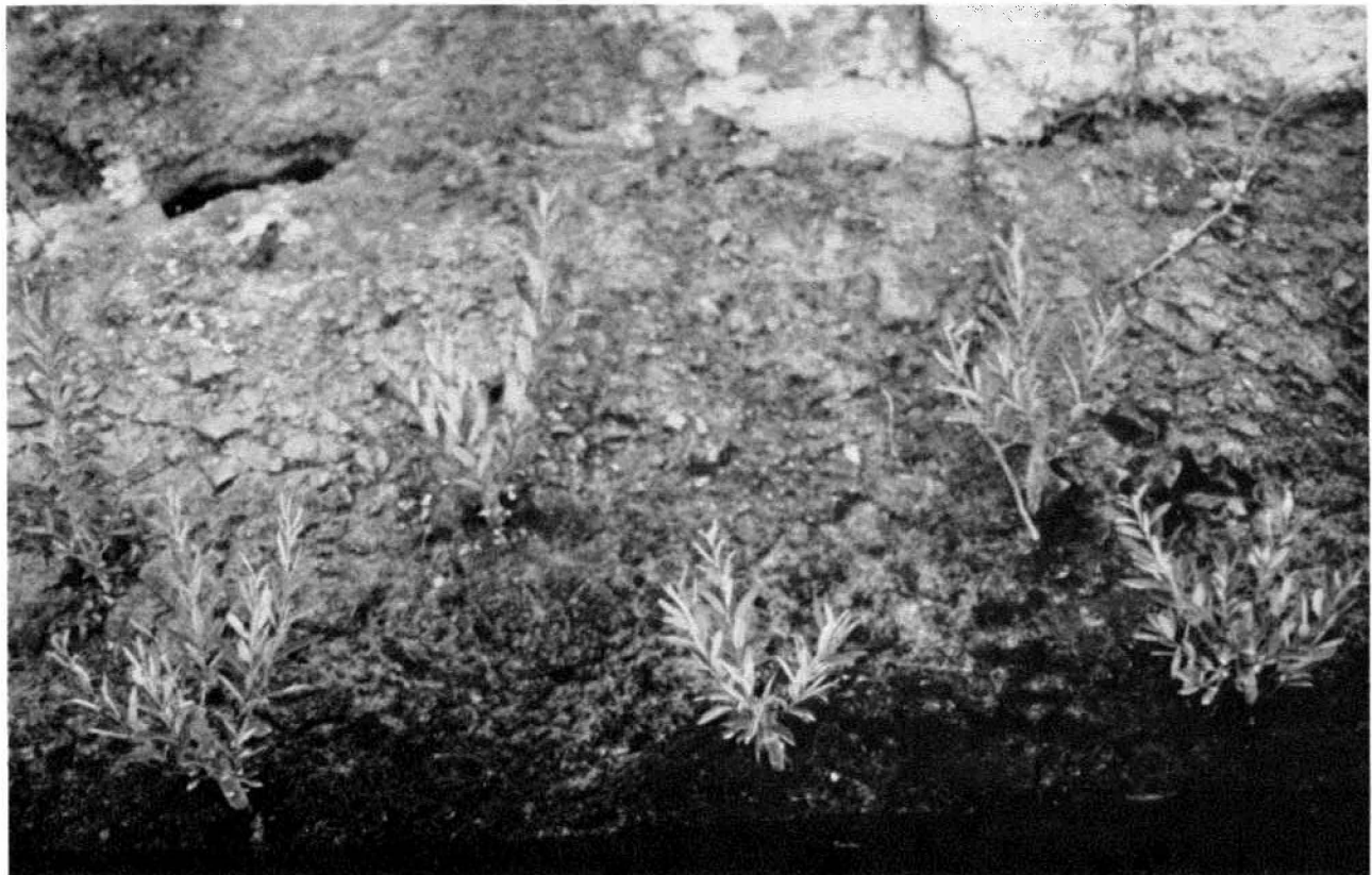
Figure 4. Willow cuttings 12 months after sprigging, Lake Britton, Shasta County, CA.

Stabilization projects that employ revegetation as the primary technique can provide one of the most cost-effective means of site protection available. This is true not only for initial installation but for long-term maintenance as well.