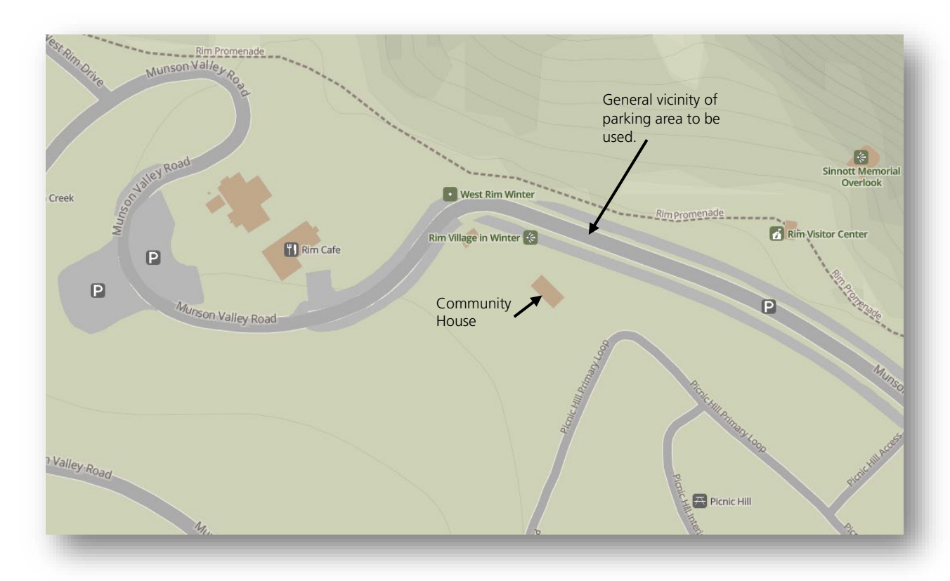
Exhibit 8. Location of Parking Spaces Adjacent to the Community House at Rim Village

The Concessioner must use vehicles no longer than 32 feet and no wider than 8.5 feet. All Concessioner vehicles used in the operation will be of the quality and condition to provide safe and comfortable transportation services and meet all Federal and State requirements for the type of service provided and will meet or exceed ADA Accessibility Guidelines. Under the Draft Contract, the Concessioner will base its operations outside the Area for vehicle storage, refueling, maintenance facilities, and employee housing (if necessary). The Service will assign for the Concessioner's sole use, 12 parking spaces adjacent to the Community House at Rim Village, as indicated in the diagram below. The Concessioner must provide its own personal property kiosk or other mobile/temporary structure to sell tour tickets within the Area. During the operating season, the mobile/temporary kiosk may only be located within the parking spots as identified below and must be removed after each operating season.