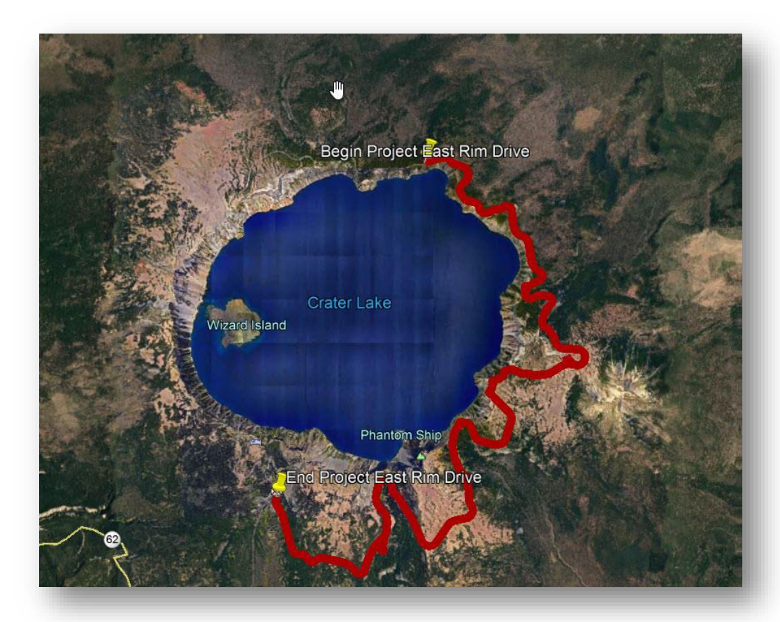
Exhibit 11. East Rim Drive Construction

In recent years, the Park has been investing in improvements to Rim Drive in partnership with the Federal Highway Administration. West Rim Drive and 4.5 miles of East Rim Drive were rehabilitated in 2015 – 2017. Work on the remaining section of East Rim Drive began in 2023 and is expected to conclude by the end of 2025. The project will rehabilitate pavement on East Rim Drive to include all turnouts, paved walkways, and viewpoints. Once completed, East Rim Drive's narrow, wavy, pot-holed, and rockfall-damaged pavement will be improved to a smooth and stable road surface. It will also apply modern safety standards for sightlines, curvature, and elevation changes, that will be balanced with preservation the historic integrity of the roadway, resulting in a safer and more pleasant driving experience. Impacts to Guided Land Tour operations during construction should be minor. The construction contract requires that the Concessioner be allowed to pass through construction zones with no more than a 30-minute delay. Additionally, the Concessioner may choose to alter its tour routes, conducting an out-and-back tour as an example, to avoid any delays related to the pending construction.