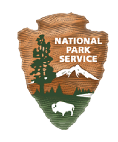
EXPERIENCE YOUR AMERICA™