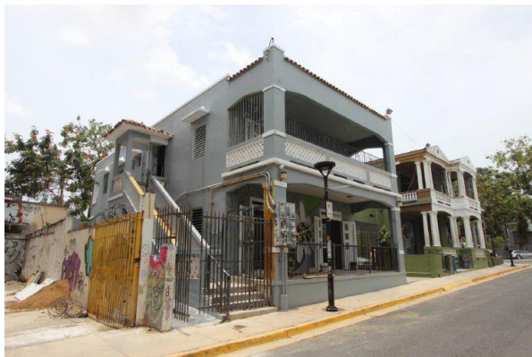
Figure 12: The Edificio Comunidad de Orgullo Gay de Puerto Rico (Casa Orgullo), at 3 Saldaña Street, San Juan, Puerto Rico, was the home of the Comunidad de Orgullo Gay de Puerto Rico. Inspired by the Stonewall Riots in New York City, the group was founded in 1974, and was Puerto Rico’s first gay liberation organization. They occupied this building from 1975 to 1976. Casa Orgullo was listed on the NRHP on May 1, 2016.

Denied participation, activists were successful in drawing attention to gay realities in Puerto Rican communities, a move that one scholar believes presaged later battles over St. Patrick’s Day Parades which ended in the United States Supreme Court. 64