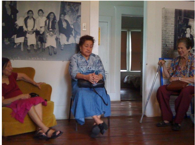
Figure 15: Women sharing their stories of San Antonio at the Esperanza Peace & Justice Center, 2010. 78