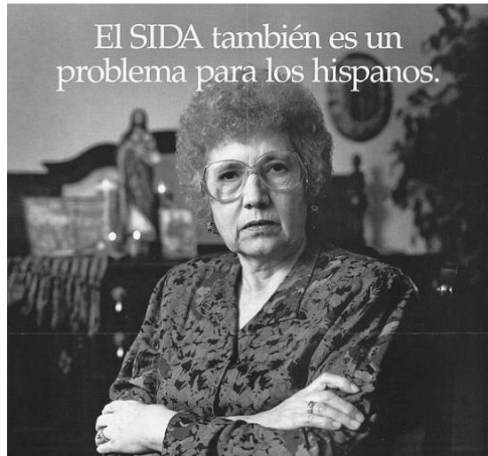
Figure 8: “El SIDA también es un problema para los hispanos” (AIDS is a problem for Hispanics too), from the US Centers for Disease Control’s America Responds to AIDS campaign, circa 1990–1994. A translation of the text (from the English version of the poster) reads, in part, “It’s difficult for our families to talk about drugs and AIDS. And it is not our nature to openly discuss issues like teen sex, homosexuality and bisexuality. We were brought up with traditional values. Even among our immediate family we don’t talk...we want to, but it’s just not that easy. AIDS is serious. We need to talk about it openly.” Several Latino/a community-based health organizations emerged during the AIDS crisis, including Community United in Responding to AIDS/SIDA (CURAS) and Proyecto ContraSIDA por Vida (which operated from 1993 to 2005), who worked to reduce the spread of HIV in communities of color. Known for their innovative community engagement, the mission statement of Proyecto ContraSIDA por Vida (PCPV) read: “Proyecto ContraSIDA is coming to you—you joto, you macha, you vestigial, you queer, you femme, you girls and boys and boygirls and girlboys de ambiente, con la fé and fearlessness that we can combat AIDS, determine our own destinos, and love ourselves and each other con dignidad, humor, y lujuria.” This mission statement embraces many different sexualities and genders, and PCPV worked with transgender people for ten years before the organization shut its doors due to lack of funding. In 2006, several of those who had been involved with PCPV created El/La Para TransLatinas to continue HIV outreach, community services, and advocacy for transgender Latinas. Both PCPV and El/La Para TransLatinas had offices at 2940 Sixteenth Street, San Francisco, California. 48

“flamboyance,” while others were proudly flamboyant. Most gay and lesbian politicians and social activists argued strenuously for the inclusion of all sexual expression, no matter how disdainful some would find them, citing First and Second Constitutional Amendments as rights given to any American citizen without regard for their sexuality. Others also used “queer” to formulate artistic,