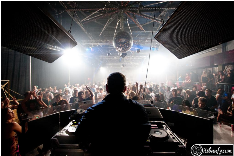
Figure 7: The interior of the Circus Disco, 6655 Santa Monica Boulevard, Los Angeles, California, August 2011. Circus Disco was opened in 1975 as a place for gay Latinos. Like African Americans, Latinos were discriminated against by many in the white LGBTQ community. They were discriminated against at white gay clubs in the area by bouncers who required multiple forms of identification from people of color, while white patrons only had to show one form of ID. Not just a social venue, Circus Disco played an important role as a place of community development and political organizing: in 1983, César Chávez addressed approximately one hundred members of the Project Just Business LGBTQ coalition at the bar. In his address, he discussed strategies for coalition fundraising and organizing boycotts. Circus Disco closed in January 2016. Slated for demolition, the developer has agreed to preserve several historic elements of the club. 46

cultural, social, and sexual activism intertwined with radical economic and demographic changes to underscore gay rights issues (Figure 7). The general influence of queer Latinas/os became more prominent during the 1980s and 1990s and visibility and representation posed less of a challenge. During these decades, the marginalized role queer Latinos played within some of the larger LGBTQ political movements continued to permeate issues and organizations. Several pivotal and historical factors contributed to the emergence and visibility of Latinas/o queers. In these early decades, the plight of AIDS and Latina feminism transformed the