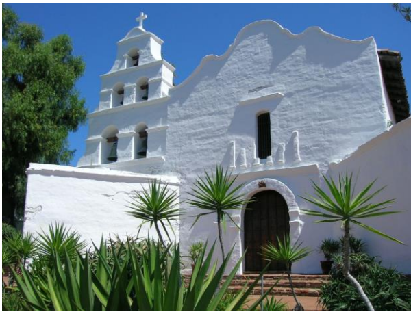
Figure 3: Mission San Diego de Alcalá, 10818 San Diego Mission Road, San Diego, California. Founded in 1769 by Spanish friar Junipero Serra, it was the first Franciscan mission in The Californias, a province of New Spain. The Native American Kumeyaay, who lived in the area, called the two-spirit members of their society Warharmi. 15

Naturally, people began to assume heterosexuality not only as the “natural” order of things, but as the only one. It would become clear through their actions that the church and state became more interested in regulating behaviors and associating morality with the regulation of sexual behaviors and were far less interested in heresy. The Inquisition in Spain did not actively pursue the persecution of sodomy as it would in the