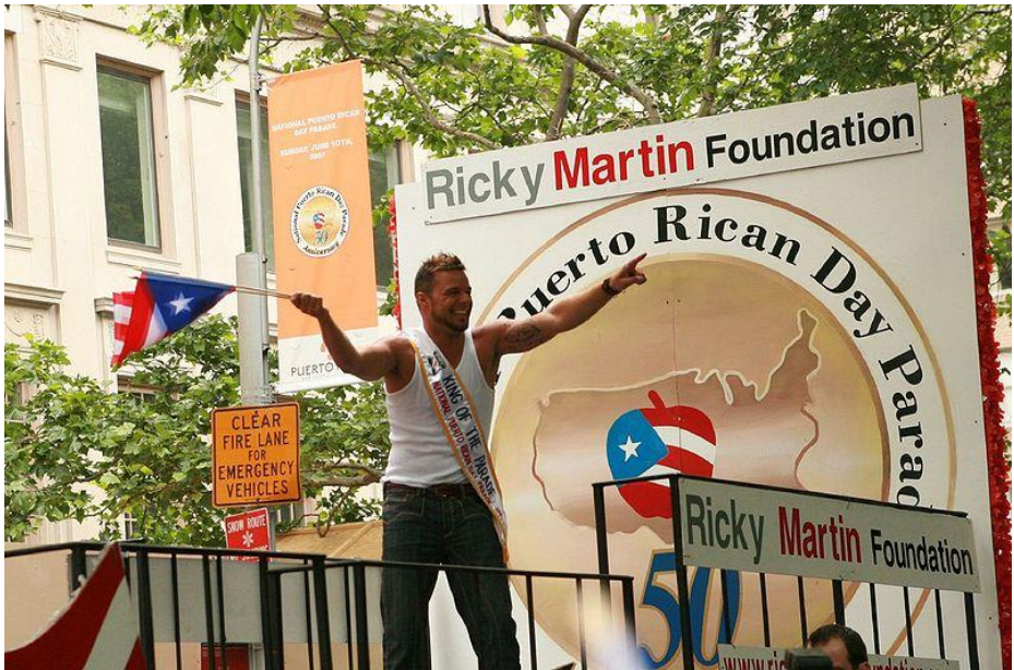
Figure 13: Long the subject of rumor about his sexuality, Puerto Rican superstar singer Ricky Martin came out on his website in 2010. He is the father of twin boys, who were born to a surrogate mother. This photo shows him in the 2007 National Puerto Rican Day Parade in New York City. 65