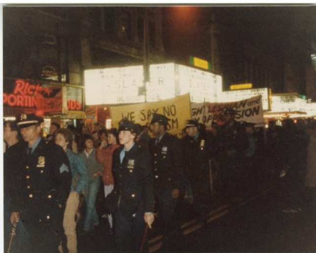
Figure 9: Police harassment of LGBTQ bars was not limited to the 1950s and 1960s. In October of 1982, a series of violent and homophobic police raids at Blue's, a historically black and Latino gay bar in Times Square, resulted in a protest by over eleven hundred people. No one was charged in the raids, which were part of a pattern of harassment of gays and people of color. Blue's was located at 264 West 43rd Street, New York City, New York.

Despite the Anglo, middle-class values of the earliest LGBTQ or Queer movements, some Latino activists clearly and cleverly resisted the assimilationist models that predominated a pre-civil rights era. In San Francisco, for example, José Sarria rejected the secrecy of the Mattachine Society and founded instead the League for Civil Education in 1960, which sought to educate queer and straight