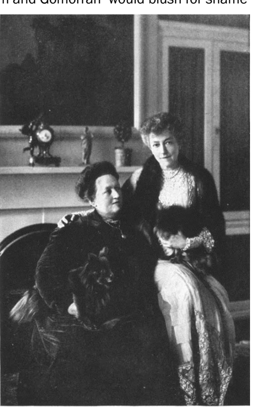
Figure 5: Elsie de Wolfe and Elisabeth Marbury.<sup>29</sup>

On the opposite side of the social spectrum were a number of LGBTQ individuals who operated within the spheres of upper New York society, politics, and culture. The Victorian lesbian power couple Elsie de Wolfe, often credited as America's first professional interior designer, and Elisabeth Marbury, one of the world's leading, and pioneering female, theatrical producers (Figure 5), lived in a house near Union Square between 1892 and 1911. They first met in 1887, and