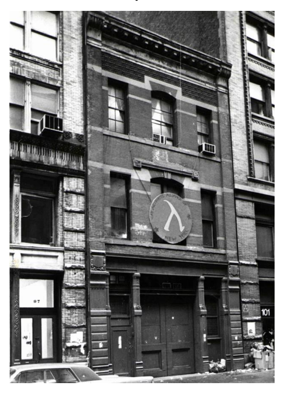
Figure 9: Gay Activists Alliance Firehouse, 99 Wooster Street, New York City, New York. Photo by John Barrington Bayley, circa 1972. Courtesy of the New York City Landmarks Preservation Commission.

In the immediate aftermath of Stonewall, one of the earliest organizations formed was the Gay Liberation Front (GLF). Though of brief duration, the Gay Community Center was located (c. 1970-1971) on West 3rd Street (formerly Tony Pastor's Downtown). GLF had Sunday meetings and dances here, and this was also the headquarters of Radicalesbians, spun off of the male-dominated GLF in 1970, and the meeting place of Gay Youth, for GLF members under the age of eighteen. A former firehouse in SoHo served as the headquarters of Gay Activists Alliance (GAA) (Figure 9) in 1971-1974. Formed in 1969 when a number of members broke away from the more radical GLF, GAA was primarily a