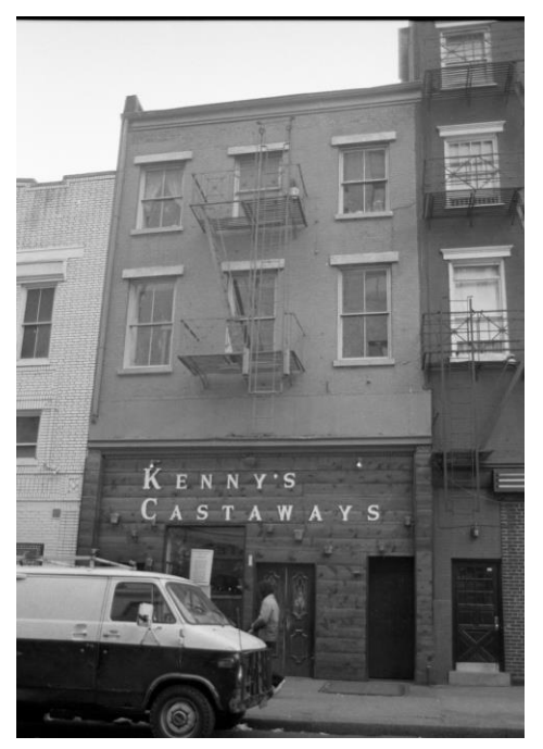
Figure 4: Former location of The Slide, 157 Bleecker Street, New York City, New York, 1980s.

space has been destroyed, the basement, along with the rest of the hotel, survives.<sup>23</sup>