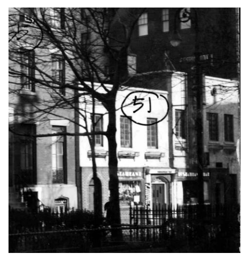
Figure 3: The Stonewall Inn, 51-53 Christopher Street, New York City, New York. Photo by John Barrington Bayley, circa 1965. Courtesy of the New York City Landmarks Preservation Commission.

in order to proceed, and the lack of precedence. Since there had never been any prior LGBTQ NHL historic context or theme study developed, the Department of the Interior deemed it impossible to determine the Stonewall's significance. Further, the successes of the gay rights movement were seen as too recent and too limited at that point; a street riot was questioned as the most worthy site for commemoration: Stonewall was not considered a defining moment or event for the LGBTO