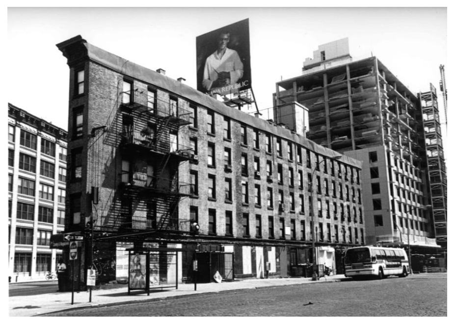
Figure 10: 669-685 Hudson Street building, New York City, New York, 2003.

Numerous LGBTQ notables in the arts have continued to reside and work in the Village. The Merce Cunningham Dance Studio, one of