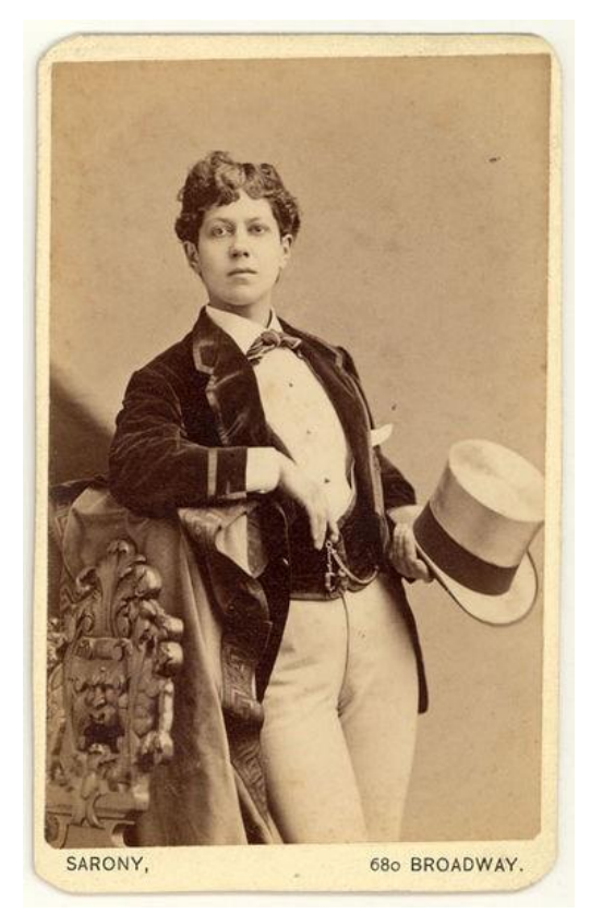
Figure 10: Male impersonator Ella Wesner gained fame in New York City's vaudeville and music-show circuits in the 1860s and 1870s where she appeared in male and female roles. Scandal erupted when she eloped to France with Josie Mansfield, a famous mistress of several wealthy New York business barons. Photo by Napoleon Sarony, ca. 1873, from the Library of Congress Prints and Photographs Division.<sup>129</sup>

mainstream leisure communities and cultures, LGBTQ individuals and communities formed their own places and forms of leisure and entertainment. LGBTQ contributions to mainstream and alternative literary, art, music, and performance cultures in particular are too numerous to be