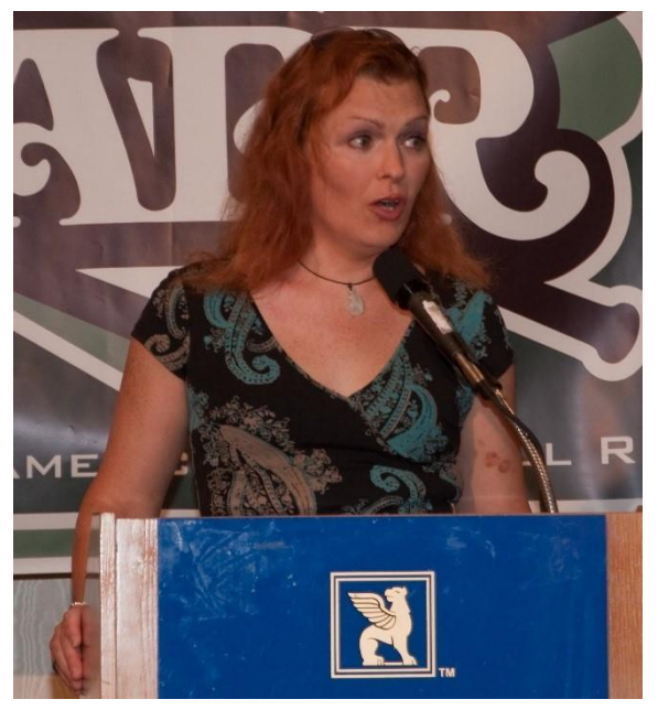
Figure 9: Sportswriter Christina Kahrl came out as transgender in 2003 and continues to be an important voice in baseball and other sports coverage on ESPN. Photo by The SABR Office, 2009.<sup>127</sup>

fewer social costs and greater rewards for their participants. They also reflect the ethos of many