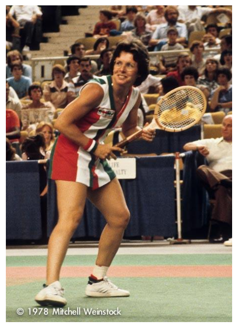
Figure 3: Tennis champion Billie Jean King playing in Phoenix, Arizona in 1978. In 1973, she beat male opponent Bobby Riggs in the famous "Battle of the Sexes" tennis match.<sup>33</sup>

Tennis' openly LGBTQ history rests predominantly on the women's side, and is tied to a series of players in the 1970s and early 1980s. Three matches in American tennis history have been dubbed the "Battle of the Sexes," but the most famous was the exhibition match between Billie Jean