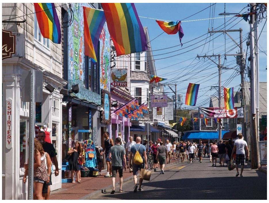
Figure 11: Provincetown, Massachusetts has a long history as an LGBTQ vacation spot, including the Atlantic House, known as a safe spot for gay and queer people as early as the start of the 1900s. It has been an openly LGBTQ bar since the 1950s. Photo by Mararie, 2014.^{148}

vacation. Yet most mainstream resort areas were dominated by heterosexual families and didn't offer the privacy or safety lesbian, bisexual, and gay vacationers desired. Thus within driving distance of many urban LGBTQ centers, there arose particular towns, islands, and spas known for their LGBTQ community.<sup>149</sup> While many of these resort towns were predominantly made by and for white, middle- and upper-class urban gay and bisexual men, lesbians and LGBTQ people of color have also been part of the development of queer vacation destinations.