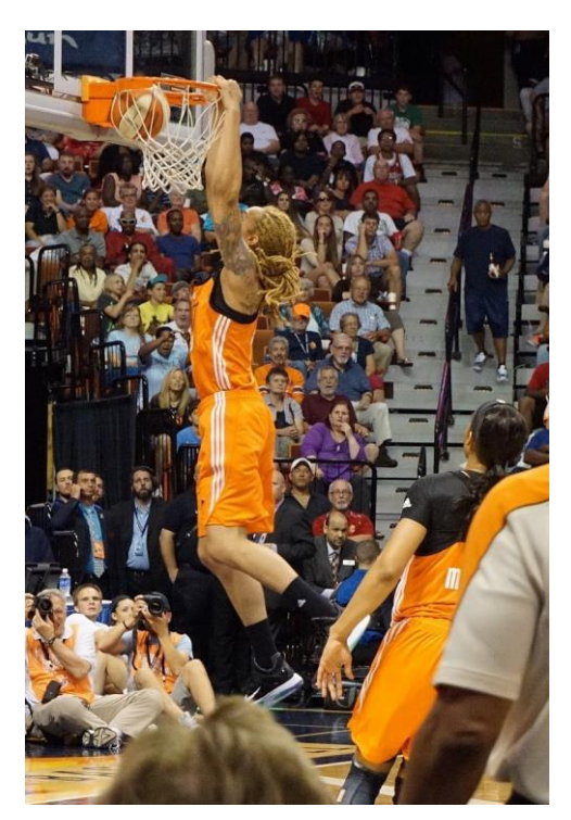
Figure 5: Out lesbian Brittney Griner dunks the ball at the 2015 WNBA All-Star Game at Mohegan Sun in Uncasville, Connecticut.<sup>72</sup>

bigger, my sexuality, everything."<sup>70</sup> Griner continues to challenge expectations of what a female athlete can accomplish, being one of only three WNBA players to dunk and holding a National Collegiate Athletics Association (NCAA) career block record for all players, male and female (Figure 5). In 2013, she was even asked to try out for the National Basketball Association's (NBA's) Dallas Mavericks.<sup>71</sup>