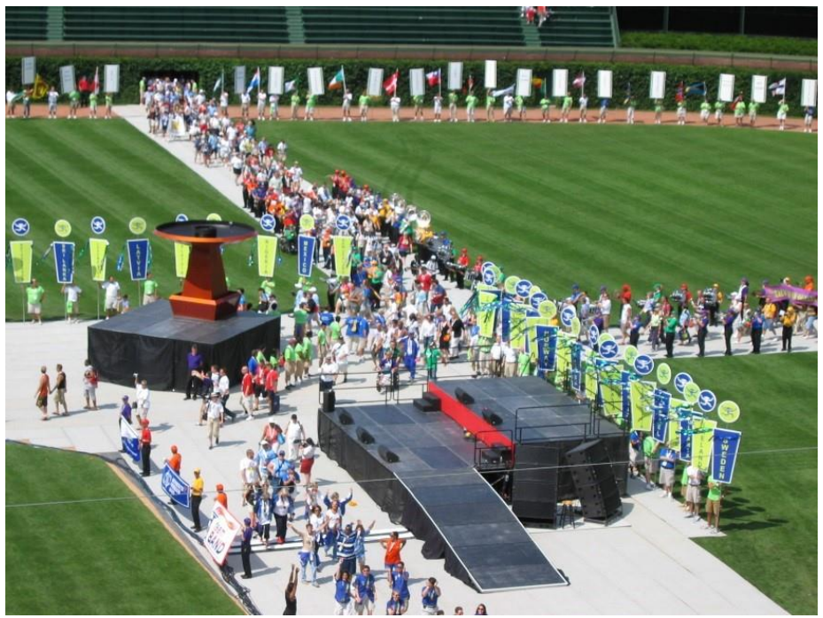
Figure 8: The Closing Ceremonies of the 2006 Chicago Gay Games held at Wrigley Field. ^{\tt 116}

1982 was a huge success.<sup>117</sup> The Gay Games, as it is now called, emphasizes sportsmanship, personal achievement, and inclusiveness over competitiveness or nationality (Figure 8).<sup>118</sup> Events were open to anyone interested, and alongside traditional Olympic sports the Gay