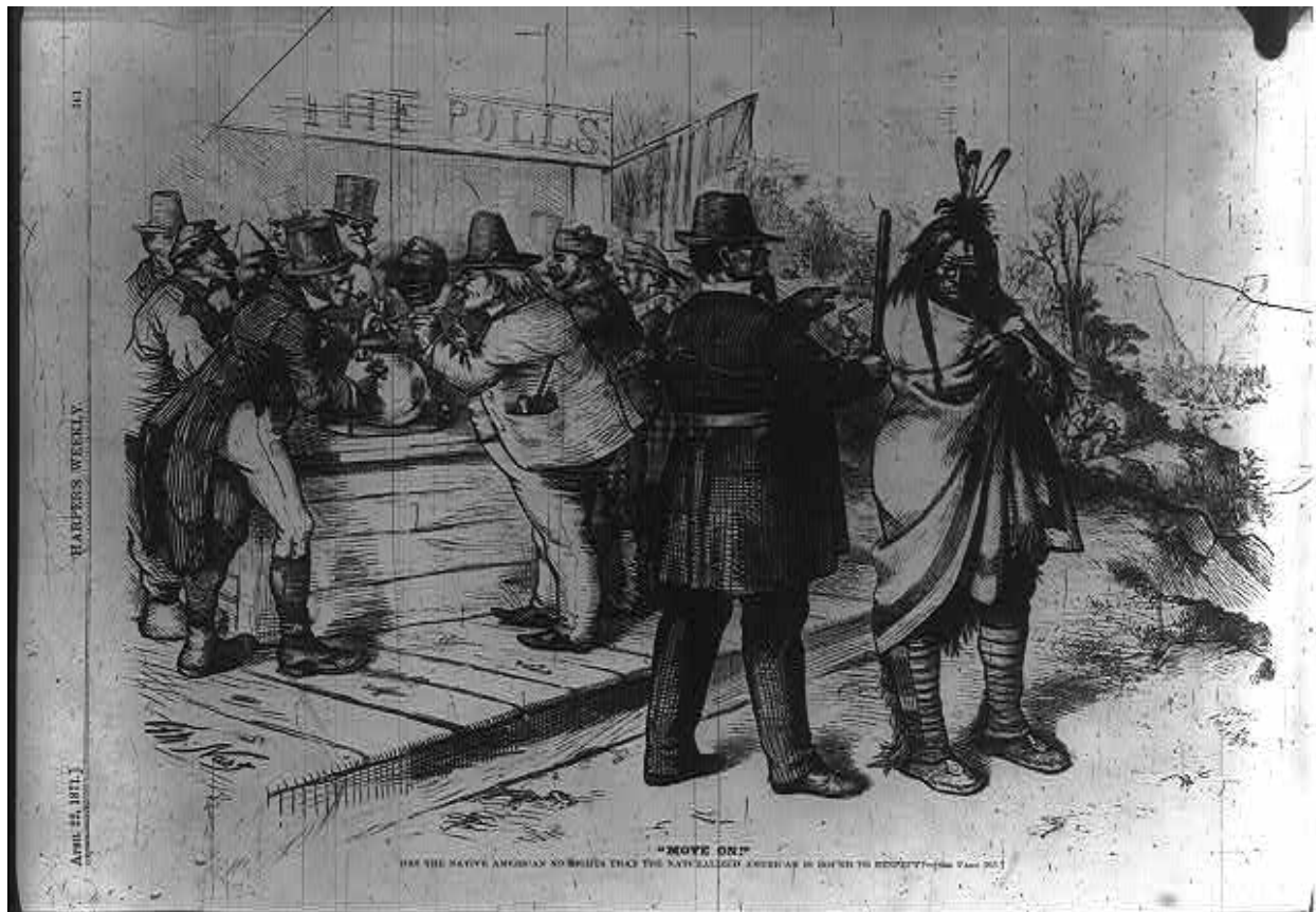
“Move on!” Has the Native American no rights that the naturalized American is bound to respect?” A policeman ordering a Native man to “move on” away from a voting poll. From Harper’s Weekly, April 22, 1871.