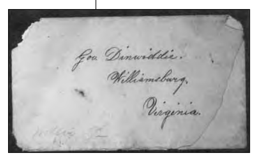
A letter to Governor Dinwiddie